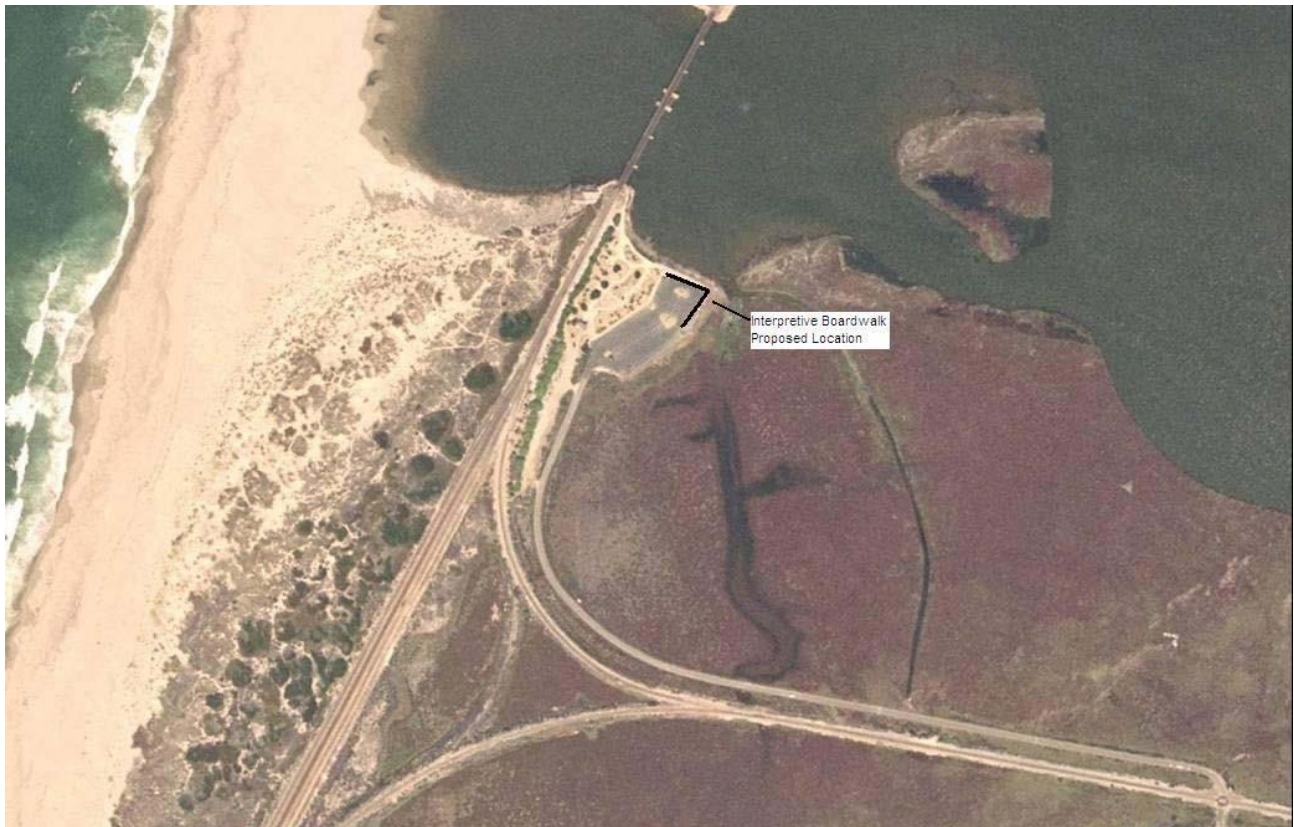
Figure 1: Ocean Beach County Park, Interpretive Boardwalk Location

The park property is approximately 36 acres in size. Visitor use of the park is estimated at 18,000 vehicle trips per year resulting in approximately 45,000 visitors per year. The proposed project will eliminate 10% (10 spaces) of the existing parking lot space to accommodate the proposed construction of the boardwalk. The decreased number of parking spaces should not affect the proposed project because the average current use of the parking lot is only 80% of the total capacity.