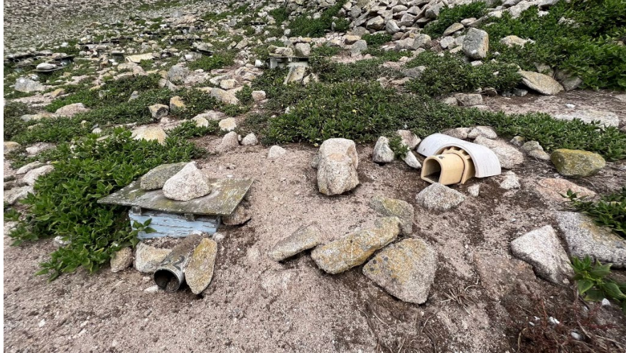
Figure 1. Final design for the climate smart nest modules (right) next to an old style shaded wooden nest box (left).