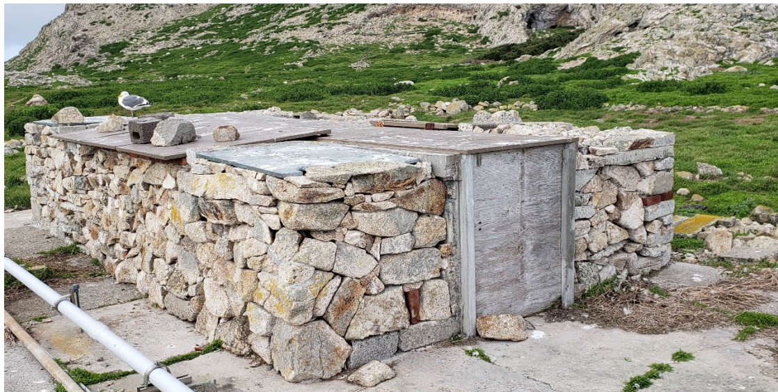
Figure 3. Artificial storm petrel habitat (Ashy Castle) on the Farallon Islands National Wildlife Refuge.