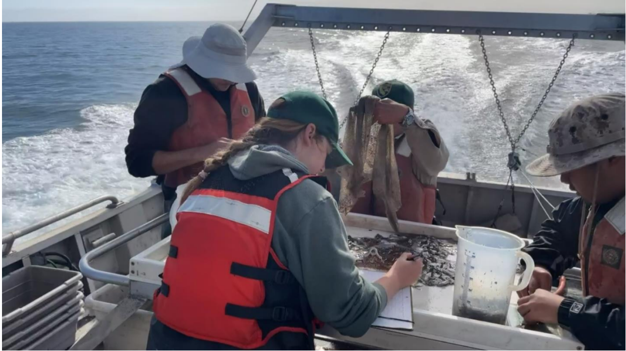
California Department of Fish and Wildlife staff sorting and recording catch from the Bay Study.