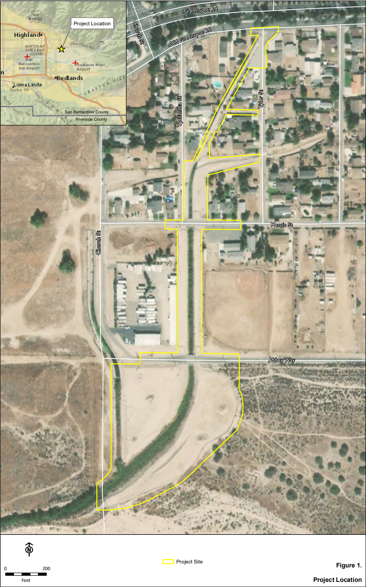
Figure 1. Project Location