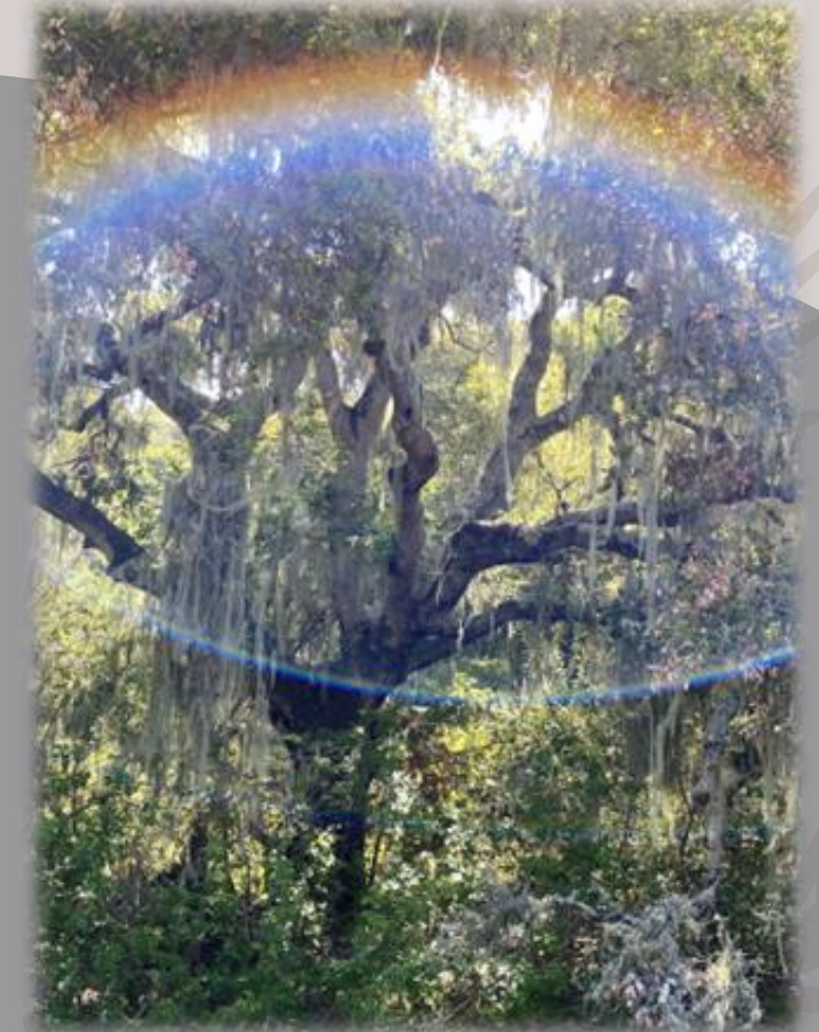
Burton Mesa Ecological Reserve Santa Barbara County