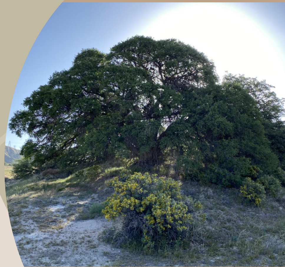
Peace Valley (proposed Ecological Reserve)