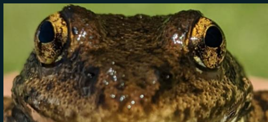
Permitting and CEQA Exemptions