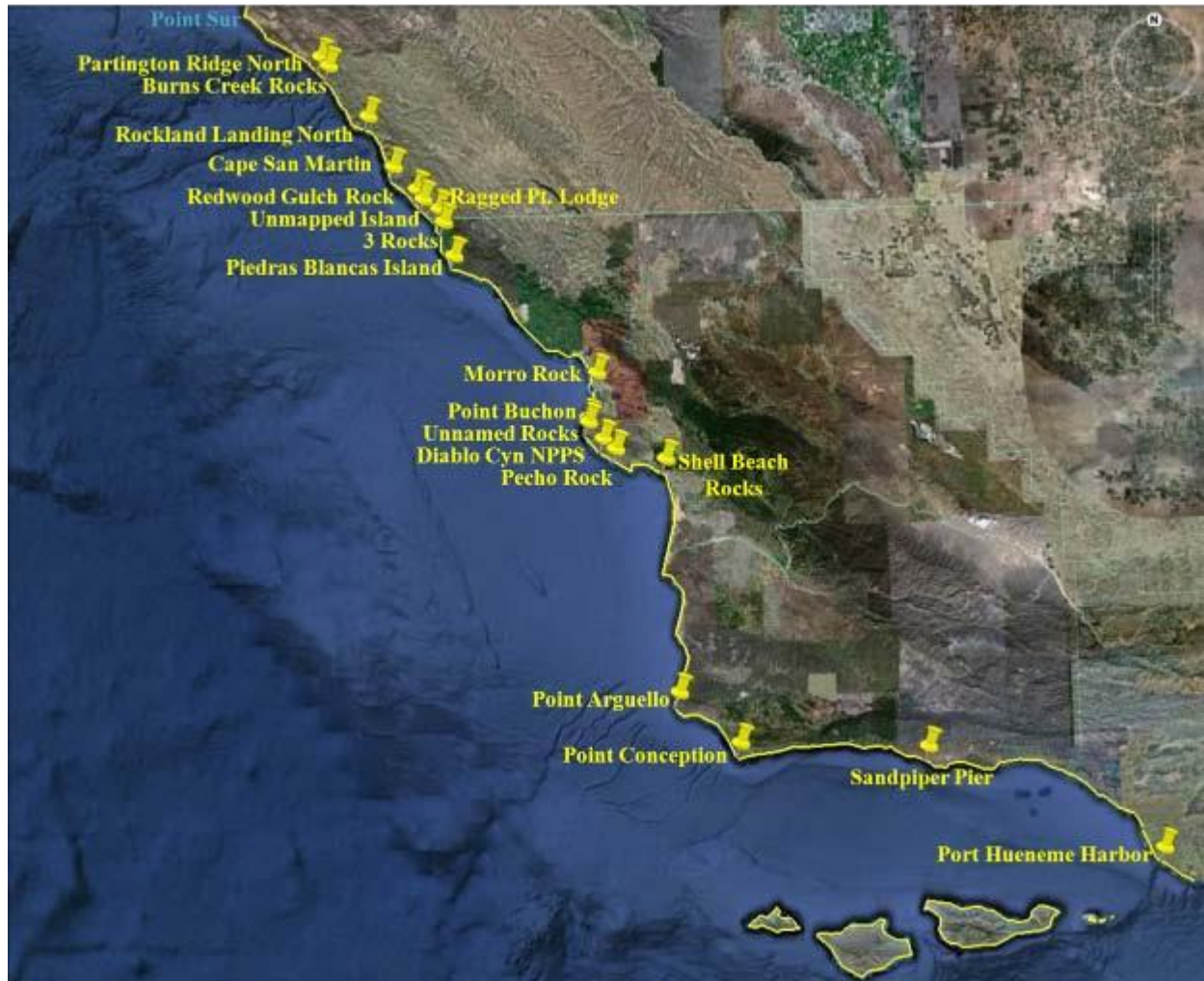
Figure 1. Locations of Brandt's Cormorant breeding colonies known to be active in coastal south central California in 2010.