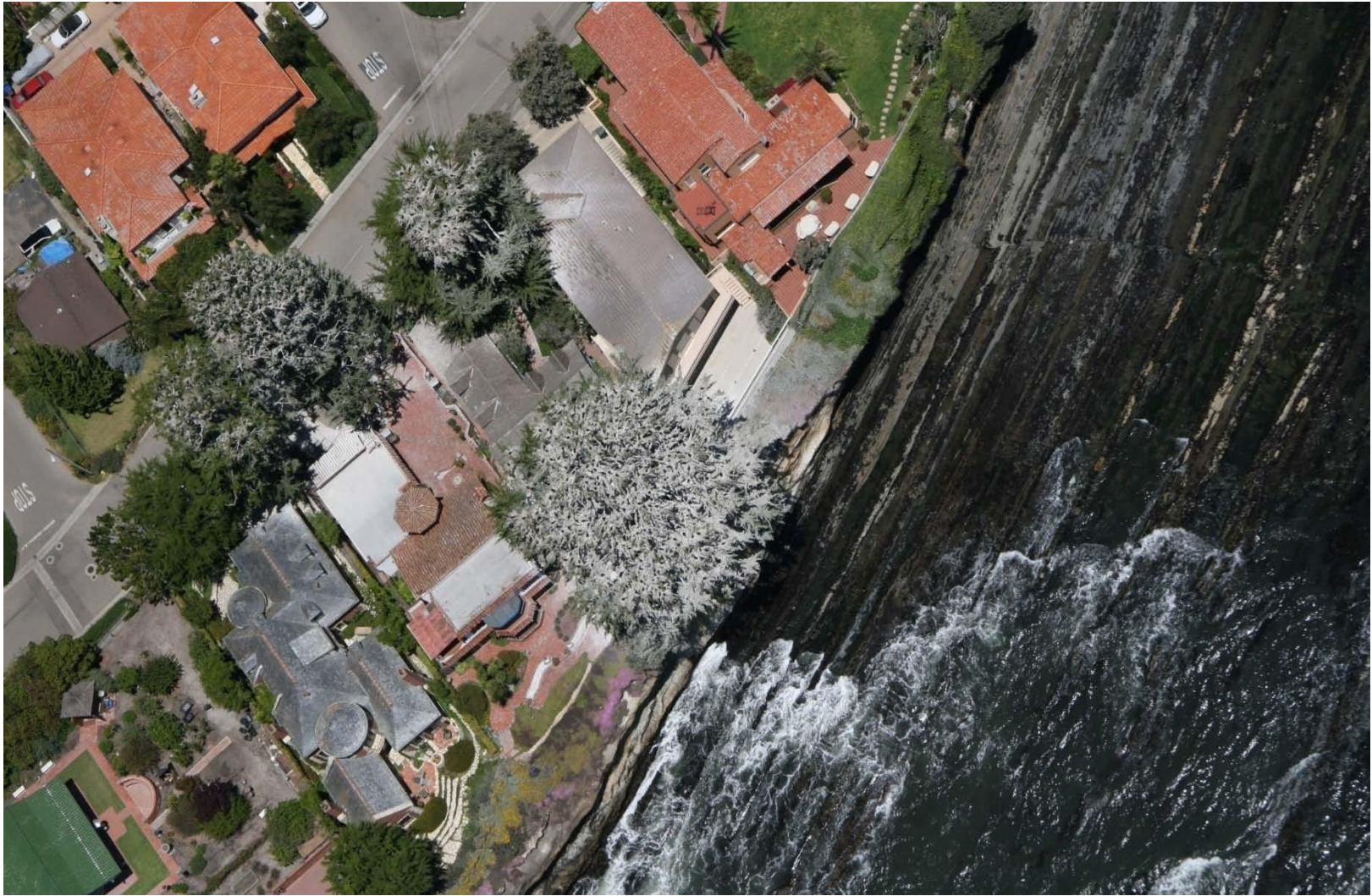
Figure 3. Overview photograph of Double-crested Cormorant nest trees on the mainland at Shell Beach Rocks, Subcolony 10, 3 June 2010.