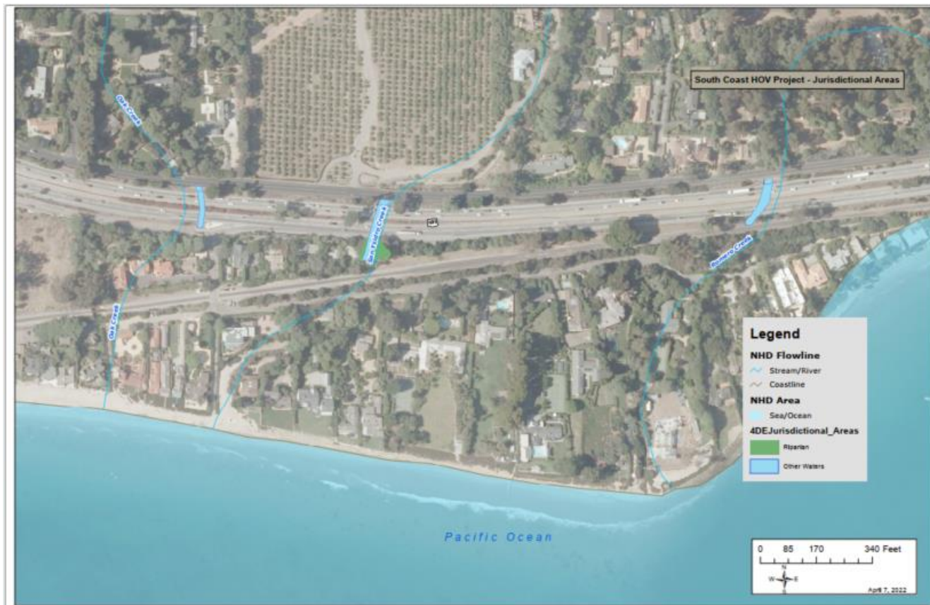
Figure 1. Map of Project Locations

The Highway 101 Carpinteria to Santa Barbara Project Segment 4D Montecito (Project) is located on State Route 101 where it crosses Romero, San Ysidro, and Oak Creeks in the County of Santa Barbara (Figure 1). The coordinates are 34.421189, -119.62007; 34.420937, -119.623801; and 34.421021, -119.625559.