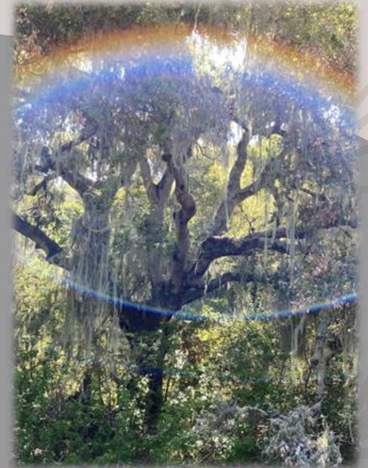
Burton Mesa Ecological Reserve Santa Barbara County