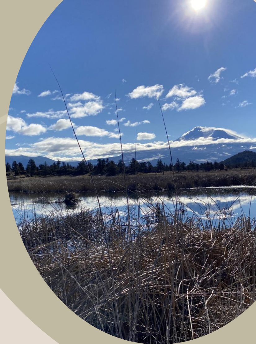
Big Springs Ranch proposed Wildlife Area