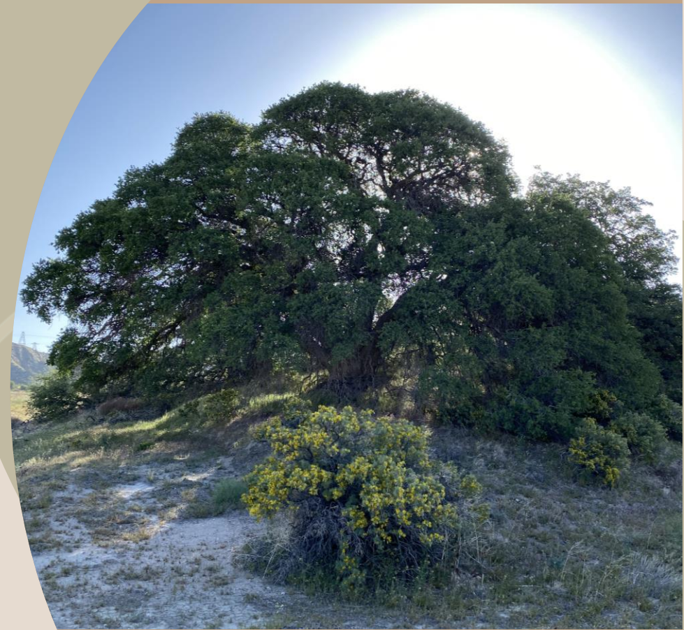
Peace Valley (proposed Ecological Reserve)