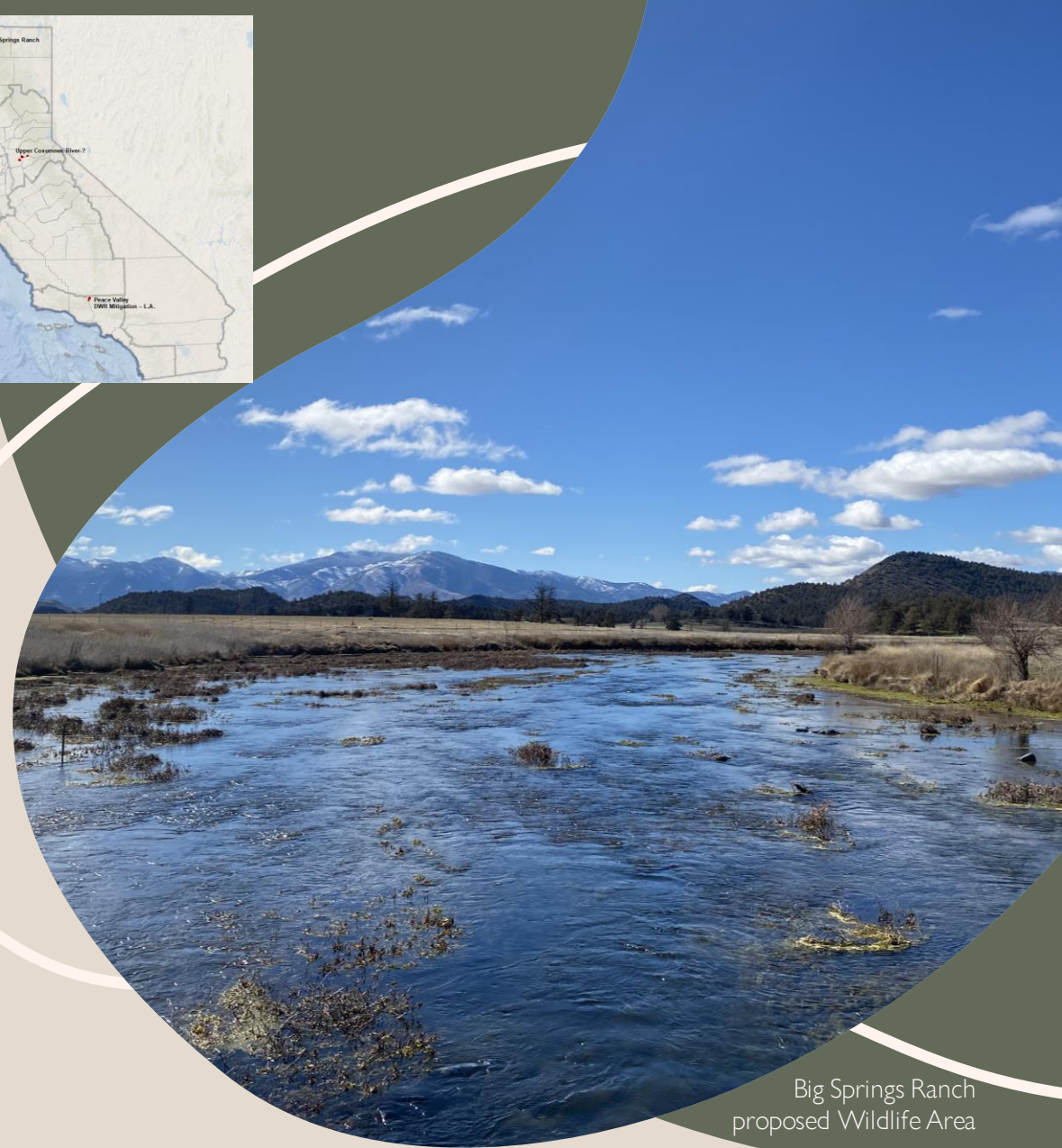
Big Springs Ranch proposed Wildlife Area