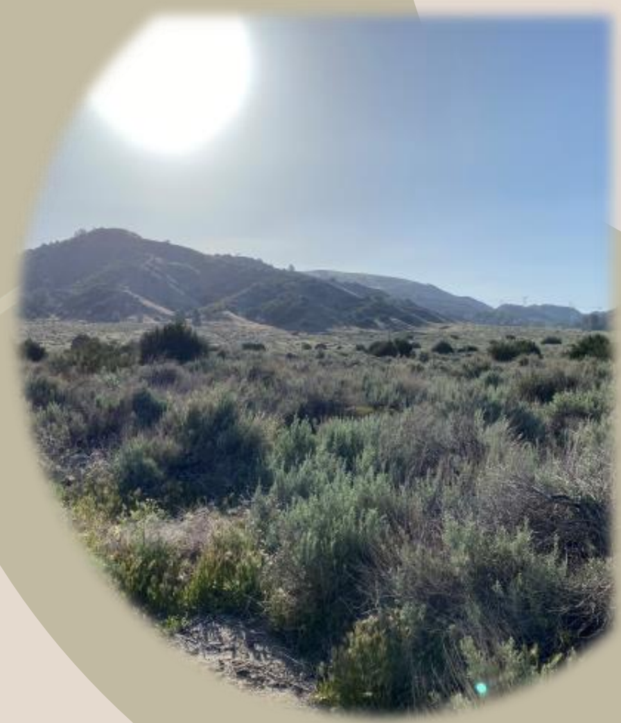
Peace Valley proposed Ecological Reserve