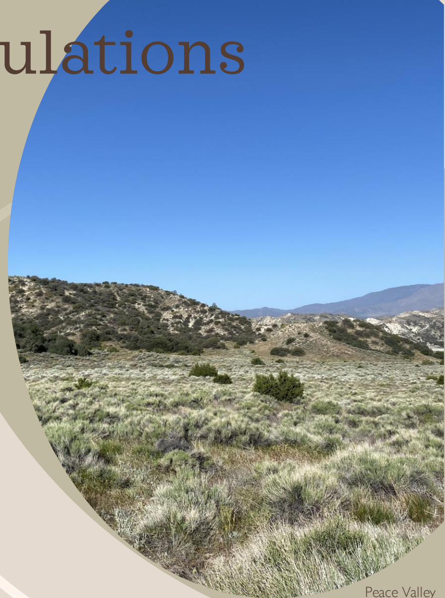
Peace Valley proposed Ecological Reserve