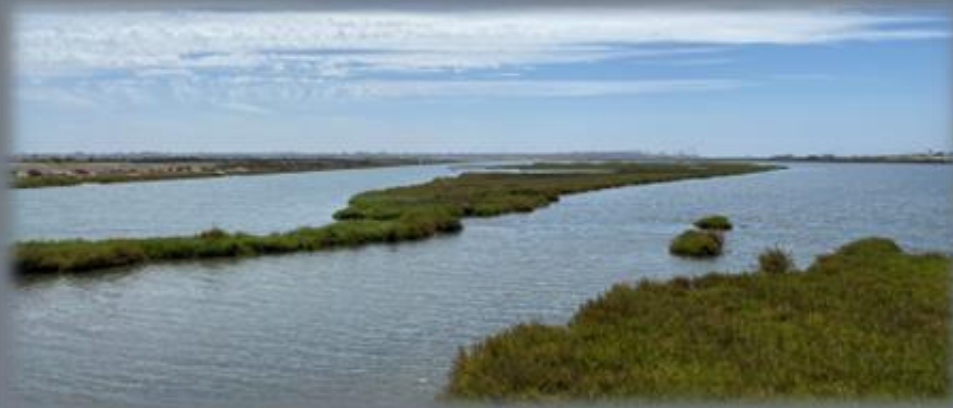
Bolsa Chica Ecological Reserve Orange County