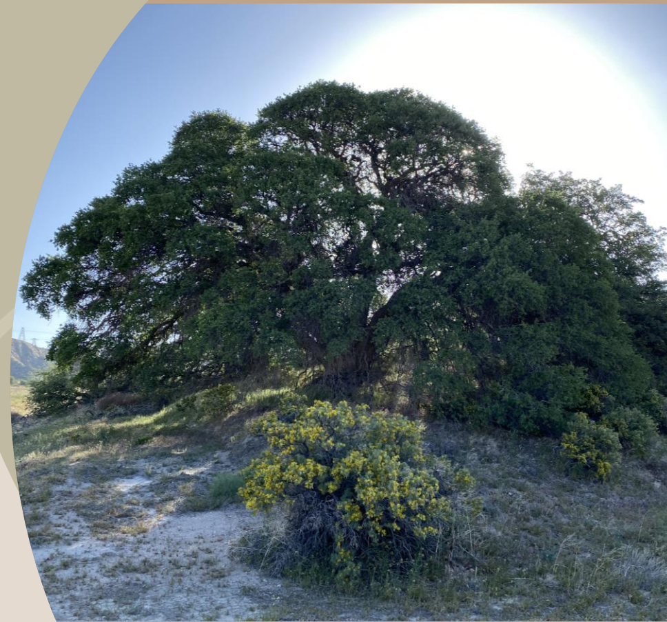
Peace Valley proposed Ecological Reserve