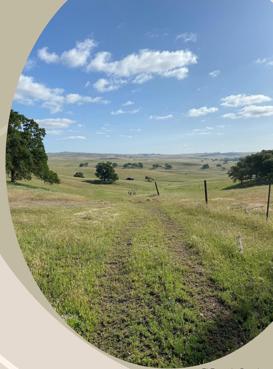
El Dorado Ranch proposed Wildlife Area