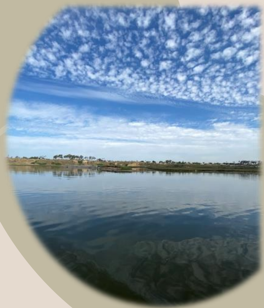
Upper Newport Bay Ecological Reserve Orange County