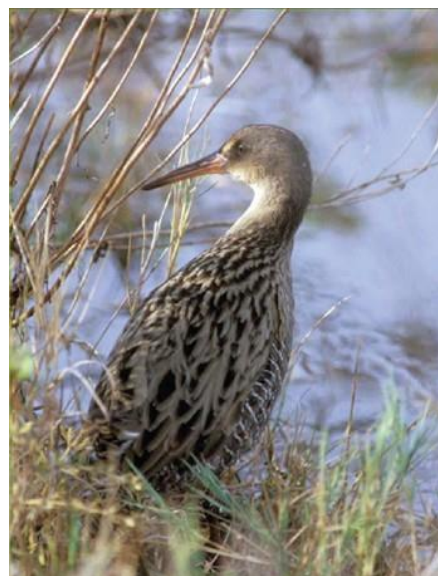
Endangered Ridgway's rail