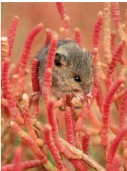
Salt marsh harvest mouse

Cullinan Ranch, located on 1,575 acres near the northern shore of San Pablo Bay in Solano and Napa counties, is being restored to tidal wetlands. The restoration will provide habitat for many species, including the endangered Ridgway's rail, salt marsh harvest mouse, and migratory salmonids. In the 1880s, levees were built around the tidal wetlands in order to drain the land for hay and oat farming. Plans for development of the property were halted in the 1980s. Purchased by the U.S. Fish and Wildlife Service (USFWS) in 1991, Cullinan Ranch is now managed as part of the San Pablo Bay National Wildlife Refuge. The Castro Cove Trustees contributed $1.70 million to help restore the site to tidal habitat. Most of the funds were used to build a long flood control levee to both enhance habitat and protect Highway 37 from tidal fluctuation. The California Wildlife Conservation Board, NOAA, USFWS, Ducks Unlimited and others also provided funding. Tidal waters returned to Cullinan Ranch in January 2015 when several portions of the old levees were breached. The 15-year monitoring period began in 2015. Tidal wetland vegetation is slowly colonizing the lowered levees. Many fish species as well as birds, such as herons, egrets, shorebirds, dabbling ducks and diving ducks are using the breached areas.