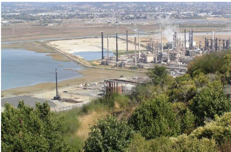
Southern Castro Cove and Chevron Richmond Refinery

From the early 1900s until 1987, the Chevron Refinery in Richmond, California, released wastewater into Castro Cove, part of the San Francisco Bay Estuary. Years later some of the sediments in the Cove still had high levels of contamination. In 1999, the California Regional Water Quality Control Board identified the Cove as a regional toxic hot spot. Chevron removed the contaminated sediments under a Water Board order in 2010. Meanwhile the Castro Cove Natural Resource Trustees worked with Chevron to conduct a natural resource damage assessment (NRDA) to determine appropriate restoration to compensate for injuries to Castro Cove's habitat, fish, and wildlife. In 2010, Chevron agreed to a legal settlement with the Trustees. The settlement included $2.65 million to fund habitat restoration projects that would improve ecological function of tidal marsh habitats that are similar to the injured habitat in Castro Cove. Two restoration projects in San Pablo Bay, Dotson Family Marsh (formerly Breuner Marsh) and Cullinan Ranch, were selected by the Trustees with input from the public. This Update reports on the significant success achieved by both projects.