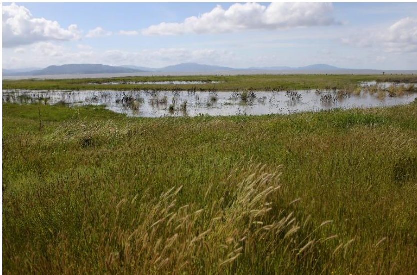
Dotson Family Marsh restoration site (Credit: Photo Courtesy of East Bay Regional Park District, Oakland, California).

The project removed debris, excavated fill material and created new tidal sloughs. In late 2014, levee removals allowed the tide waters to return to the marsh. Restoration is providing increased habitat for tidal marsh species, benefiting wildlife including the Ridgway's rail and the salt marsh harvest mouse. A new pedestrian and bike path closed a 1.5 mile gap in the San Francisco Bay Trail. Public parking, restrooms, trails, picnic facilities, and interpretive exhibits also were constructed. Dotson Family Marsh formally opened to the public in the spring of 2017. Tidal marsh vegetation has been increasing each year. The tidal marsh restoration met its 5-year performance monitoring standards. East Bay Regional Park District will continue monitoring the tidal marsh through 2025. With sea level rise, it is anticipated that additional acres will return to tidal marsh.