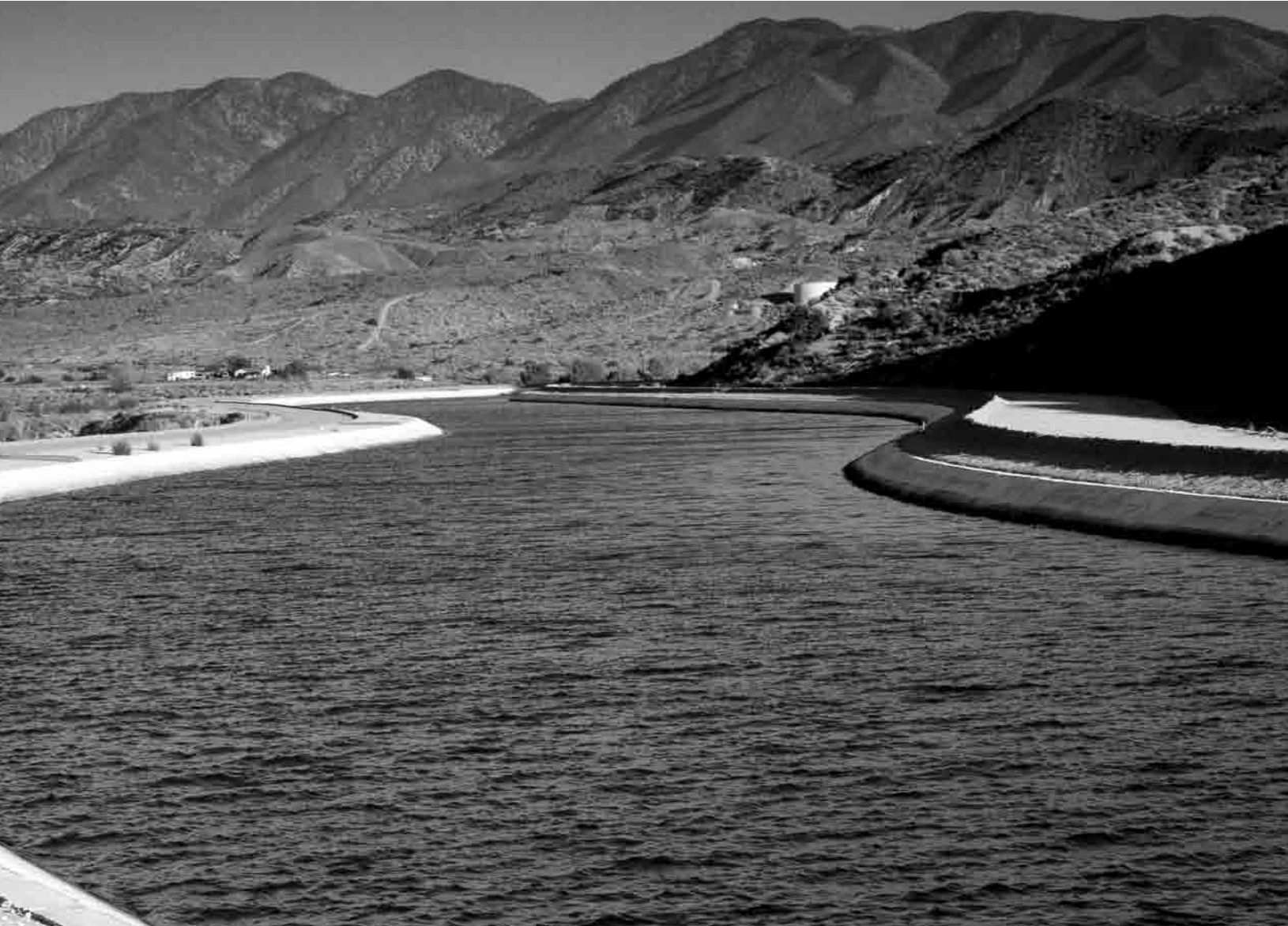
East Branch Aqueduct with mountains in the background