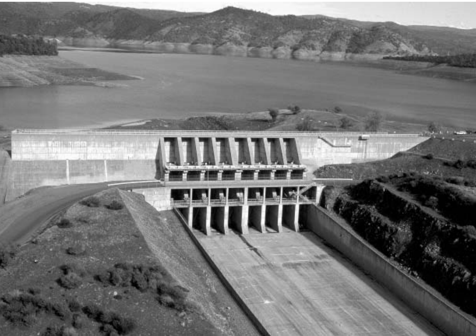
Oroville Dam spillway