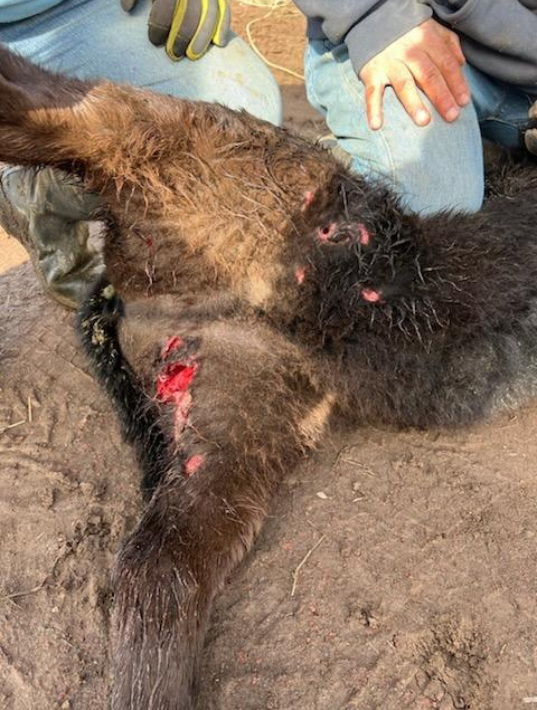
Page 1 of 1