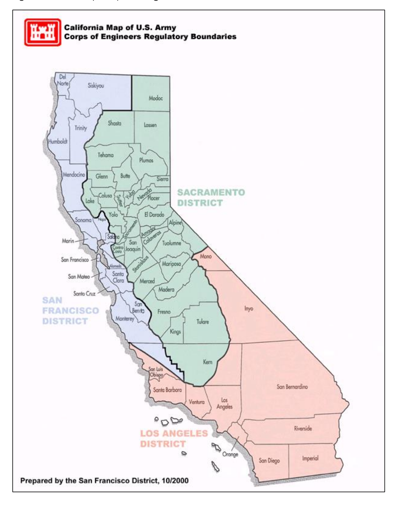
Figure 1. U.S. Army Corps of Engineers Districts.