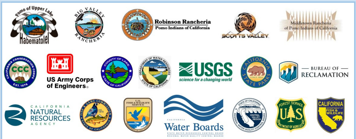
Figure 4. Collaborative partners in the Clear Lake Hitch conservation effort.

Feyrer, F. (2019). Observations of the spawning ecology of the imperiled Clear Lake Hitch. California Fish and Game 105(4): 225-232.