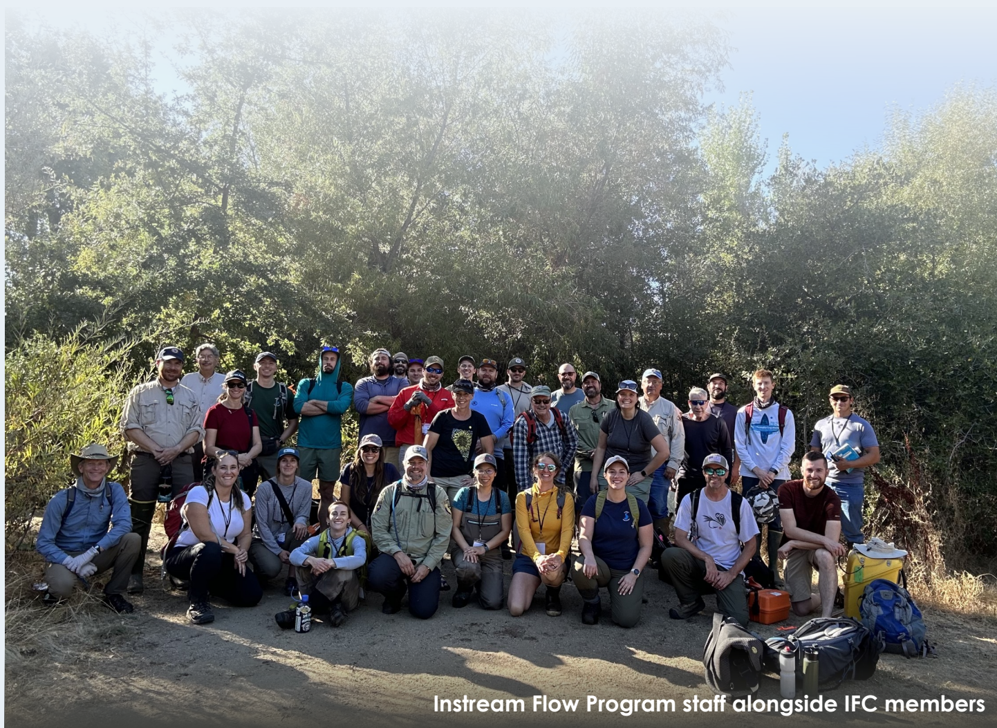
Instream Flow Program staff alongside IFC members

The workshop consisted of two in-person days and was completed with a virtual meeting in early 2024.