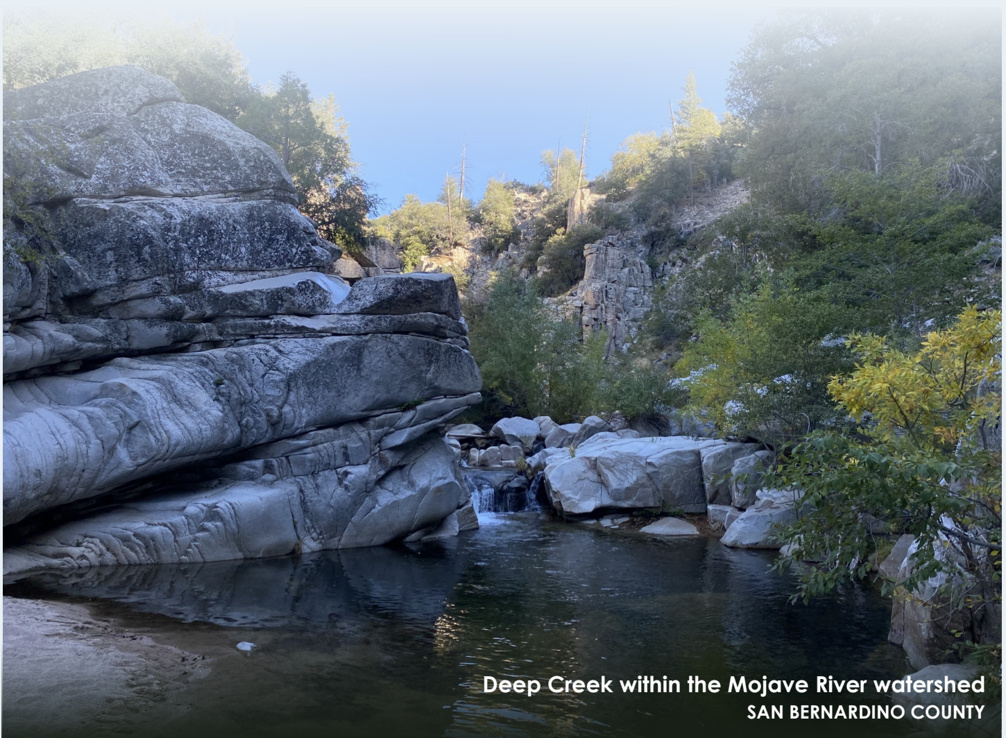
Deep Creek within the Mojave River watershed SAN BERNARDINO COUNTY

In 2023, the IFP continued work on the Mojave River Watershed Criteria Report, which consisted of conducting site-specific surveys at three reaches within Deep Creek to assess aquatic habitat over a range of flows. In addition, 25 reaches were selected for desktop hydrologic analyses, resulting in flow criteria for four reaches that may be used as a tool for consideration in water management planning.