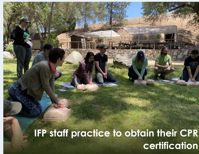
IFP staff practice to obtain their CPR certification

Annual calibration training is an opportunity for staff to refresh their knowledge and promote consistency and accuracy in data collection by practicing standardized field methods. In 2023, IFP staff applied their skills during practical field exercises in a local stream throughout the year. Staff reviewed habitat mapping, discharge data collection, differential leveling, bankfull identification, and topographic survey techniques.