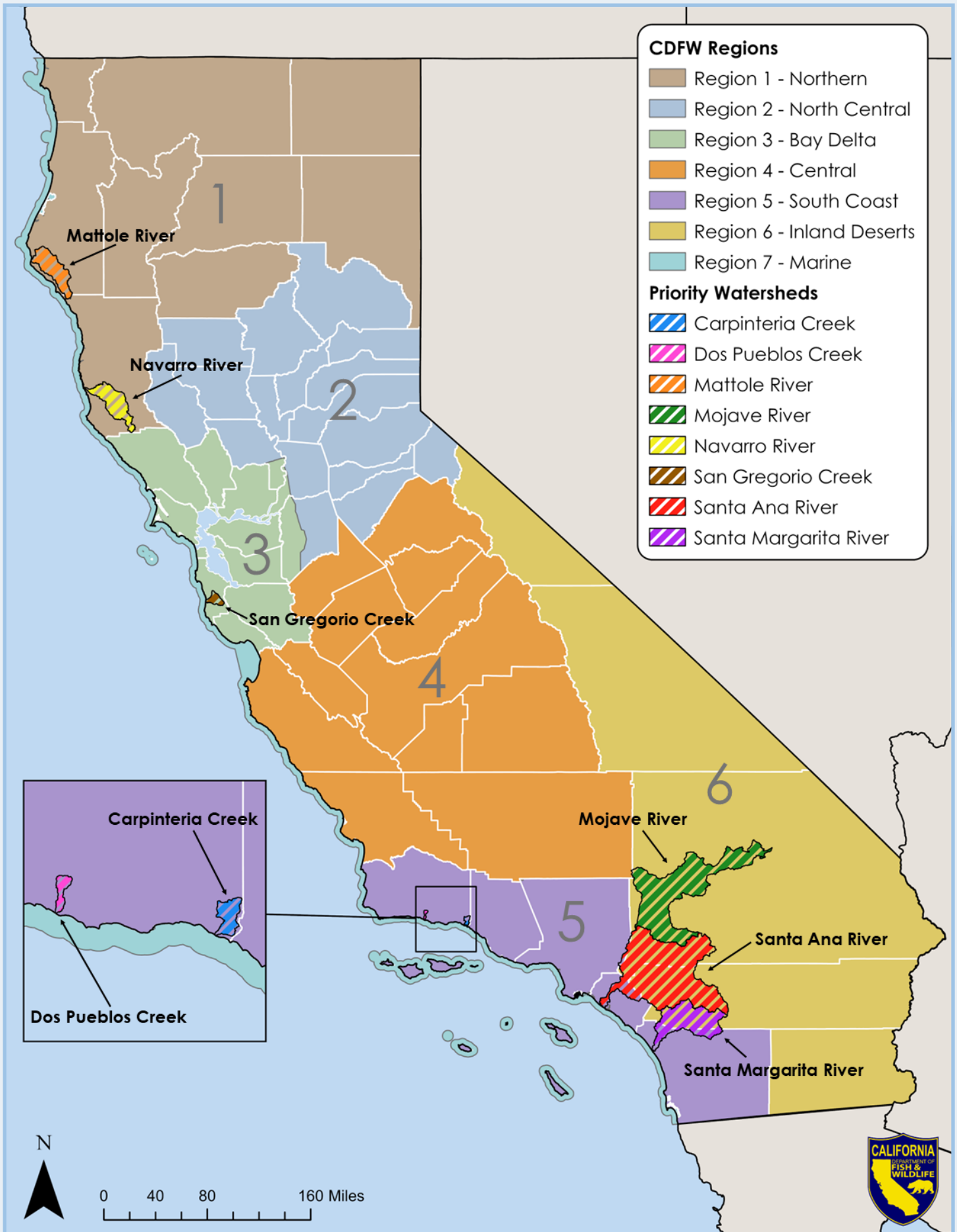
Figure 2. Map of priority watersheds.