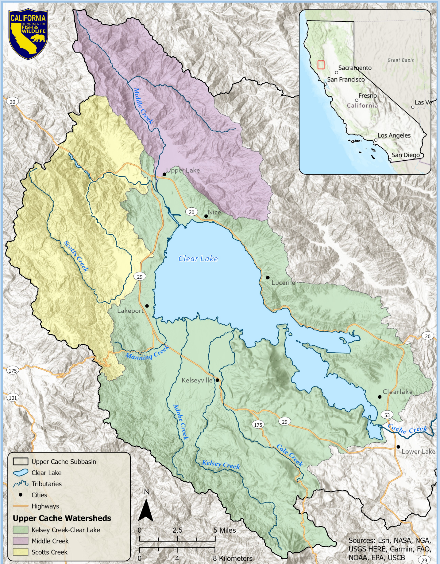
Figure 3. Map of the Clear Lake watershed.