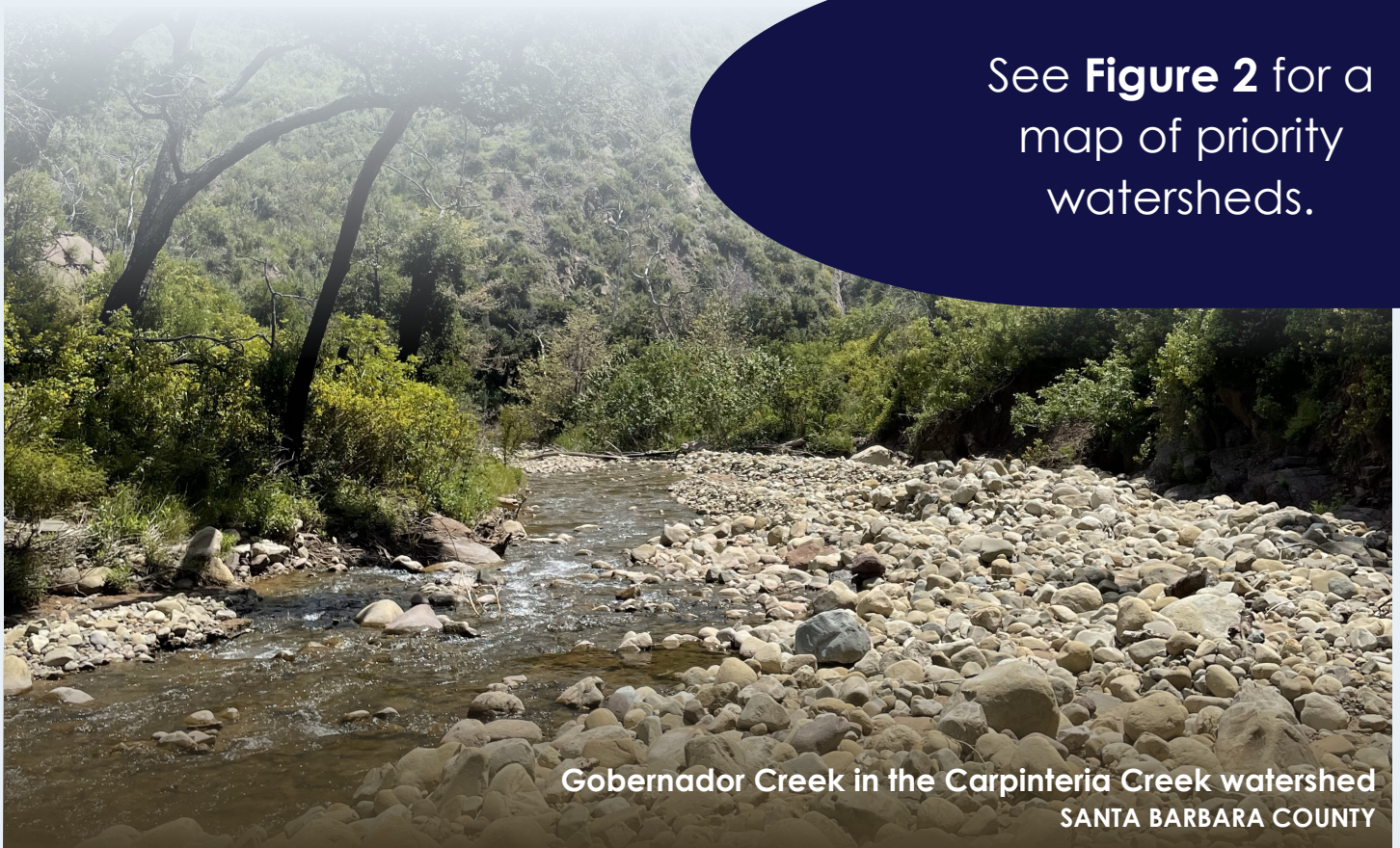
Gobernador Creek in the Carpinteria Creek watershed SANTA BARBARA COUNTY

See Figure 2 for a map of priority watersheds.