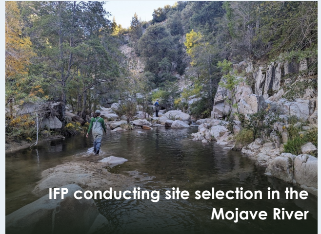
IFP conducting site selection in the Mojave River

The Mojave River watershed in San Bernardino County is listed as a priority stream under the Public Resources Code Section 10004. The watershed provides ample riverine and riparian habitat for endangered species with one of its tributaries, Deep Creek, designated as a Heritage and Wild Trout stream. A history of groundwater pumping, along with increasing urban development, has led to a reduction in streamflow within the watershed. The IFP was tasked with assessing flows that would maintain both aquatic habitat and ecosystem processes throughout the watershed.