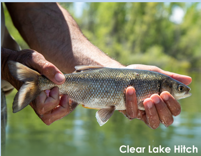
Clear Lake Hitch

The CLH was listed on the California Endangered Species Act list as a threatened species in 2014. In 2023, Governor Newsom signed Executive Order N-5-23 3 directing the Department and the State Water Resources Control Board (SWRCB) 4 to evaluate instream flows to protect the CLH. To address the Executive Order, the Department will conduct a study on Middle, Scotts, Manning, Adobe, Kelsey, and Cole Creeks (Figure 3) to evaluate minimum instream flows for CLH passage.