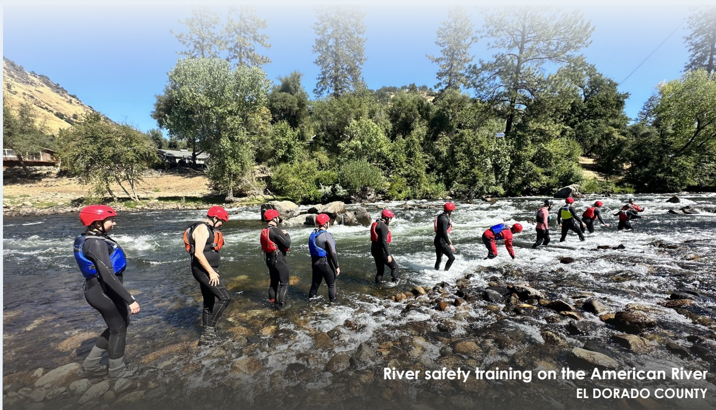
River safety training on the American River EL DORADO COUNTY

Safe practices are also important to the IFP, especially when working in remote areas in and around streams. IFP staff completed a River and Stream Safety course in the South Fork American River to be better prepared for safe field work in riverine environments. Staff developed awareness of hazards for easier prevention of accidents, practiced skills in moving water and safe wading, and learned self-rescue techniques. In addition, IFP staff completed a Wilderness First Aid course to be better prepared for preventing and responding properly to medical emergencies outdoors. In this hands-on training, staff reviewed first aid concepts, practiced basic life support skills, and identified environmental and medical problems through integrated scenarios. Staff received first aid, CPR, and AED certification which met Wilderness Medical Society, American Heart Association, and Occupational Safety and Health Administration standards.