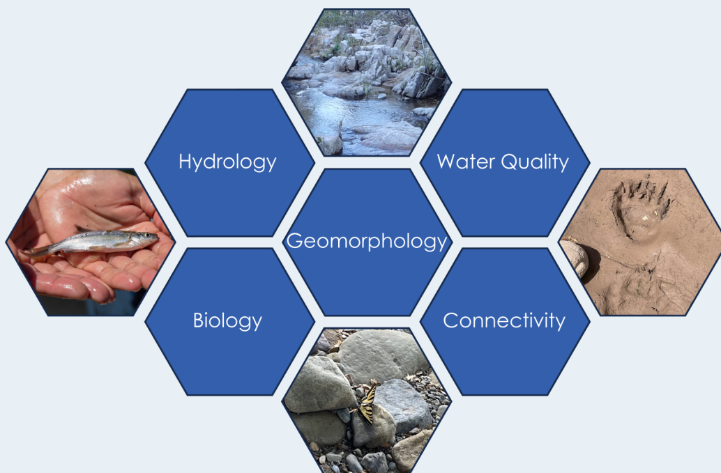
Figure 1. The five riverine components (from Annear et al. 2004).