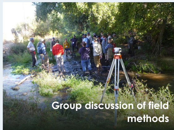
Group discussion of field methods

In October 2023 the IFP hosted members from the Instream Flow Council's (IFC) 1 Western Region for a two-day workshop in Folsom, CA. The IFC is a member organization comprised of fish and wildlife agencies from across the United States and Canada that supports fish and wildlife agencies to better fulfill their public trust responsibilities by improving the effectiveness of state, provincial, and territorial instream flow programs, and activities in conserving aquatic ecosystems. The IFP has been a member of the IFC since its creation in 1998. The goal of this workshop was to learn, discuss, and perform instream flow science and field techniques aimed at making instream flow recommendations.