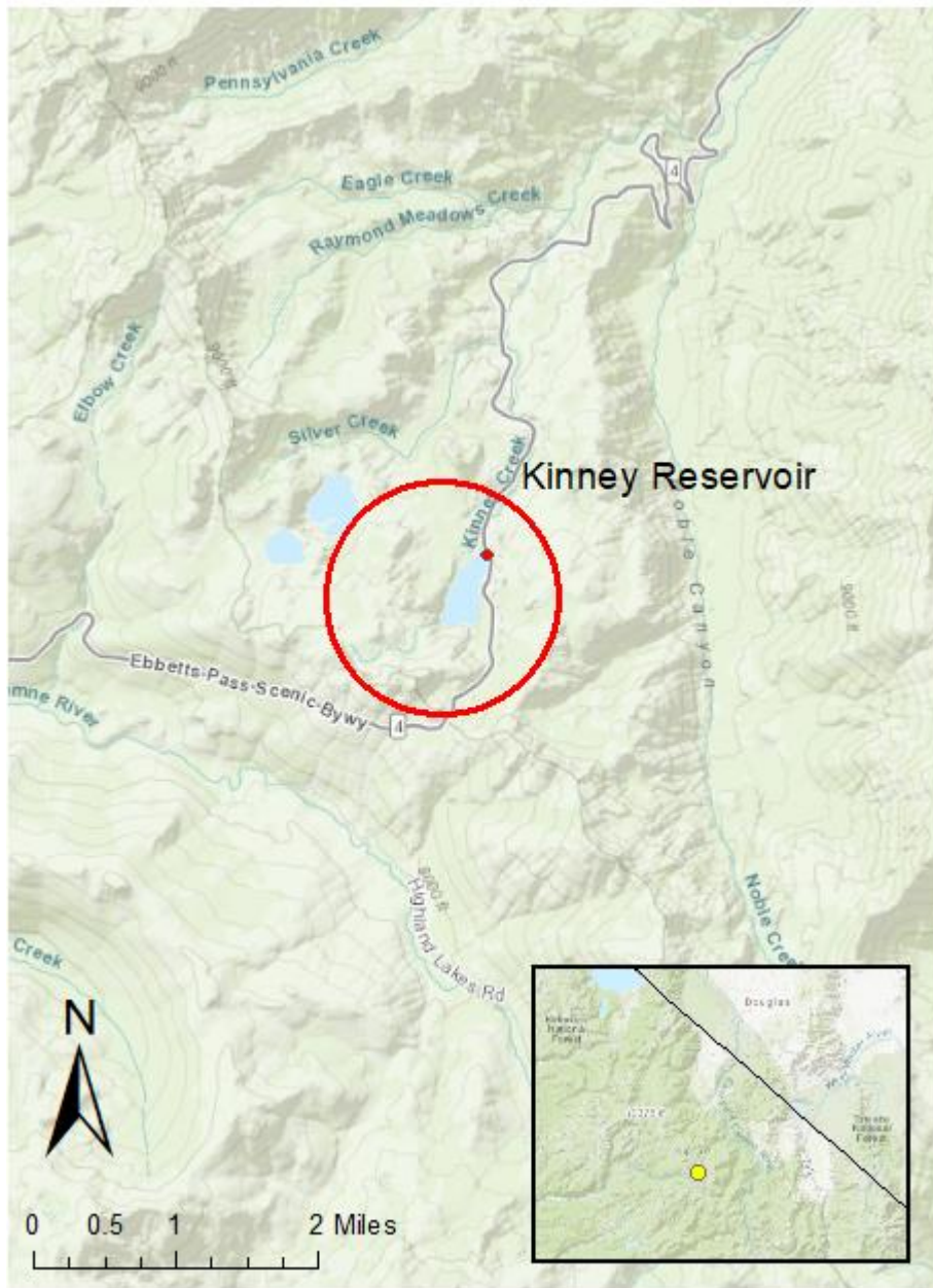
Figure 1. Kinney Reservoir (circled in red), Alpine County. Location of the Angler Survey Box is indicated by the red dot within red circle. Kinney Reservoir is also indicated by yellow dot in smaller data frame in relation to Lake Tahoe.