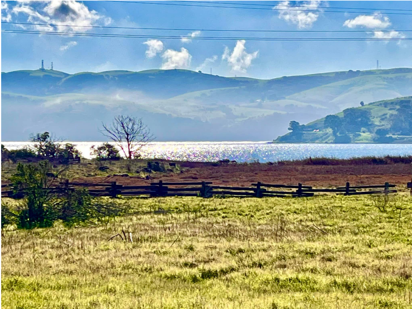
Benicia State Park looking out at Southampton Bay Benicia waterfront homes