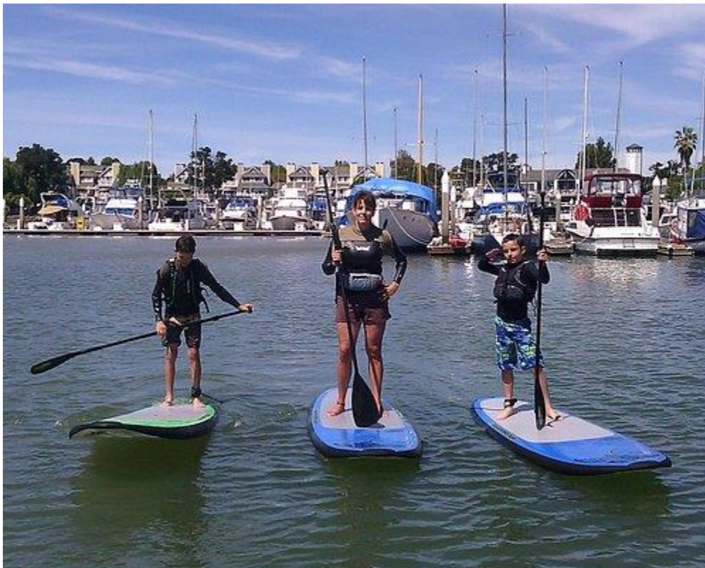
Benicia Kite & Paddleboard rentals