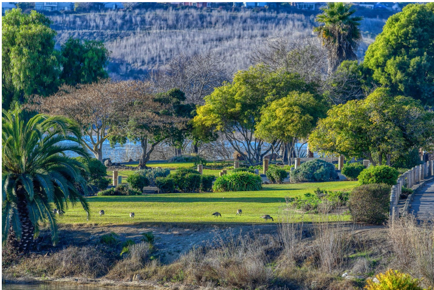
Benicia shoreline park overlooking Southampton Bay