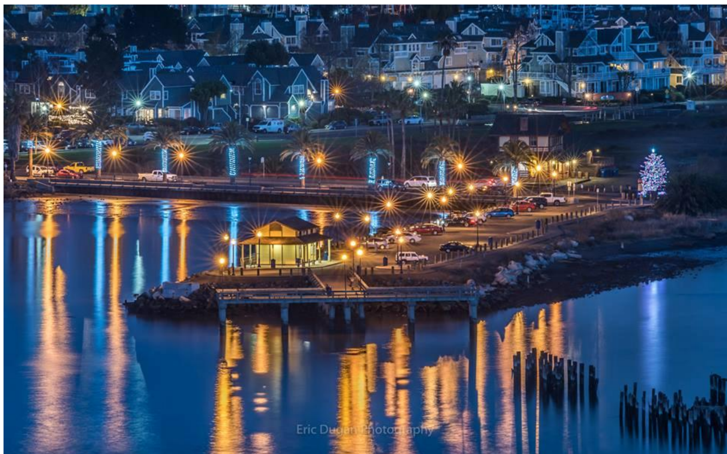
Downtown Benicia at night