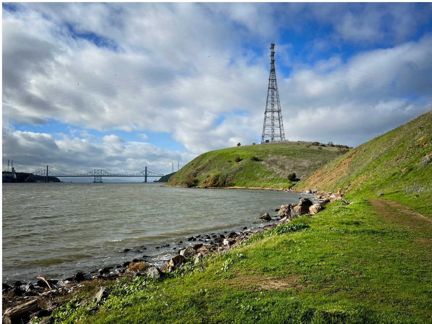
Southampton Bay- Benicia State Park