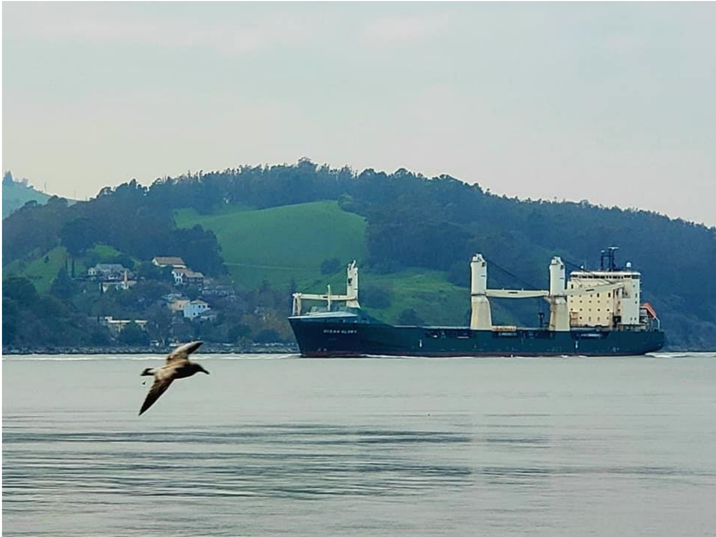
Commercial shipping channel next to Southampton Bay