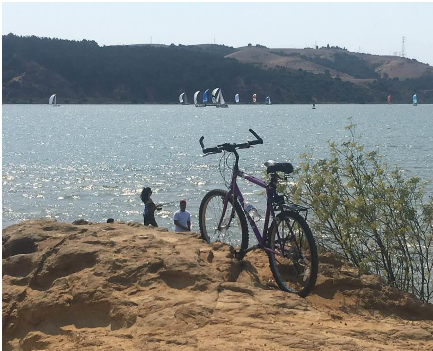
Benicia is "A Great Day by the Bay"