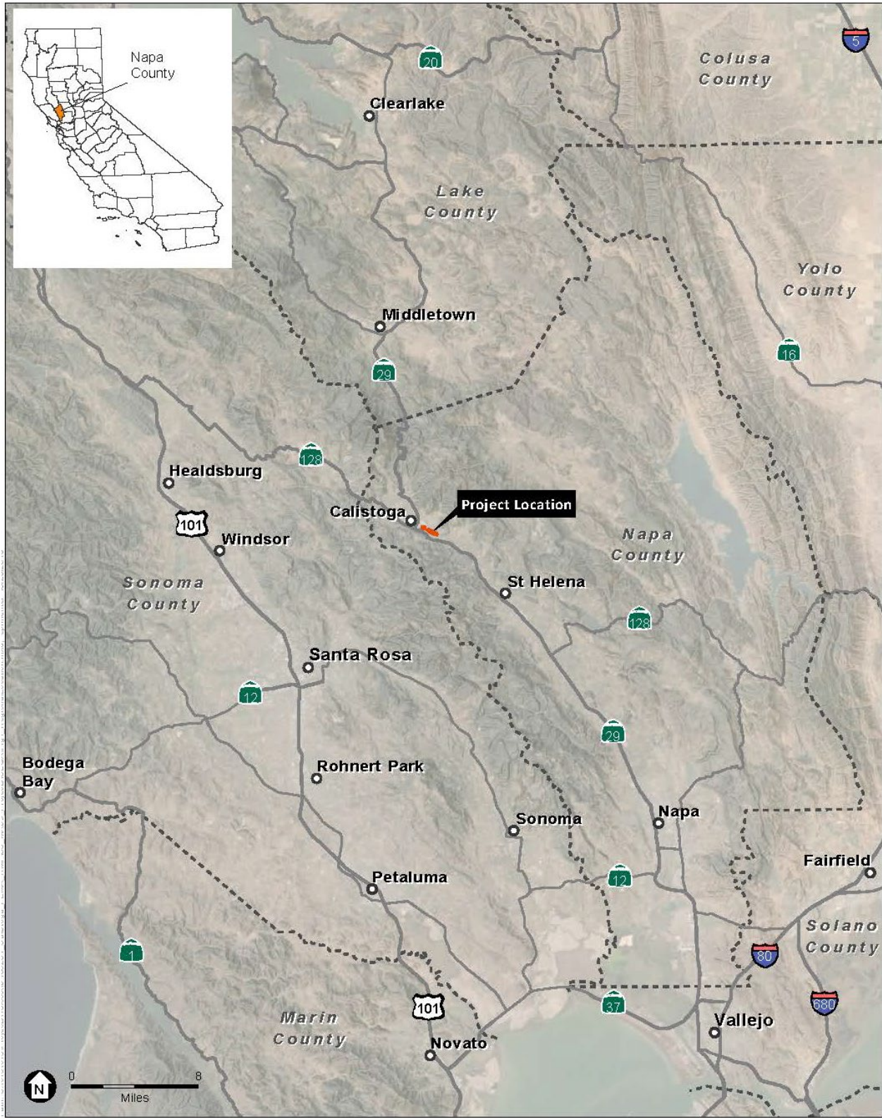
Figure 1 Regional Location