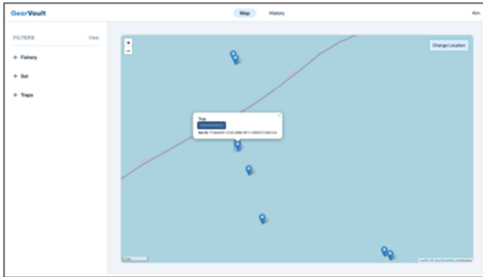
Figure 3. Sustainable Seas Technology, Gear Vault Dashboard.

7. The location and timing of the project. The description must include trip specifications, such as fishing depth, anticipated number of trips, expected trip duration, and estimated number of hauls and average soak time (for fixed gear) or estimated number of tows/sets to be made per day, and estimated duration and speed per tow (for mobile gear). For project vessels listed in Section F of this document, the description must also identify any fishing activity that is expected to occur on the same trip as the project for purposes other than those provided by the EFP (e.g., fishing before and/or after the EFP activities).