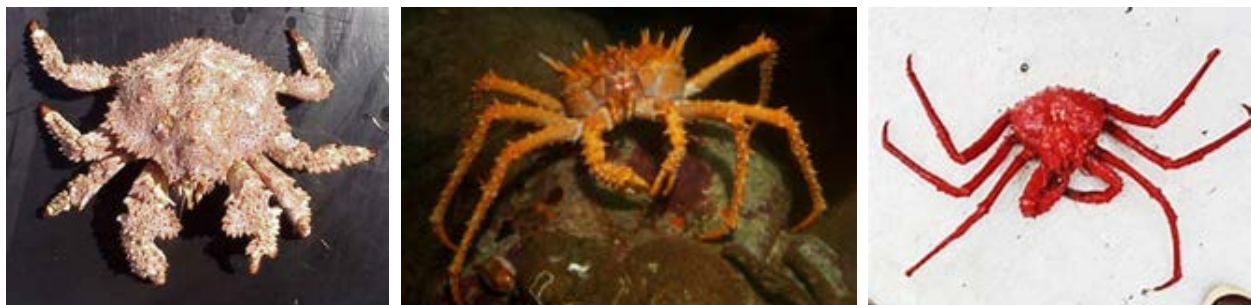
Figure 1. Target species including (left) Brown Box Crab ( Lopholithodes foraminatus ), (center) California Spiny King Crab ( Paralithodes spp.), and (right) Scarlet King Crab ( Lithodes couesi ).