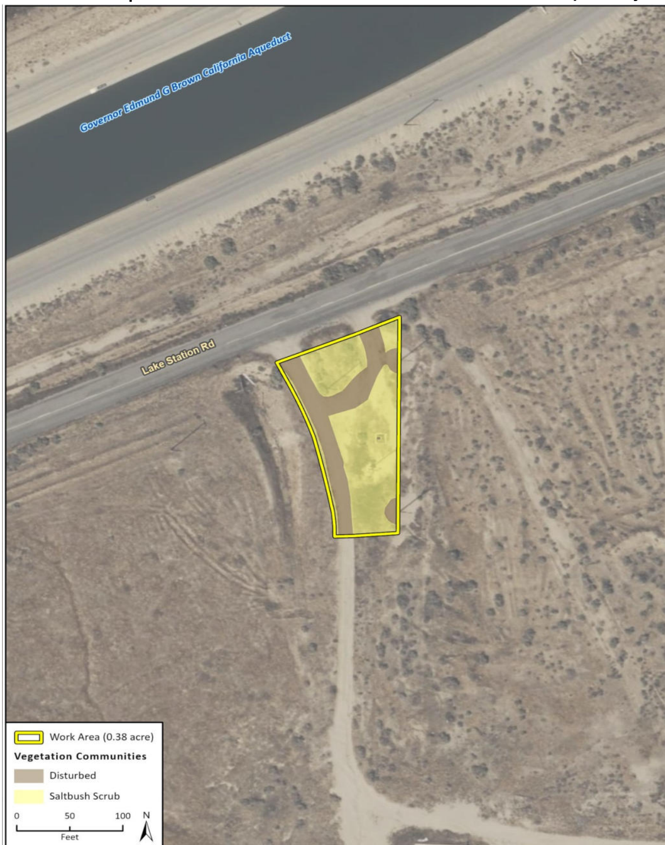
Figure 3 Covered Species Habitat Disturbance Map