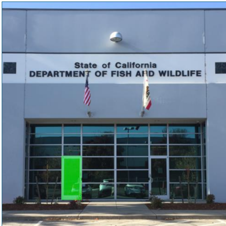
Figure 2. Main entrance to the building. The left (green colored) door is for the public.