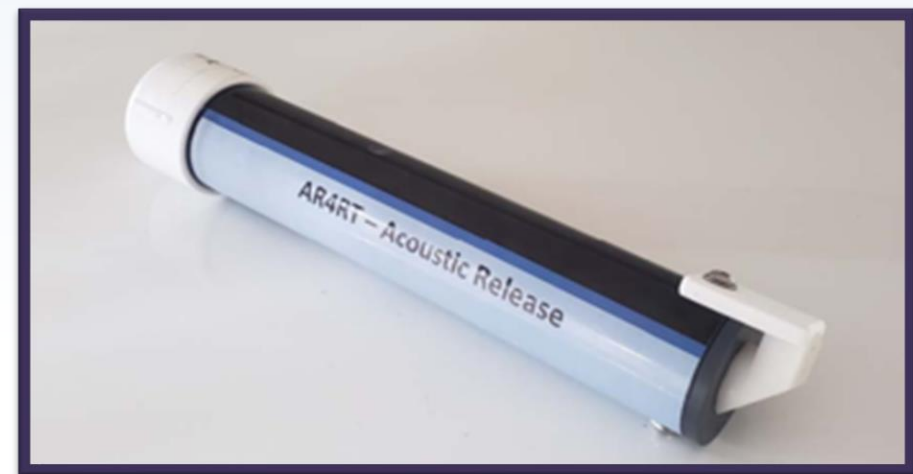
Figure 2: Acoustic Pop-up unit AR4RT