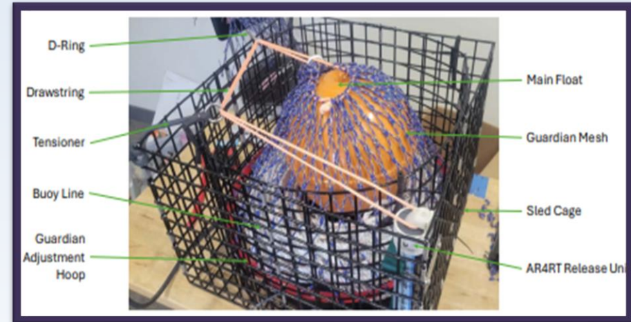
Figure 1: Mid-water sled