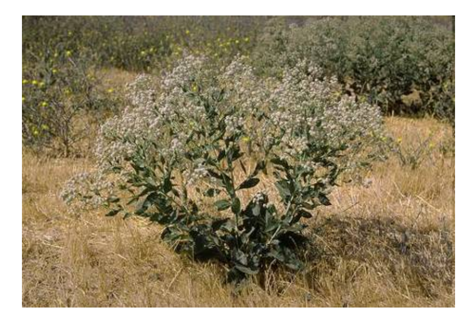
Figure 7. Perennial Pepperweed (Lepidium latifolium)