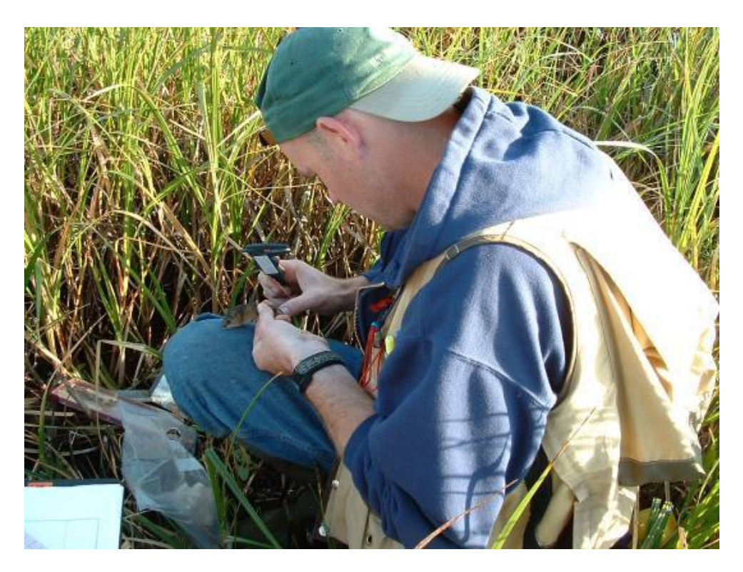
Figure 4. Small mammal survey.

Several types of studies were undertaken to characterize, quantify, or document injury (see Appendix A for selected photographs of injured resources). The data came from water chemistry, sediment chemistry, vegetation surveys (on-ground and aerial), a bird survey, fish surveys, macroinvertebrate surveys, a larval fish survey, and salt marsh harvest mouse (SMHM) surveys. Several avian species were directly affected by the spill including mallard (Anas platyrhynchos), teal sp. (Anas), semipalmated plover (Charadrius semipalmatus) and western sandpiper (Calidris mauri). Other species identified at the spill site included American bittern ( Botaurus lentiginosus ), goldeneye sp. (Bucephala sp.), Virginia rail (Rallus limicola), Allen's hummingbird (Selasphorus sasin), loggerhead shrike (Lanus ludovicianus), common raven (Corvus corax), cliff swallow (Petrochelidon pyrrhonota), barn swallow (Hirundo rustica), northern mockingbird (Minus polyglottos), salt-marsh yellowthroat (Geothlypis trichas sinuosa), spotted towhee (Pipilo maculates), savannah sparrow (Passerculus sandwichensis), song sparrow (Melospiza melodia), and brown-headed cowbird (Molothrus ater). At least one field responder from a trustee agency reported that oiled birds were seen miles away in Suisun Bay and near the Carquinez Straits, but the source of the oil on these birds remains unconfirmed.