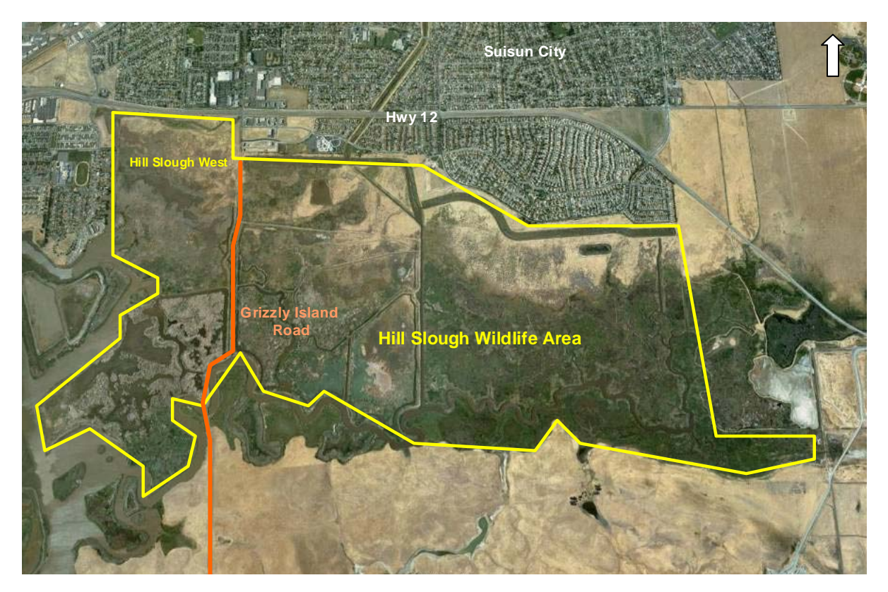
Figure 6. Aerial view of Hill Slough Wildlife Area.