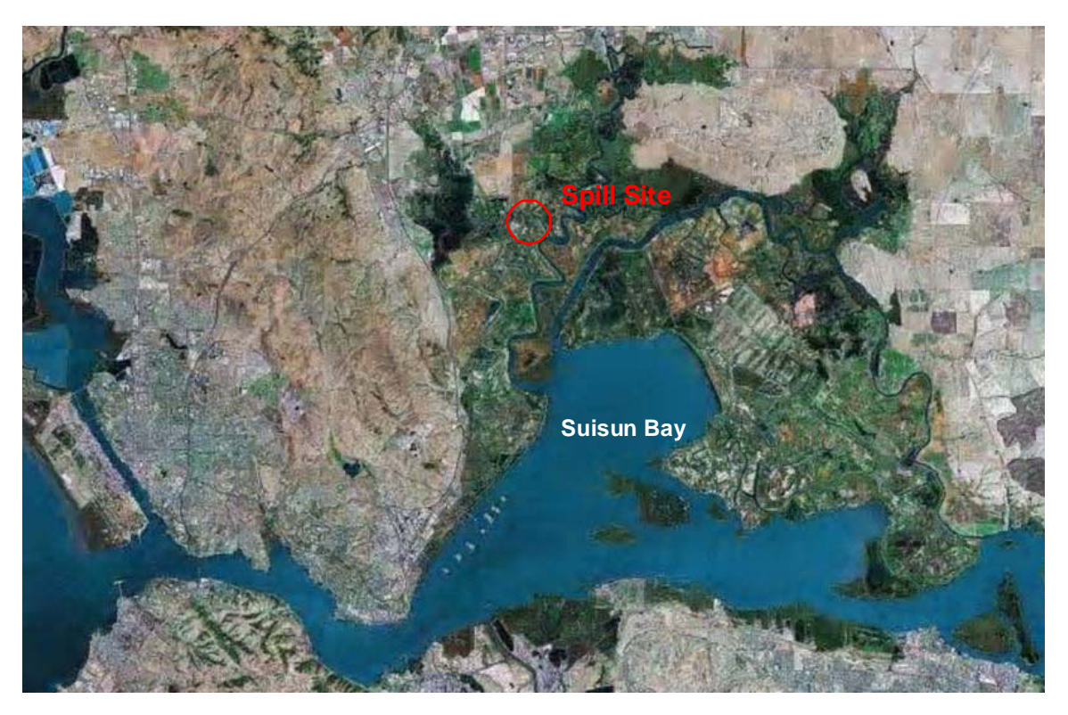
Figure 1. Aerial view of Suisun Bay, with area of spill site identified.

The pipeline involved transports various petroleum products, but had diesel fuel oil in it at the time and place of the discharge. This line through Suisun marsh is no longer used and has been replaced by a newer pipeline outside of the marsh.