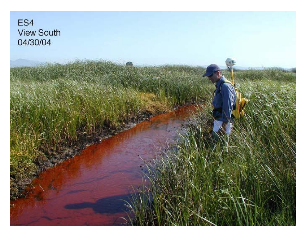
Figure 3. Diesel fuel accumulation in an interior channel.

Figure 2. Aerial view of the spill site within the Drake Sprig Duck Club property.