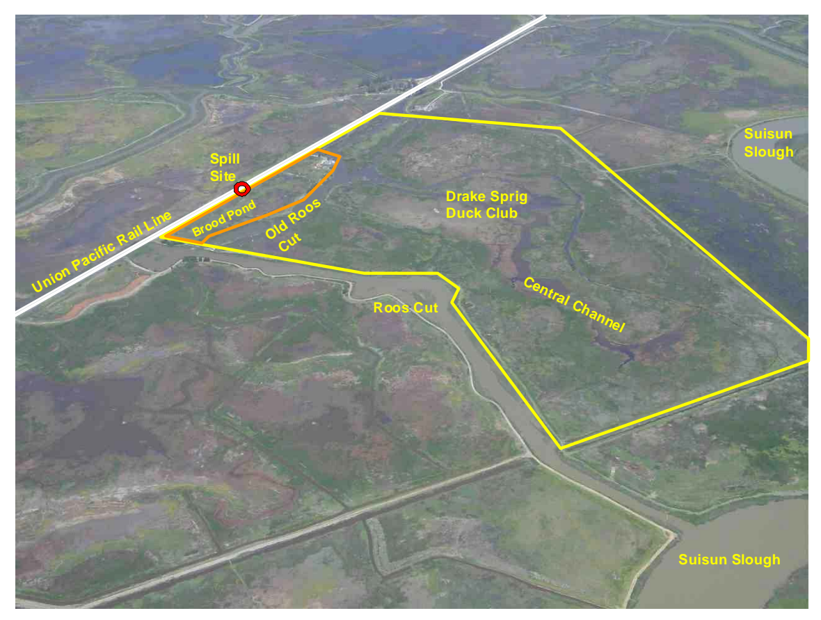
Figure 2. Aerial view of the spill site within the Drake Sprig Duck Club property.