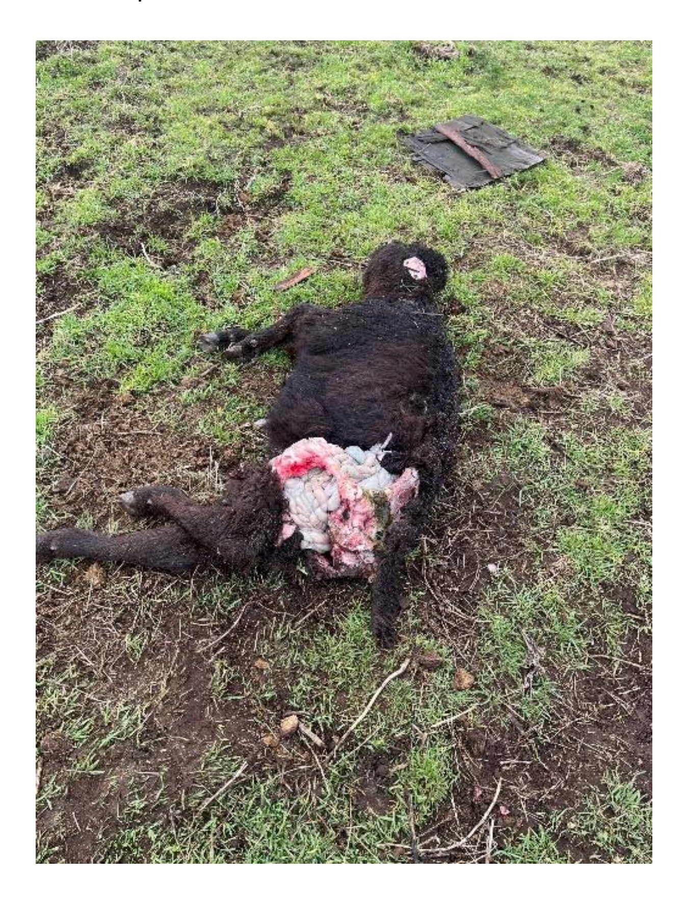
Page 3 of 3