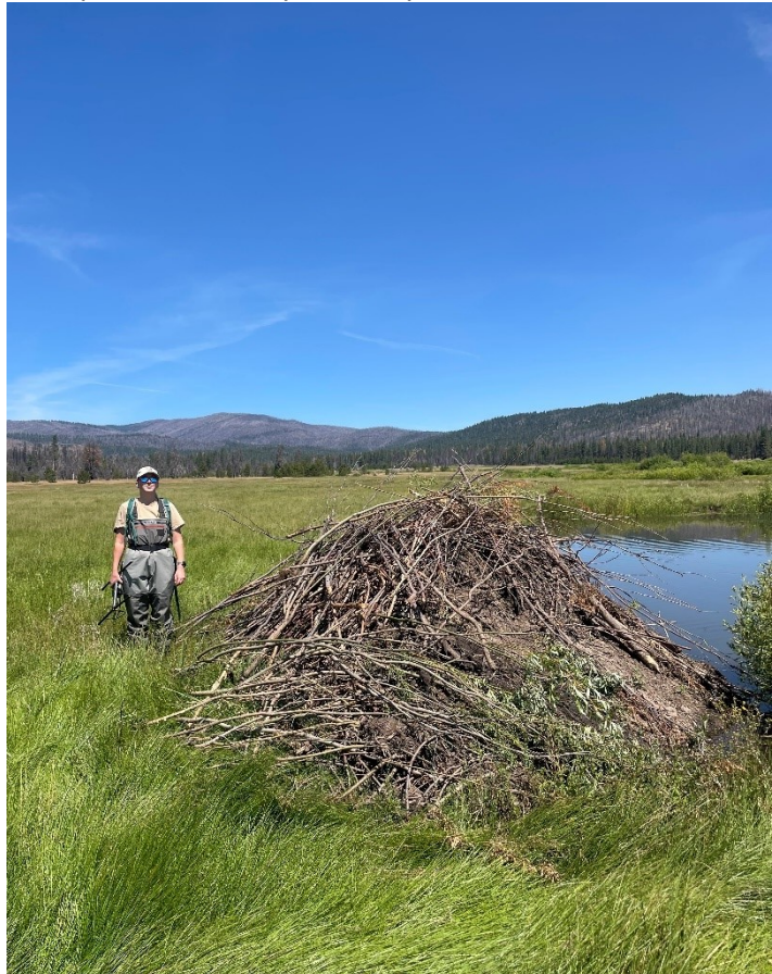
Figure 5. The family group's new bank lodge as of June 2024. Initial construction on the lodge at site MSC-1 was first observed in late November 2023.

In the weeks following the October 2023 release, beavers excavated a bank burrow at the release site. After the beavers moved to the downstream pond, they built a bank lodge that is still in use (Figure 5). To date, the beavers have constructed at least seven dams, the longest of which is nearly 100 meters long and spans the entire downstream perimeter of the pond which they currently inhabit. A 1-meter-tall dam on the mainstem of the stream has diverted streamflow onto the floodplain and into the beaver's pond complex, raising the water levels within. The beaver dams began to spread water laterally (Figure 6), wetting previously dry portions of meadow in areas within 50-100 meters of the mainstem stream channel before the flow reconnects back into the channel. Beavers have begun to dig a network of canals within the pond complex, which is expected to further connect the floodplain hydrologically. The Program has begun analyzing aerial imagery to quantify changes over time in surface water following beaver establishment in the project area (Figure 7). Following the October 2023 release, preliminary estimates indicate a 22.7% increase in surface water area from November 2023 (8,592 m 2 ) to November 2024 (11,110 m 2 ). A time series slider comparing the imagery collected pre- and post- beaver establishment is available here and will be updated as additional imagery is incorporate over time.