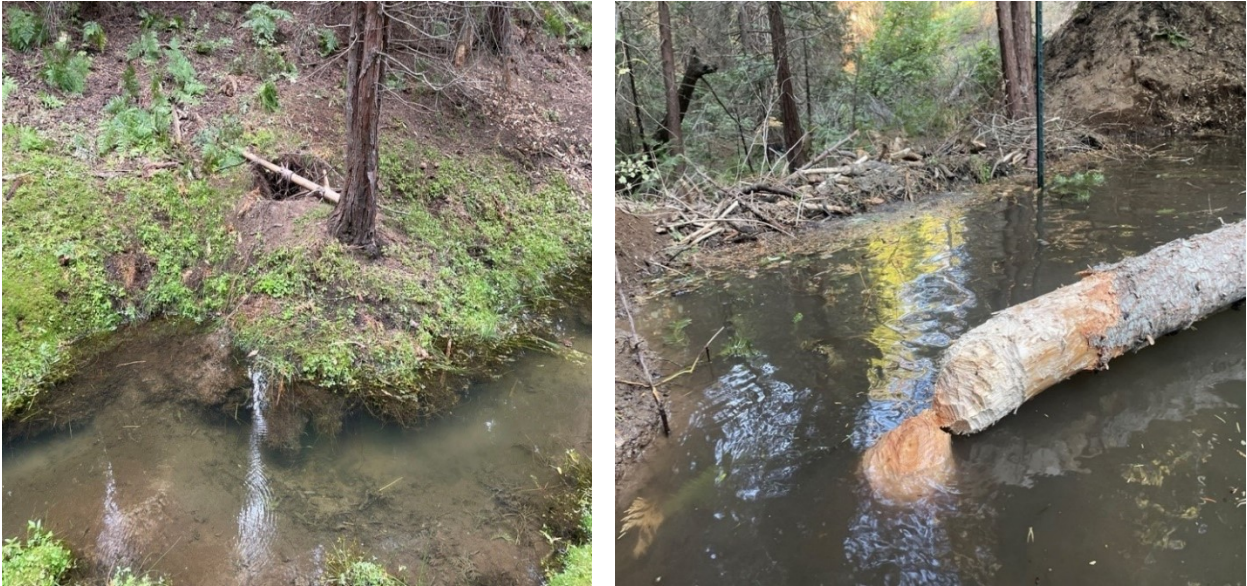
Figure 11. (Left) The translocated beavers assumed the maintenance of the beaver dam analog installed at the site and felled a conifer for additional building material. (Right) A bank burrow excavated at the head of the release pool. The burrow has entrances both under water (under the overhanging bank) and on the surface (excavated hole).

Following release in June 2024, beavers assumed maintenance of the BDA that was constructed to create the release pool at this site, adding material to increase the height of the dam as well as the water level and surface water area (Figure 11). Several trees surrounding the pond have been felled for food and construction materials. Beavers also excavated a bank burrow at the head of the pool. Despite the beavers no longer being present at this site, their burrow can be readily utilized by any beavers that may be released at the site in the future, providing shelter and protection for recently released beavers while they become acclimated with the release site. Additional surveys are necessary to determine the extent of ecosystem benefits provided by beaver activity at this site.