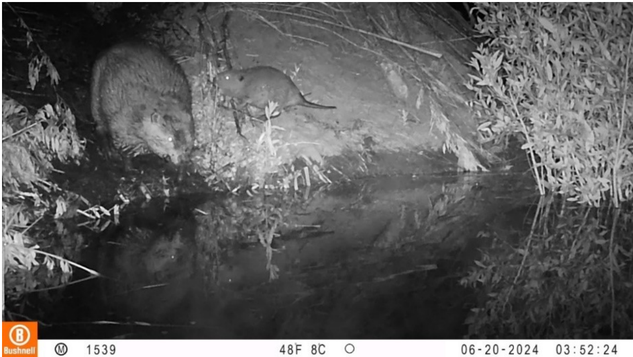
Figure 3. A wild-born kit observed in June 2024 alongside the released adult (23MSC-05), at the family group's lodge at site MSC-1.