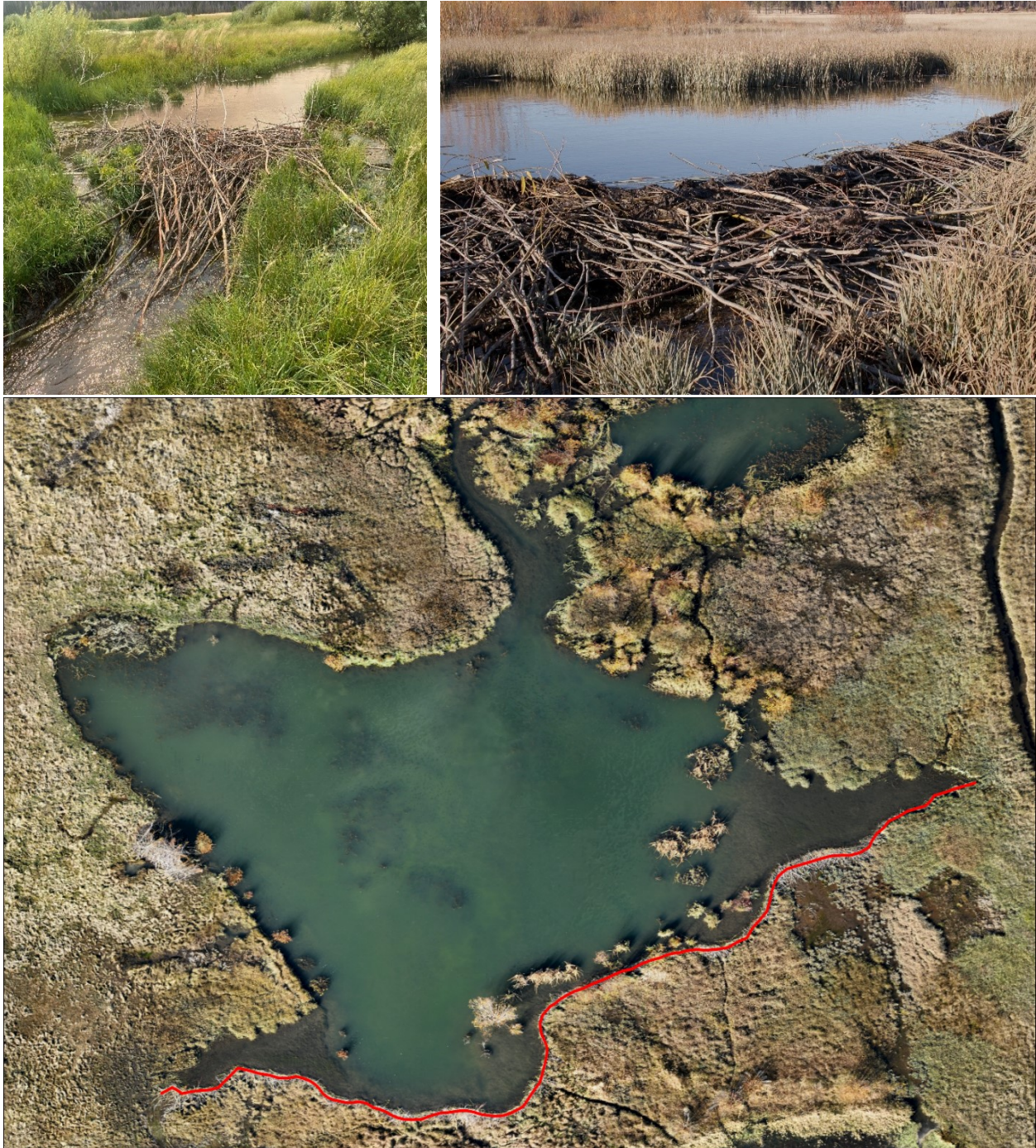
Figure 6. A 1-meter-tall beaver dam constructed on the mainstem of the stream at site MSC-1 (top left). A 100-meter-long beaver dam on the downstream perimeter of a beaver pond at release site MSC-1 (top right). An aerial view of the 100-meter-long beaver dam (delineated in red; bottom).