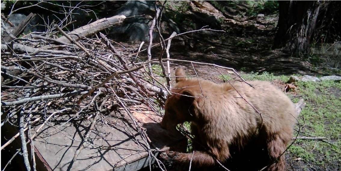
Figure 9. A small black bear investigating and moving the temporary lodge structure at site TRT-1 in July of 2024.