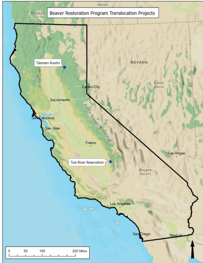
Figure 1. The CDFW Beaver Restoration Program is currently implementing two beaver translocation pilot projects at sites in Plumas County (Tasmam Koyom) and Tulare County (Tule River Reservation).

The California Department of Fish and Wildlife recognizes the effort, partnership, and commitment put forth by the Tule River Tribe and Maidu Summit Consortium in the initiation of and restoration activities carried out by the Beaver Restoration Program. Their willingness to enable the return of the beaver to their lands in California has propelled California's Beaver Restoration Program. CDFW is committed to continuing this partnership with them and other Tribes to bring beavers back for the resilience of our landscapes.