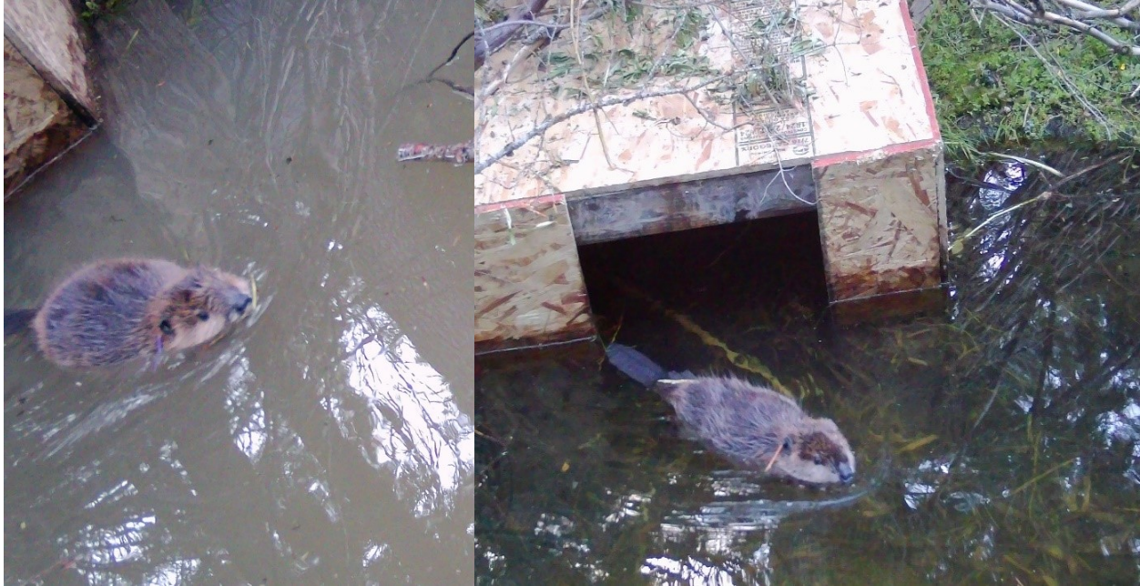
Figure 8. Two kits with uniquely color-coded Floy ear tags captured on game camera near their temporary lodge structure following release.