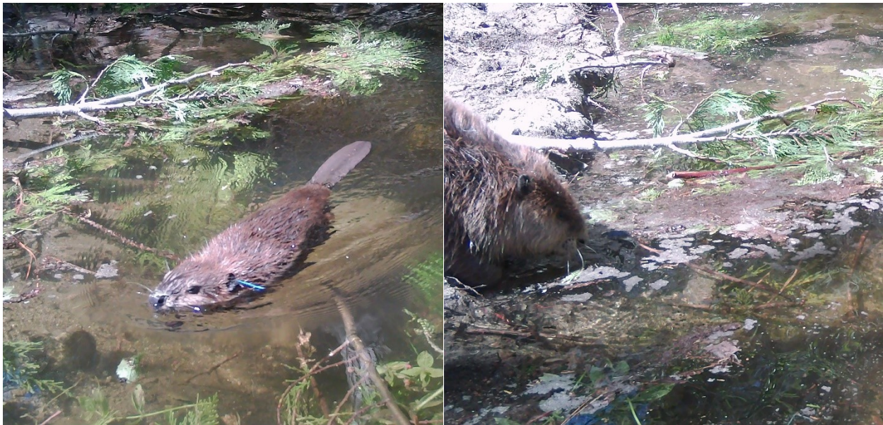
Figure 12. A kit (left) and subadult (24TRT-30; right) seen on camera after translocation to release site TRT-3.