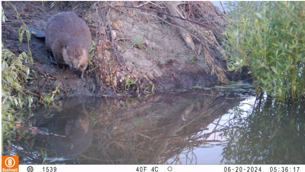
Figure 2. A GPS-tagged adult beaver (23MSC-05) seen on camera at the family group's lodge in June 2024, eight months post-translocation.

At nine days post-release, the subadult male (23MSC-01) dispersed downstream and began occupying the same area as the valley's one known resident beaver. Subsequently, in early December, the subadult and the resident beaver were observed at the same camera station within hours of each other, suggesting the two began to occupy the same territory.