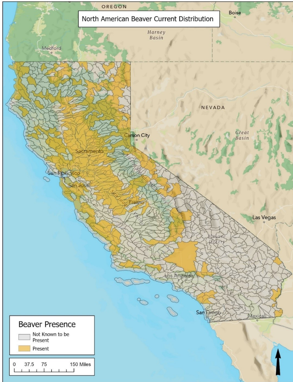
Figure 13. The California Beaver Restoration Program’s North American Beaver ( Castor canadensis ) distribution map. The map depicts documented beaver presence at the HUC (Hydrologic Unit Code) 10 watershed level and, in few instances, the HUC 8 sub-basin level, based on currently available presence data from CDFW’s Wildlife Incident Reporting system and Nutria Eradication Program survey data, iNaturalist research-grade observations, verified observations reported through the California Beaver Observation Survey Tool, iBeaver, and research and practitioner datasets.

Program has compiled a North American beaver distribution map (Figure 13), which is based on currently available beaver presence data. In the absence of any comprehensive beaver population surveys in California, the Program is seeking submission of additional presence data through its Beaver Observation Survey Tool .