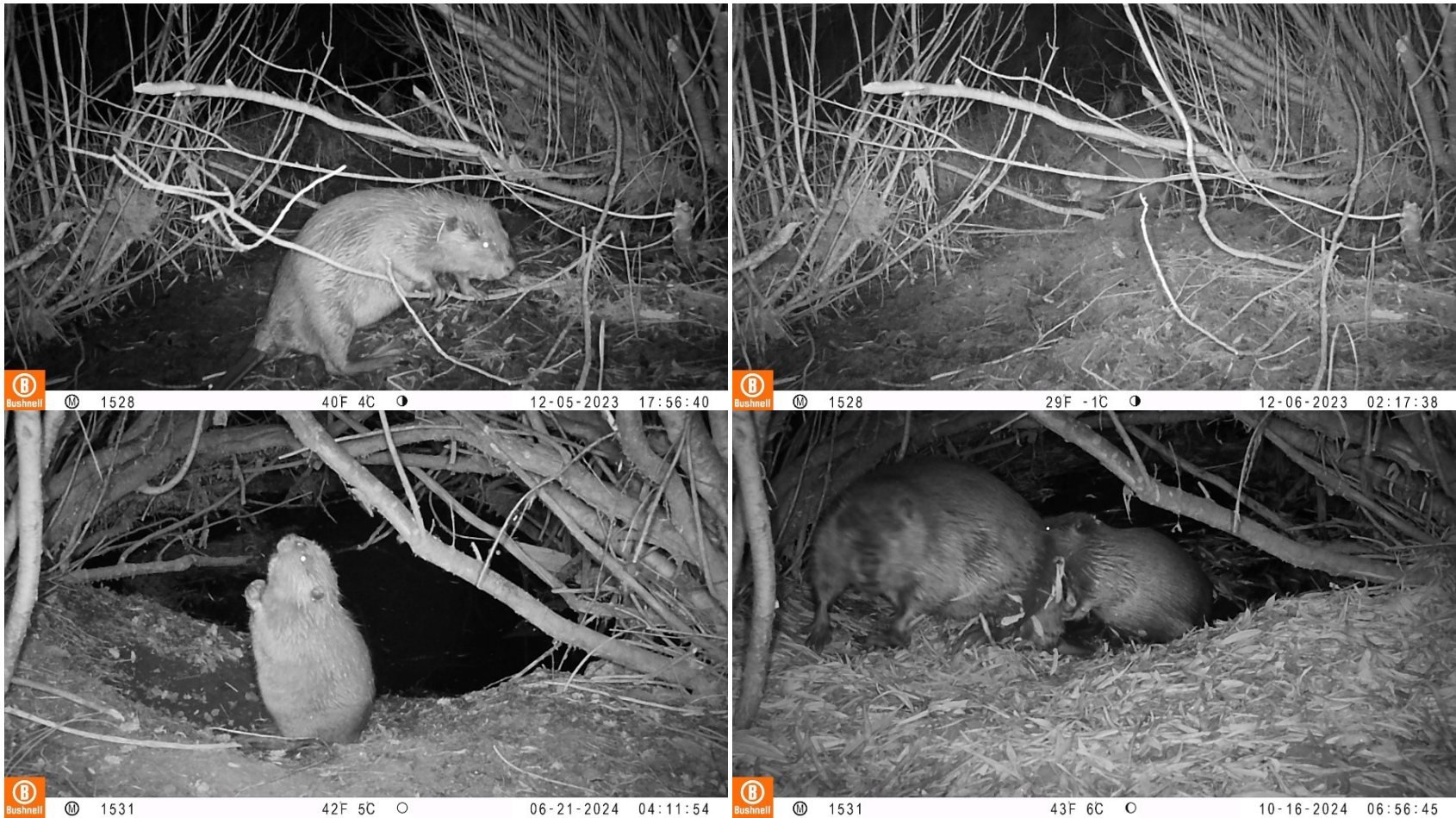
Figure 4. The translocated subadult, 23MSC-01 (top left), observed in December 2023, hours before the untagged resident beaver (top right) was observed harvesting willows from the same location and transporting them in the same direction. The following summer, in June 2024, a kit was observed in the same general area (lower left). In October 2024, an adult and kit were observed together in the same location (lower right).