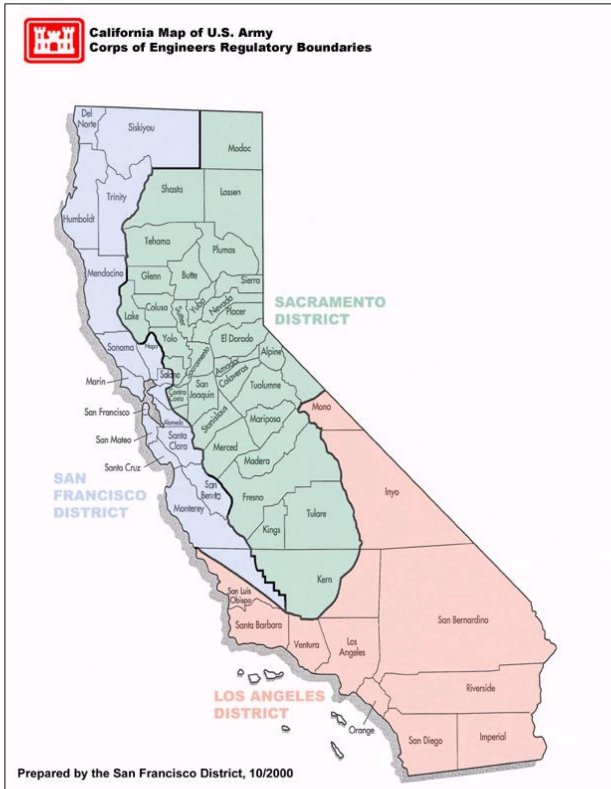
Figure 1. U.S. Army Corps of Engineers Districts.