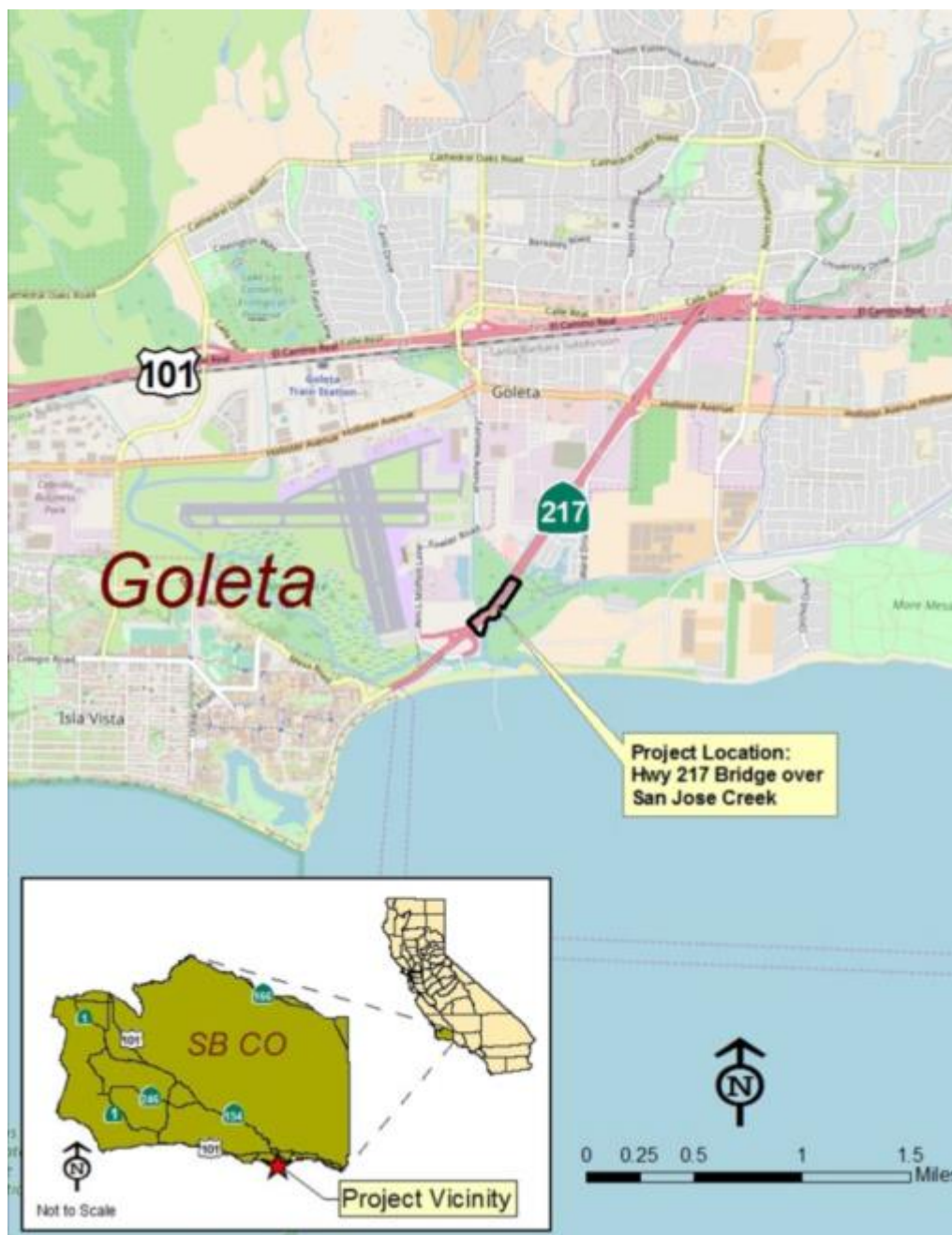
Figure 1. Map of Project Location

The San Jose Creek Bridge Replacement Project (Project) is located on State Route 217 where it crosses San Jose Creek within the City of Goleta, Santa Barbara County (Figure 1). The project is located between postmile 0.9 to 1.4, and the coordinates are Latitude 34.420797, Longitude -119.829759. The project is located just east of the main campus of the University of Santa Barbara.