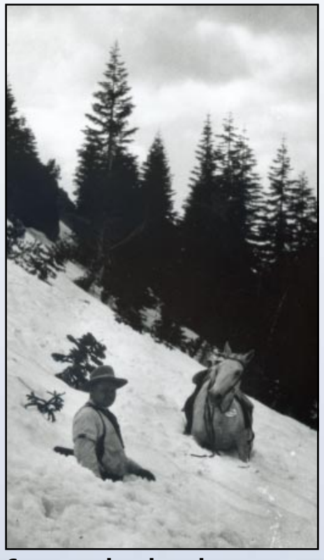
Game wardens have been protecting California's fish and wildlife for more than 100 years.

1870. The Board of Fish Commissioners, forerunner of the Fish and Game Commission, is established "to provide for the restoration and preservation" of fish in California waters. This was the first wildlife conservation agency in the country, even predating the U.S. Commission of Fish and Fisheries. California's three "fish commissioners," appointed by the Governor, received no compensation, but the Legislature appropriated $5,000 to the board for the first two years' operations. This same year the first fish ladder is built on a tributary of the Truckee River, and a