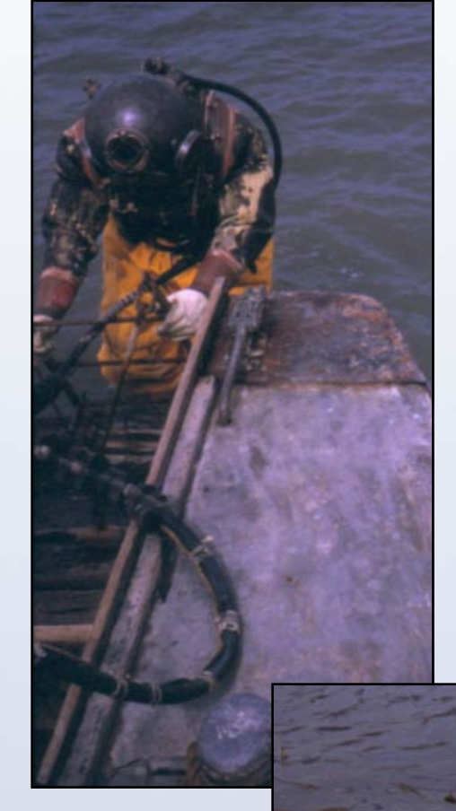
Divers are no longer tethered to boats by an air line thanks to SCUBA gear.

1984. Conservation Education implements Project Wild, the DFG's wildlife education program. Project Wild consists of no cost instructional workshops educators working with students in grades K-12. Hunter Education program is now in its 30th year. The first $1,000 CalTIP reward is authorized. Fish and