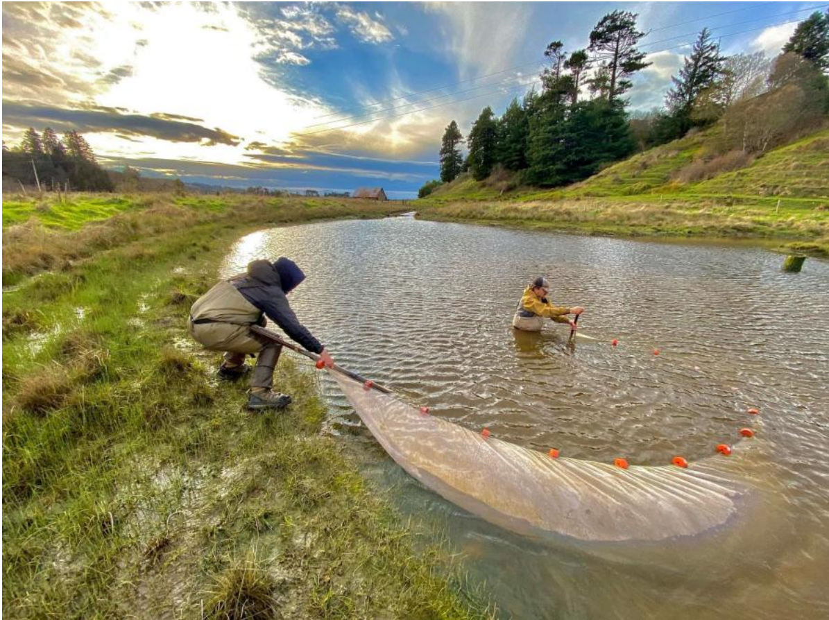
Photo: Project partners seining for juvenile salmonids to monitor fish presence in restored Martin Slough, Humboldt County