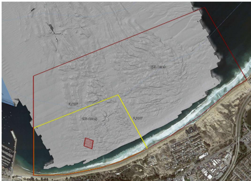
A revised Tanker's Reef SMR of 193 acres from 685 acres, (23%)

Rationale: Add the words "a portion of" to the description. The enforcement area was set very large for enforcement purposes but is larger than needed for kelp restoration purposes. The area to the east of the reserve serves as the control area where restoration efforts are not undertaken. See map below for proposed area.