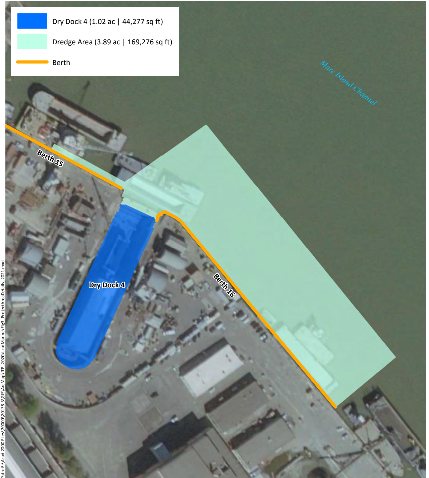
Figure 2. Project Area Details