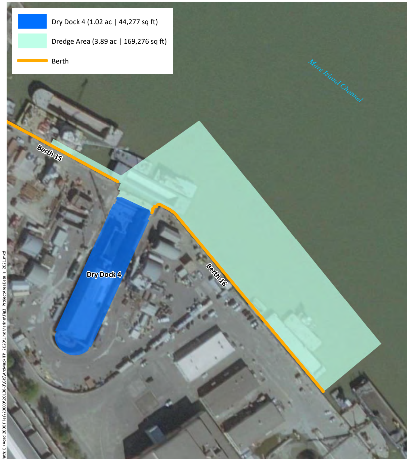
Figure 2. Project Area Details