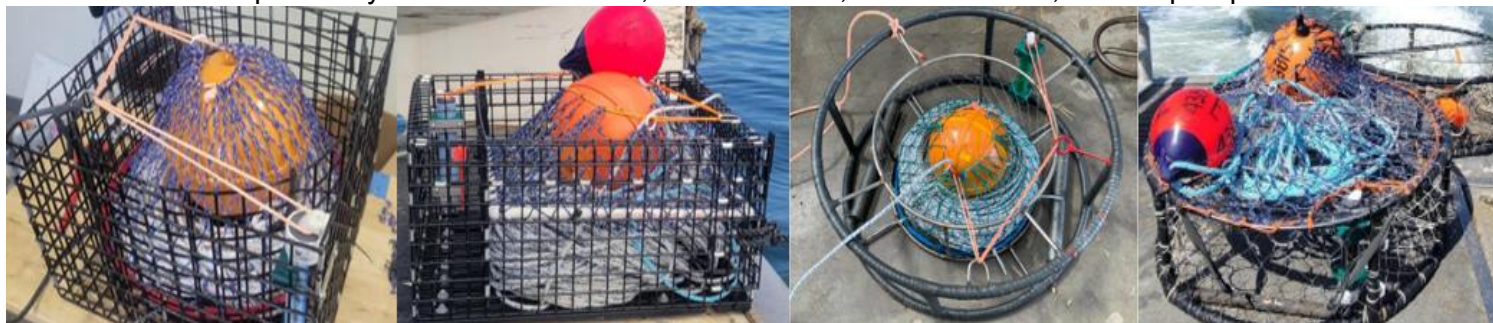
Figure 2. Guardian Inshore Sled (left), Mid-water Sled (middle left), Crab Pot Sled (middle right) and Trap-Top Retrofit (right).