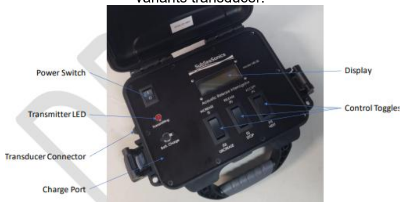
Figure 2. ARI-U deck box and TD-60