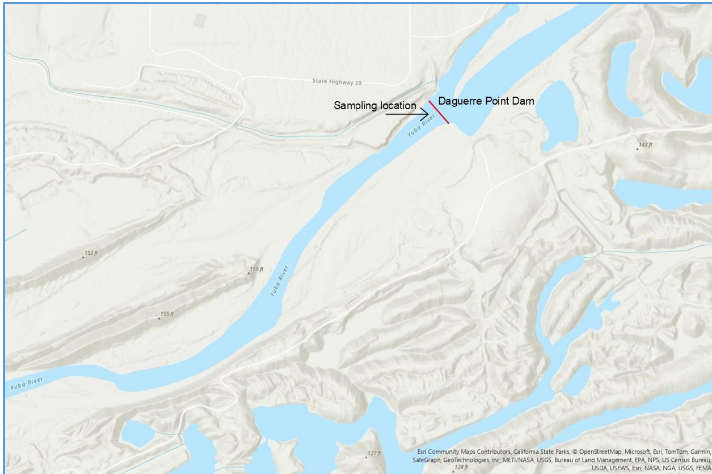
Figure 1. 2024 Yuba River sturgeon spawning survey – Daguerre Point Dam sampling location.