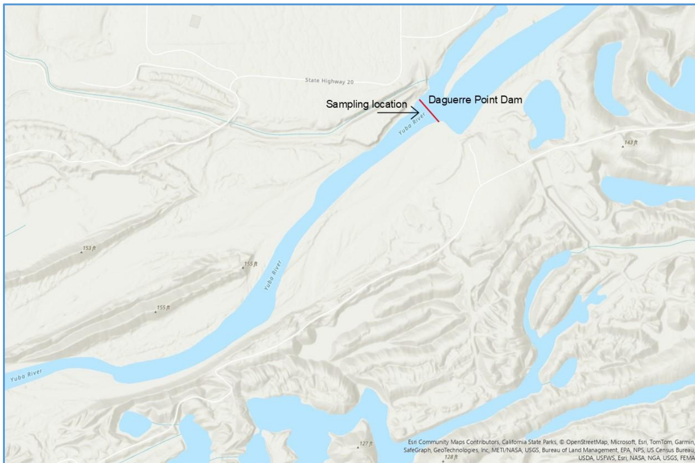
Figure 1. 2025 Yuba River sturgeon spawning survey – Daguerre Point Dam sampling location.