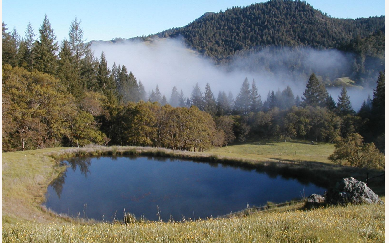
A pond with livestock exclusion fencing at Stewart Ranch.