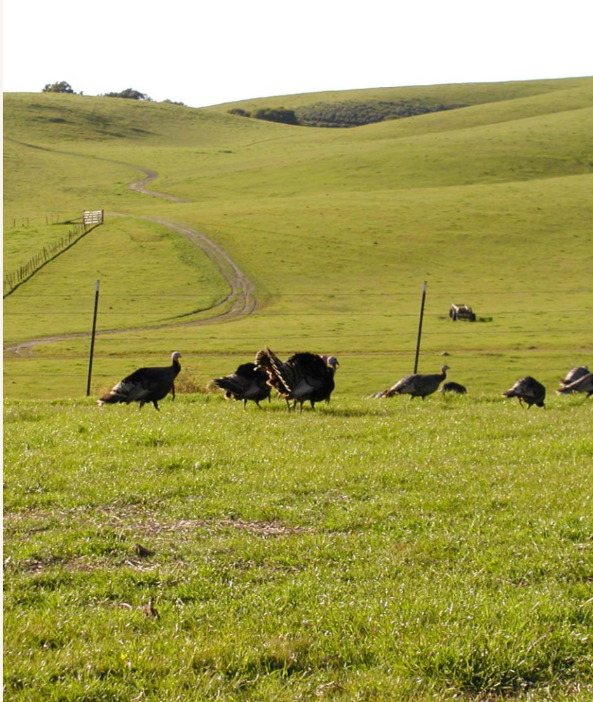
Turkeys at Bardin Ranch.