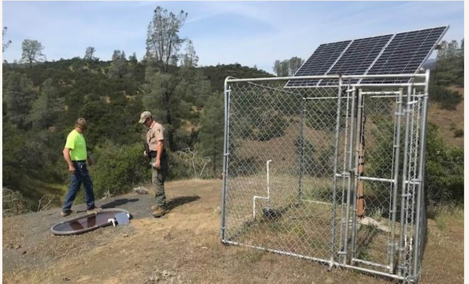
A solar powered guzzler at R Wild Horse Ranch.