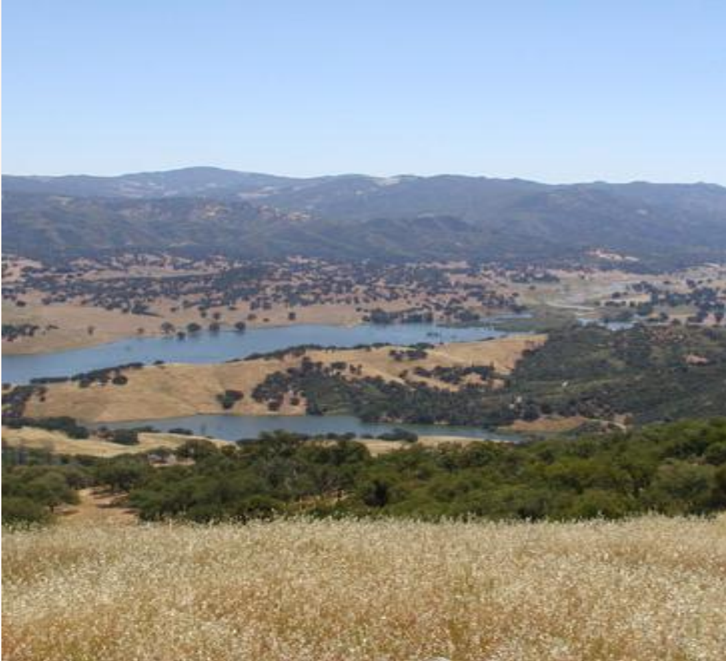
Hernandez Reservoir - Lewis Ranch