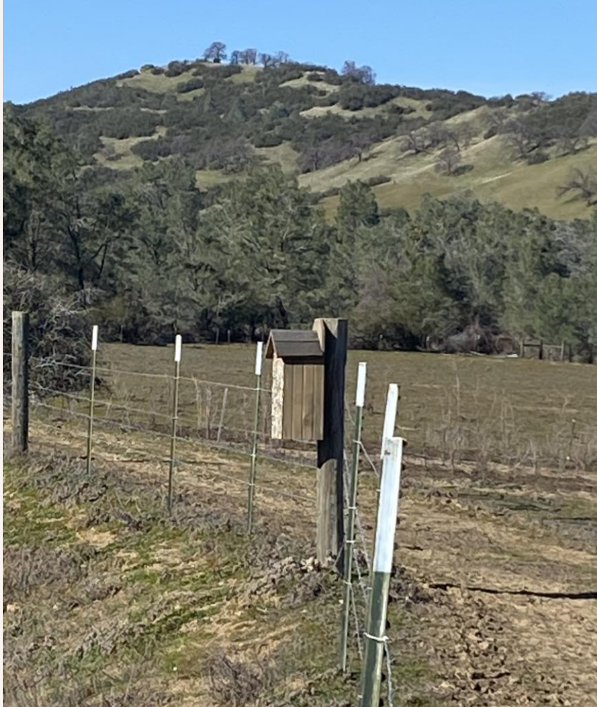
A wood duck box at 360 Ranch.