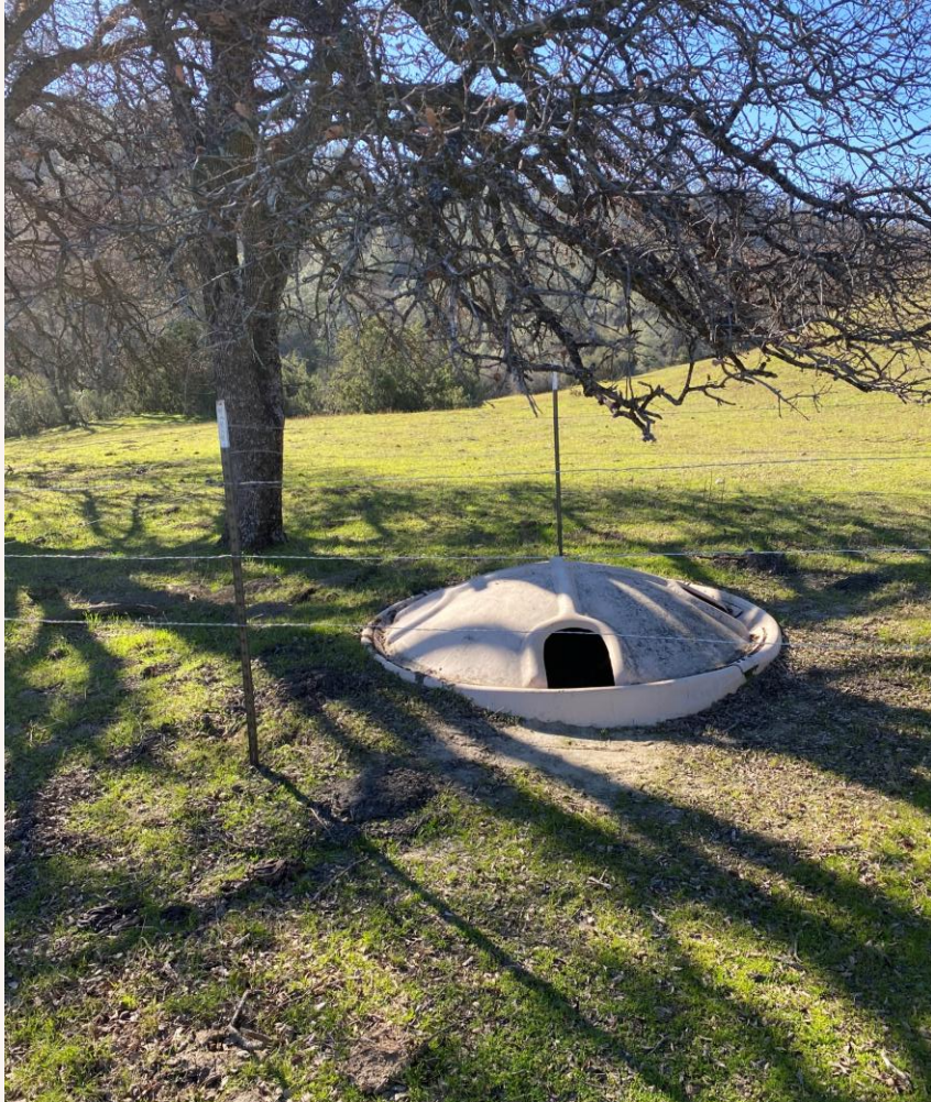
Guzzler at 360 Ranch.