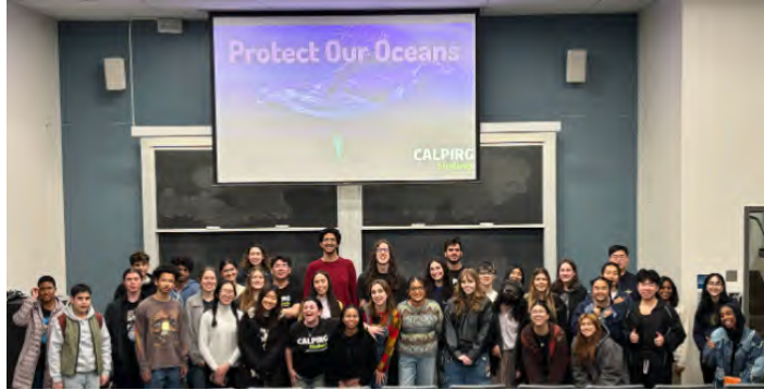
UC Davis chapter hosts educational events to call for stronger ocean protections. Spring 2025