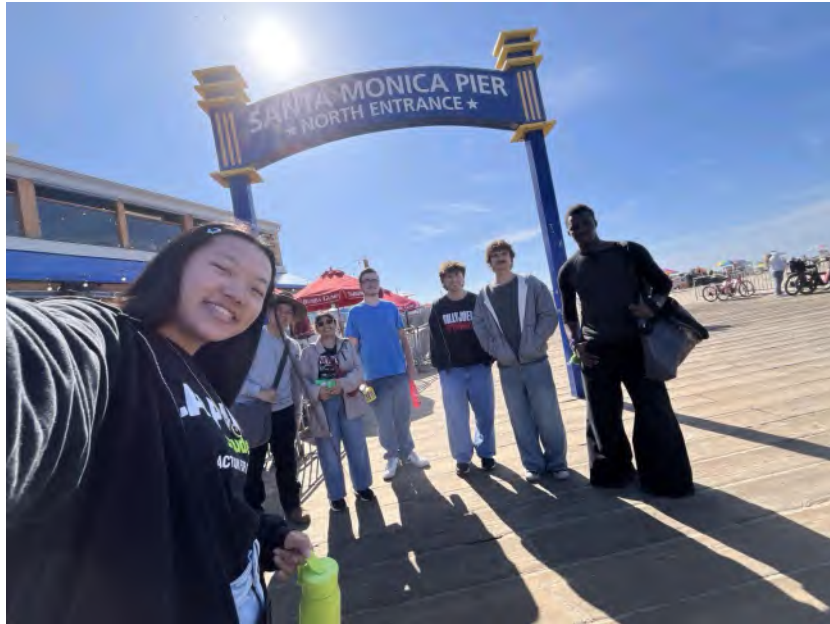
UC Riverside and UCLA meet up at Santa Monica for a beach cleanup event with volunteers.