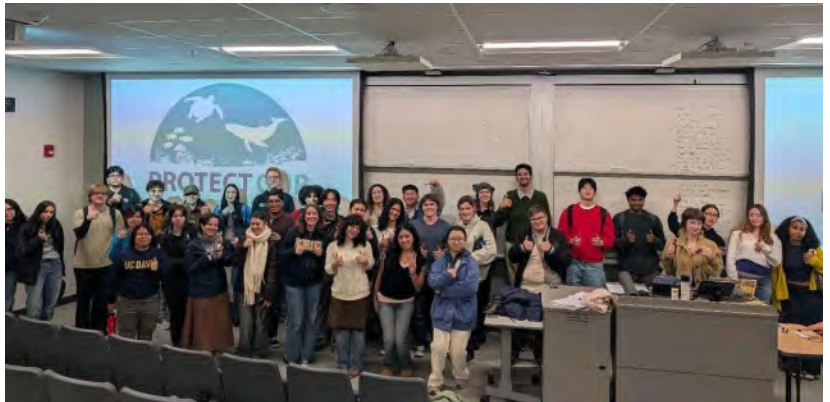
"Water your fave things about the ocean" campaign event at UCSB. Campaign Rally for the oceans at UC Davis. Spring 2026