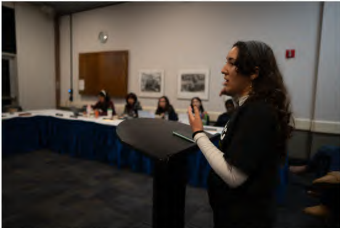
The Senate unanimously adopted a resolution expanding marine protected areas and fully protecting 30% of California's coastal waters by 2030.

The 76th Associated Students Senate formally signed on to support expanded California marine protections at its last meeting of winter quarter on March 4. Later in the meeting, the Mobility Transportation Program announced it received enough petition signatures to get its fee initiative on the spring election ballot.