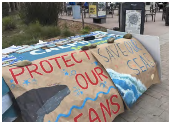
UC Santa Barbara students pass a resolution in support of expanded and strengthened marine protected areas, after engaging thousands of students on their campus around the issue. February 2026