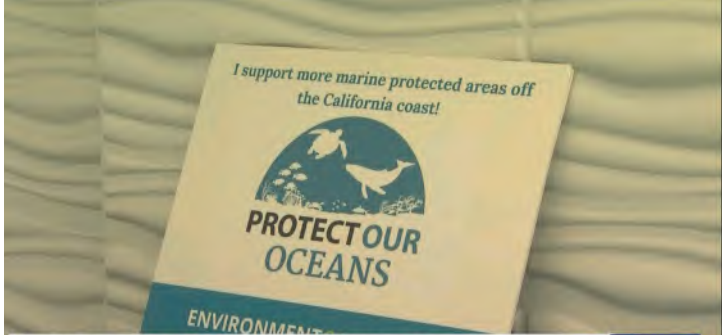
MARKING NATIONAL YOUTH EARTH WEEK SAN FRANCISCO