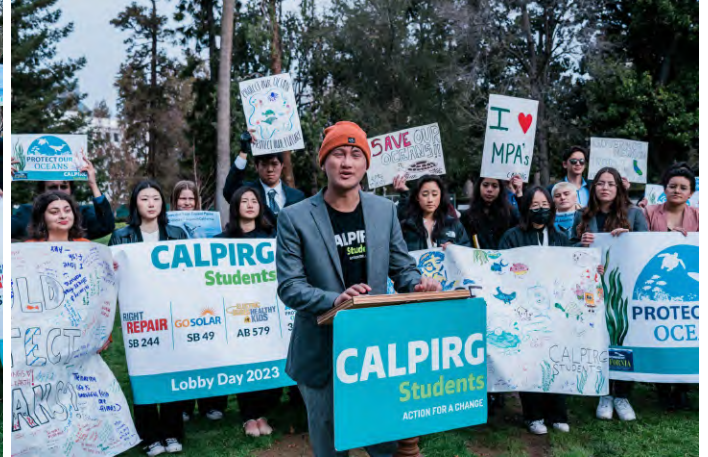
Students host a press conference in Sacramento, February 2023, to deliver support for stronger and expanded marine protected areas in California.