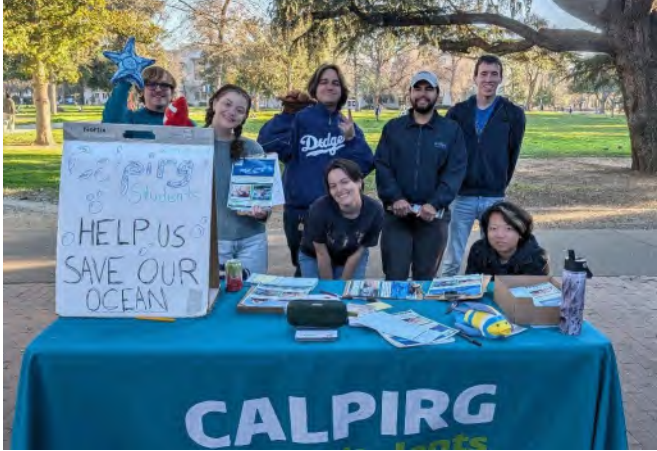
Students at UC San Diego (left) and UC Davis (right) launch their education drives to protect our oceans in February, 2026.