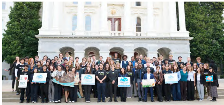
Lobby Day in Sacramento around strengthening ocean protections in Spring of 2025.