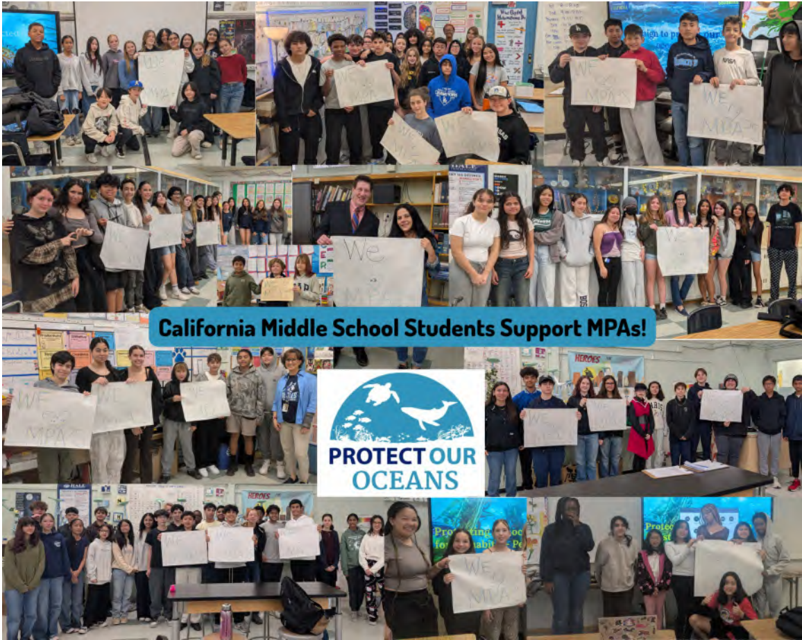
California Middle School Students Support MPAs!

CALPIRG activists also educated middle school students in the Los Angeles area about the benefits of MPAs for endangered species. Over 200 students and their teachers participated in a lesson about the endangered Southern Sea Otter and the importance of habitat protection through Marine Protected Areas! April, 2025