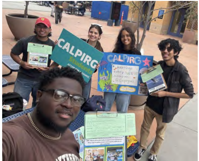
Students at UC Riverside (left) and UC Irvine (right) do education on campus. Spring 2025