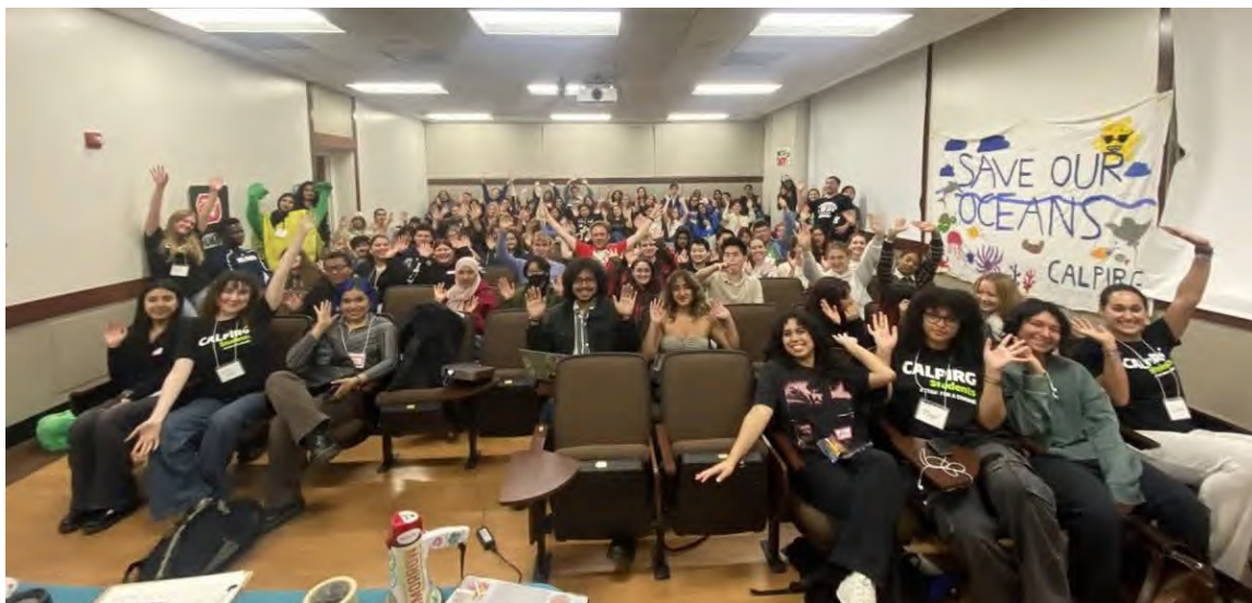
CALPIRG's Ocean Rally at UCLA in February (bottom) and April (top) 2026.