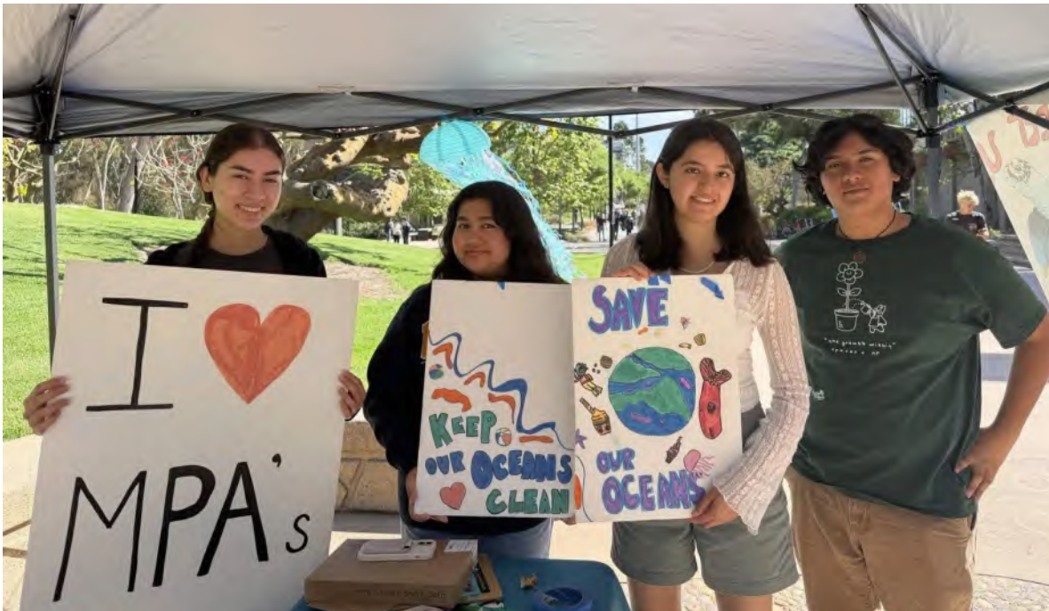
UC San Diego chapter hosts an educational outreach event about our state's marine protected areas.