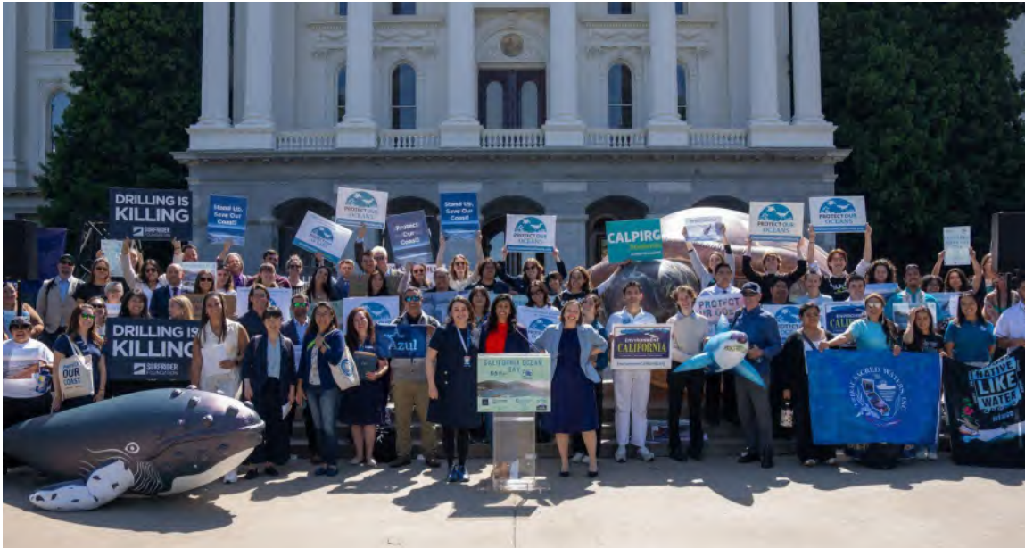
Community members, students from UCSB, UCLA, UCR, and UCSD at California Ocean Day, April, 2026, in Sacramento.