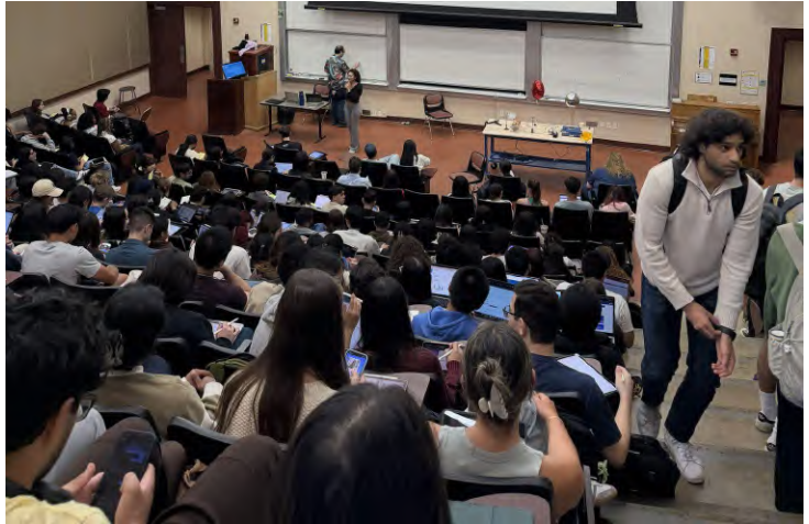
Left: UCLA chapters tabling to sign up new members behind the campaign to expand marine protections in California. February, 2023 - Right: CALPIRG volunteers make recruitment announcements in lecture halls at UCLA, March 2026