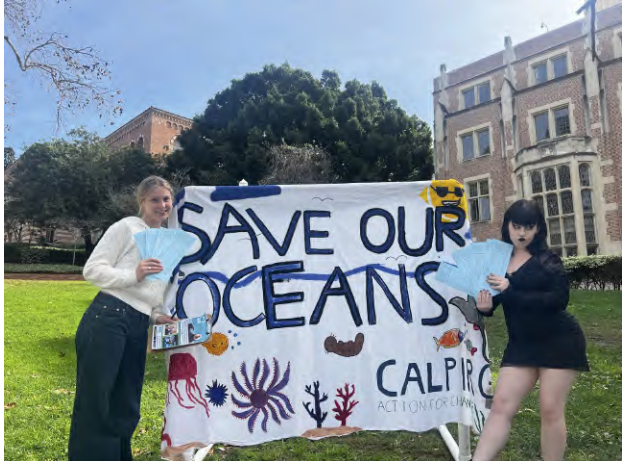
UC Santa Barbara (left) and UCLA (right) students collect support for their Protect Our Oceans campaign. Spring 2026