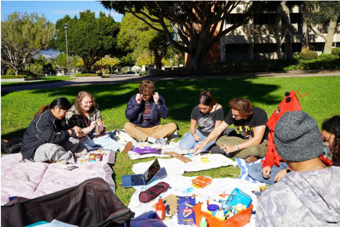
UC Santa Barbara's "Carbs, Clay, and Coral" event at UC Santa Barbara. CALPIRG at UC Santa Barbara hosted a "Carbs Clay and Coral" event where volunteers built tiny coral reefs out of pasta, educated people about the campaign to expand Marine Protected Areas in California, and signed petitions. January 2026