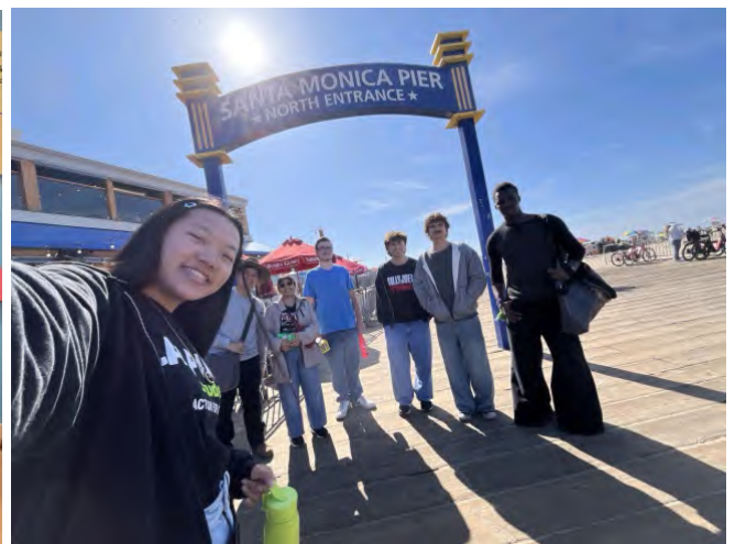
Left: Students from UC Santa Cruz met with docents at Natural Bridges to talk about the Protect Our Oceans campaign. - Right: Students from CALPIRG's Protect Our Oceans campaign at UCLA and UC Riverside held a beach cleanup at the Santa Monica pier. They filled up a whole large trash can, and got beach goers to sign their petition!