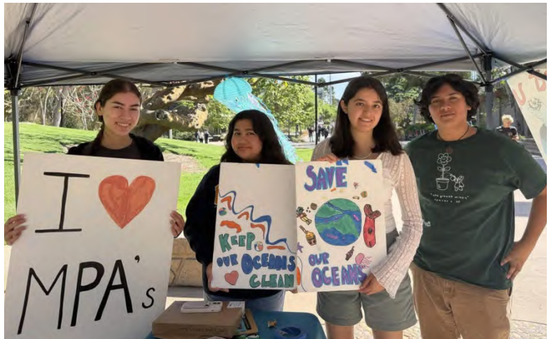
UC Santa Cruz (left) and UC San Diego volunteers (right) table to recruit new volunteers and build support for the Protect Our Oceans campaign, March 2026