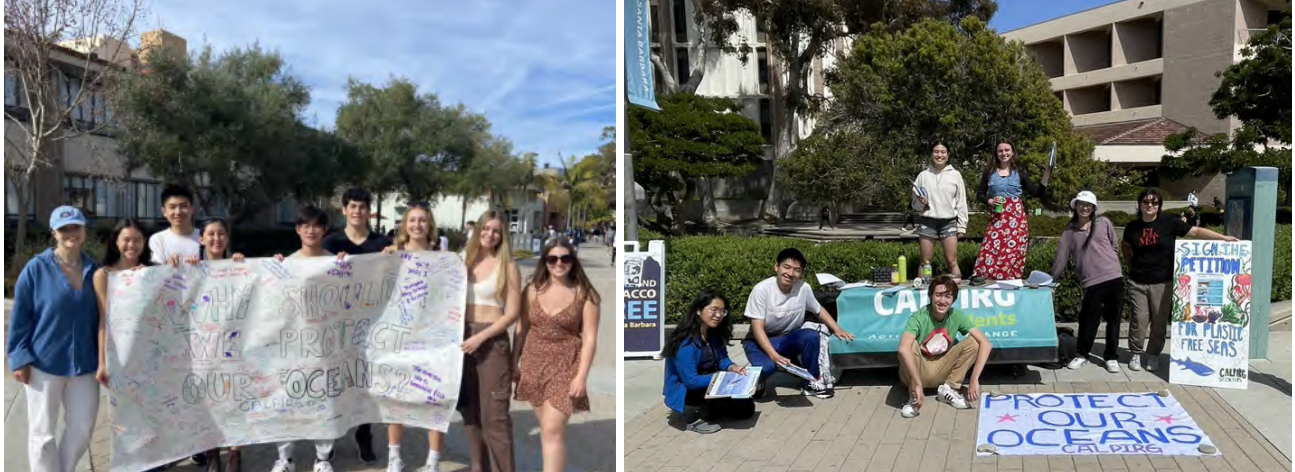
UCSB Students educating students at their petition table, and "Why we should protect our oceans" banner-signing event (Spring, 2024)

UC Santa Barbara students at their Love your MPA Valentine's Event.