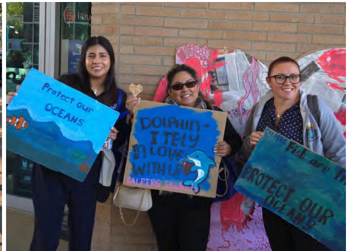
CALPIRG at UC Davis hold an ocean species matching game and petitioning table for the Protect Our Oceans campaign (left). UC Riverside students (right) collect photo petitions for their campaigns. January, 2026