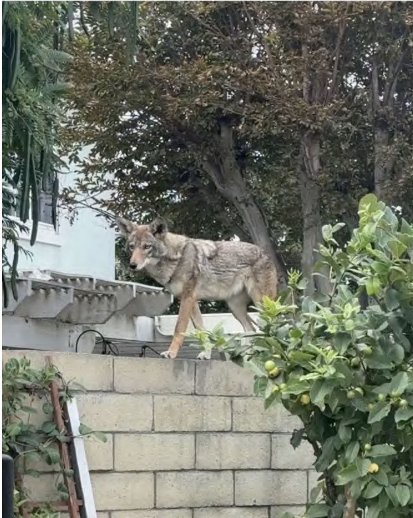
Broad-daylight fence patrol.

This big guy was hanging out in my backyard around 8:42 this morning. Please be careful and keep your pets inside. I'm on Carnegie and Newland.