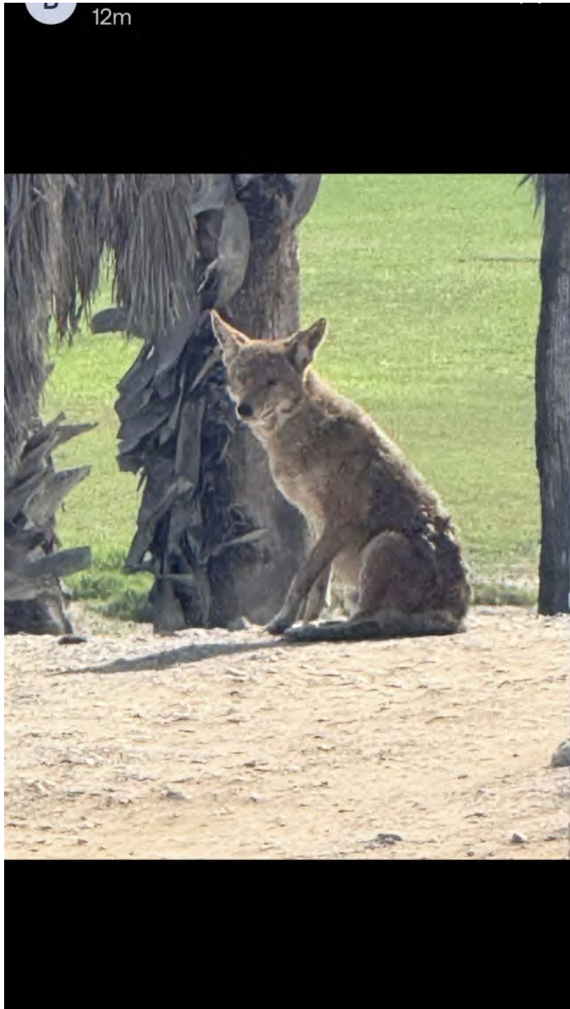
Coyotes relaxing in broad daylight at Floral Park are a classic example of habituation.