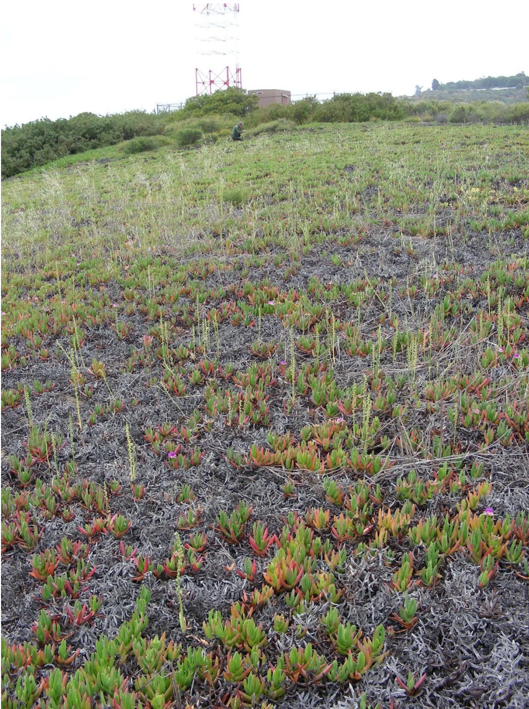
Figure 19. Carpobrotus edulis mat. An unusual stand of ice plant with the rare Piperia cooperi emergent, Pt. Loma Naval Station, May 2008 (T. Keeler-Wolf).