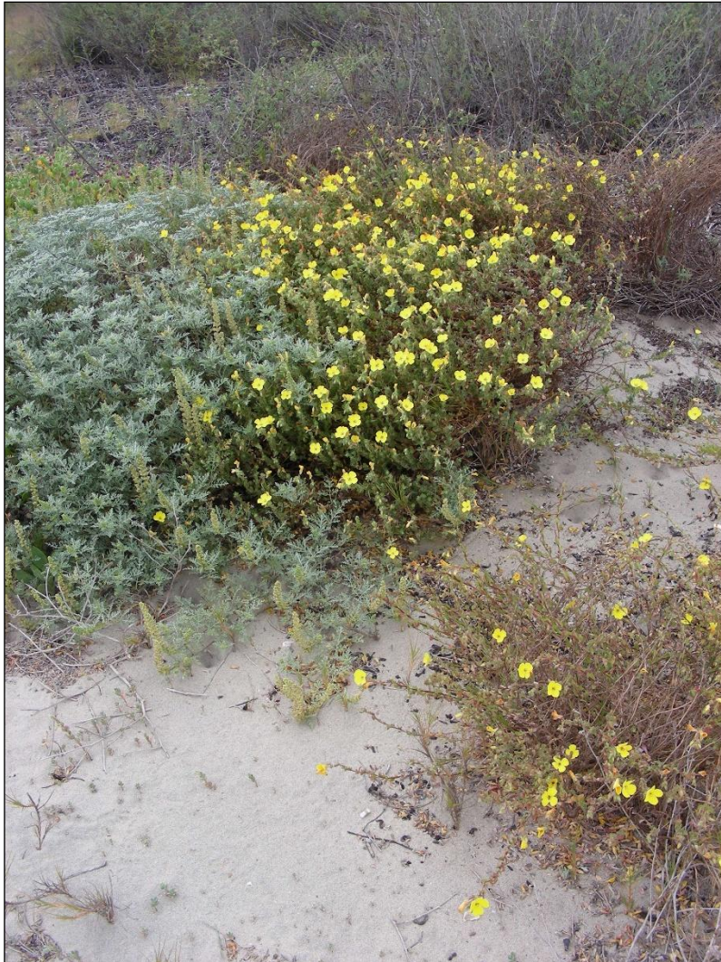
Figure 18. Beach Bursage - Sand Verbena - Sea Rocket Herbaceous Association. Beach at Naval Base Pt. Loma, May 2008 (T. Keeler-Wolf).