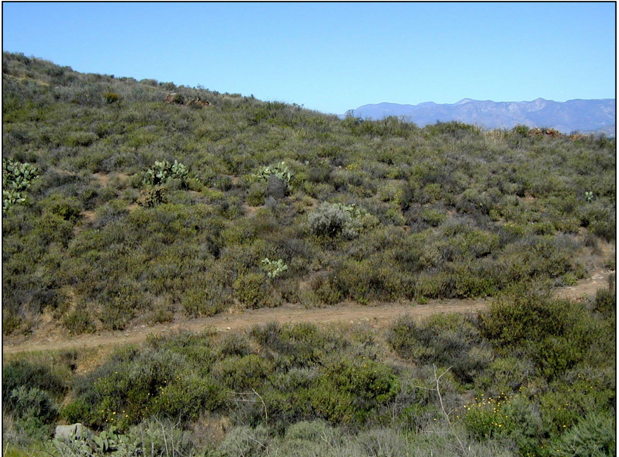
Figure 12. California Brittle Bush-California Sagebrush Scrub Association (Todd Keeler-Wolf).

Evens and San 2005, Keeler-Wolf and Evens 2006, Klein and Evens 2006, Malanson 1984, Sawyer et al. 2009, AECOM and VegCAMP 2010 (unpublished report).