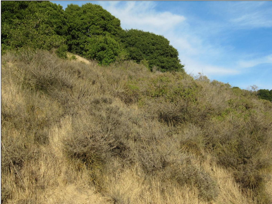
Figure 10. Coyote Brush - California Sagebrush Association (Todd Keeler-Wolf).

Keeler-Wolf and Evens 2006, Sawyer et al. 2009