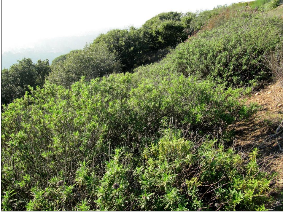
Figure 8. California Sagebrush - Black Sage Scrub Association (Todd Keeler-Wolf).