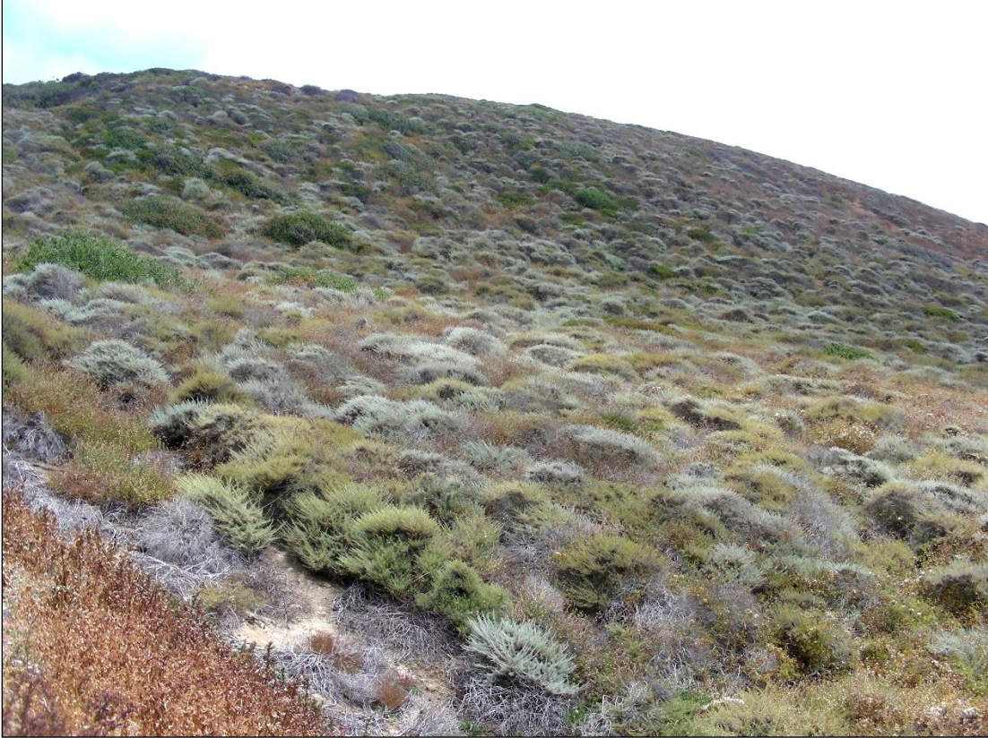
Figure 6. California Sagebrush-California Brittle Bush-Lemonade Berry Coastal Scrub on a south-western exposure near the tip of Poin Loma (T Keeler-Wolf).