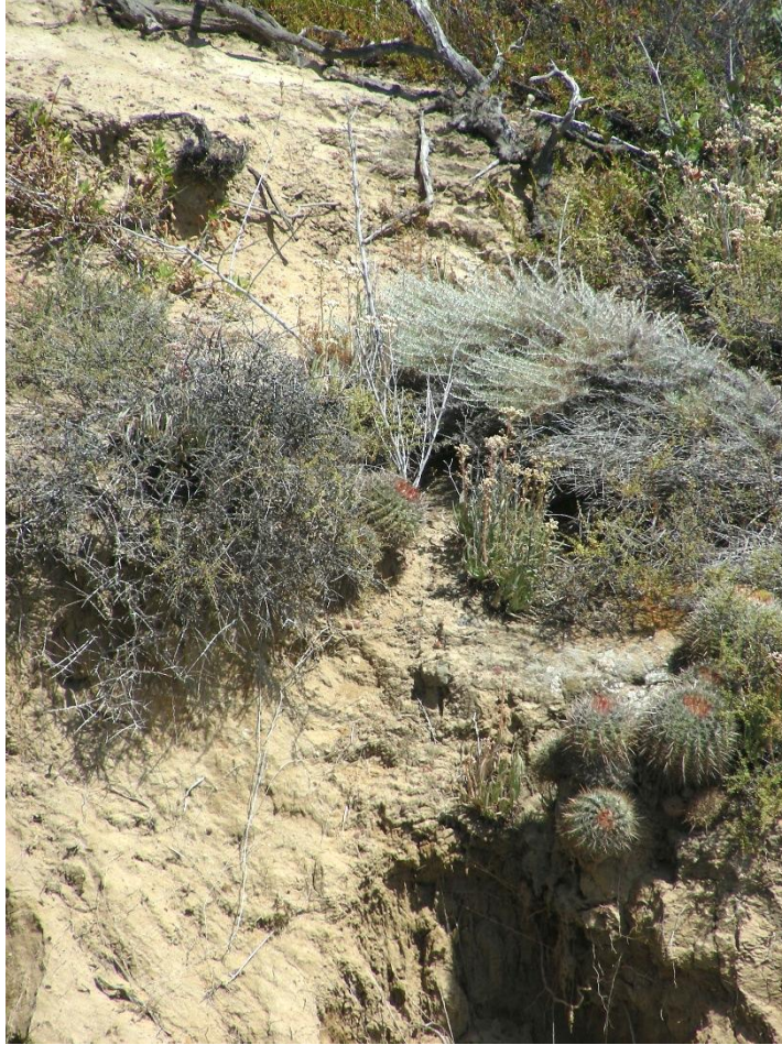
Figure 7. California Sagebrush-California Buckwheat-Coast Prickly Pear/Dudleya spp. Association on a bluff above the Pacific Ocean, Pt. Loma NM, May 2008 (T. Keeler-Wolf).