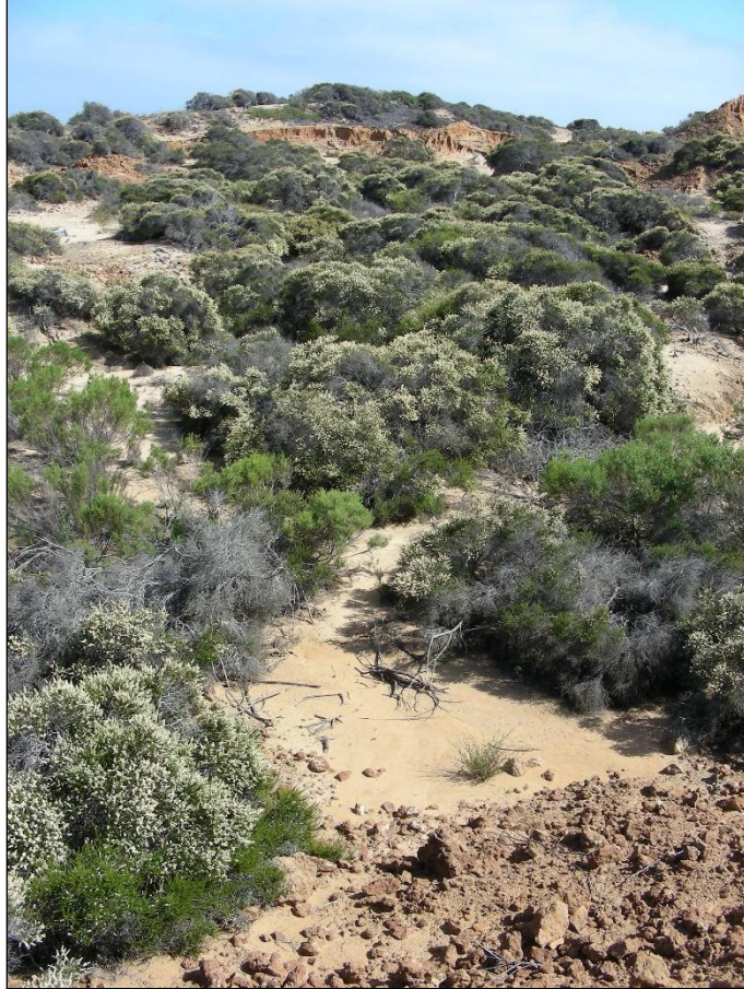
Figure 4. Chamise Southern Maritime Chaparral on top of a bluff at Point Loma Navy Base, May 2008 (Todd Keeler-Wolf).