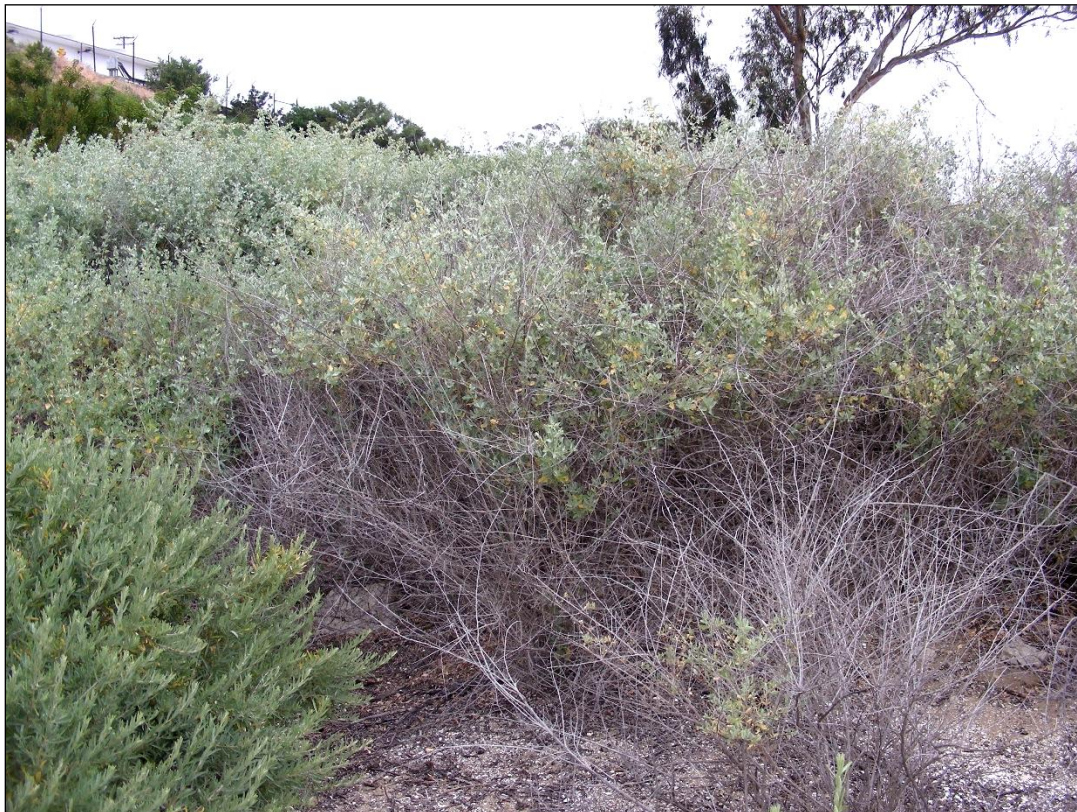
Figure 9. Quailbush Scrub Association nears the sheltered beach at Pt Loma Navy Base (T. Keeler-Wolf).

Keeler-Wolf and Evens 2006, Sawyer et al. 2009.