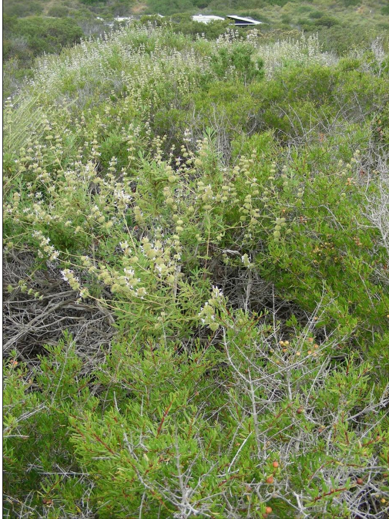
Figure 17. Black sage-California Buckwheat scrub. A dense stand at Point Loma NM. Cneoridium dumosum is a common associate. May 2008 (T. Keeler-Wolf).