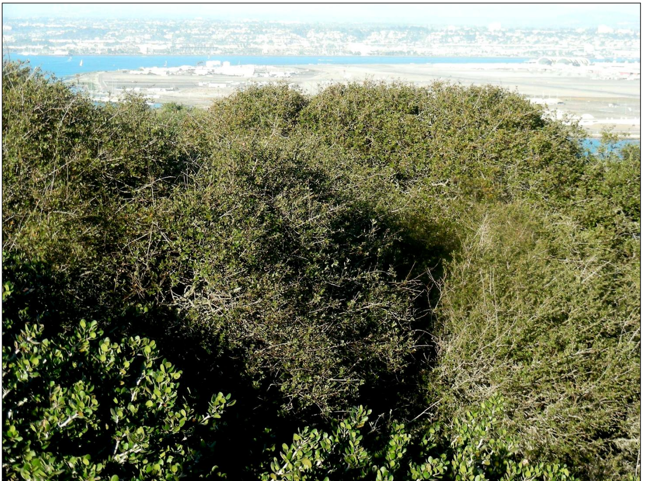
Figure 15. Nuttall Scrub Oak Association. View overlooking San Diego Harbor, Point Loma May 2008.

Hogan et al. 1996, Holland 1986, Sawyer et al. 2009, SDNHM Plant Atlas Project ( http://www.sdnhm.org/plantatlas ), AECOM and VegCAMP 2010 (unpublished report).