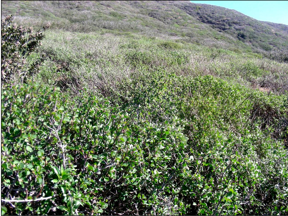
Figure 16. Lemonade-berry Association. Pt. Loma NM, May 2008.