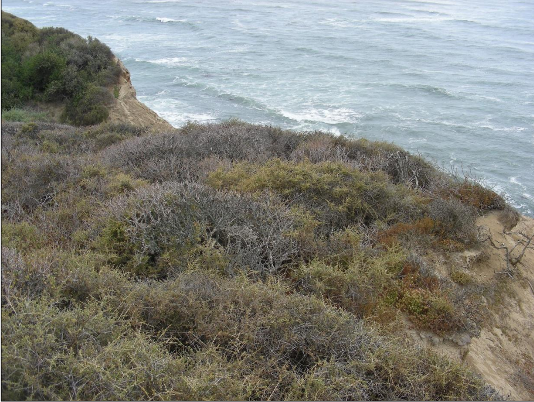
Figure 13. California Desert-thorn Scrub Association. Point Loma NM along a coastal bluff adjacent to the Pacific Ocean(Todd Keeler-Wolf).