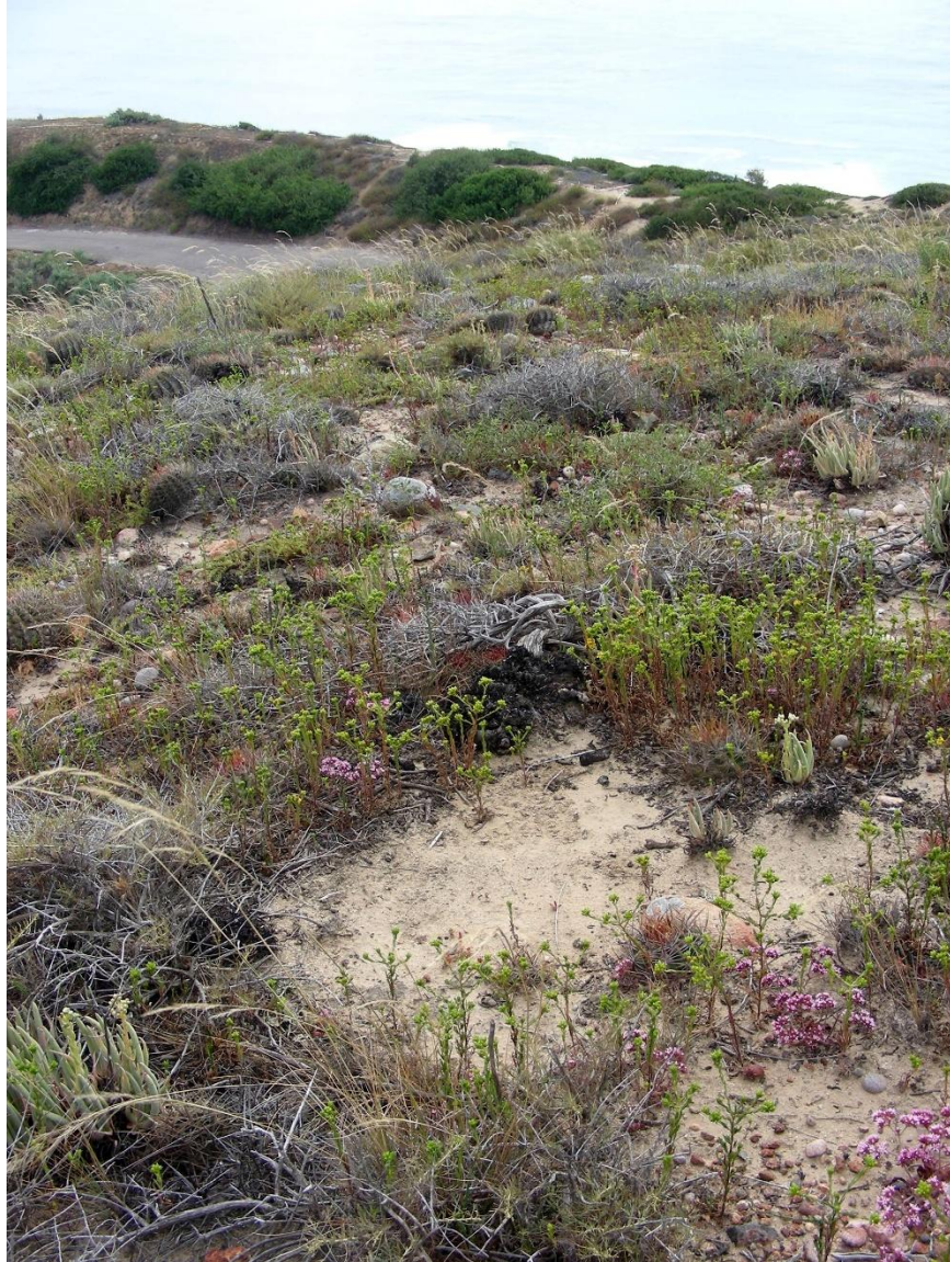
Figure 20. A diverse Deinandra fasciculata stand with Chorizanthe fimbriata , Dudleya edulis and Ferocactus viridescens . Point Loma May 2008 (Todd Keeler-Wolf).