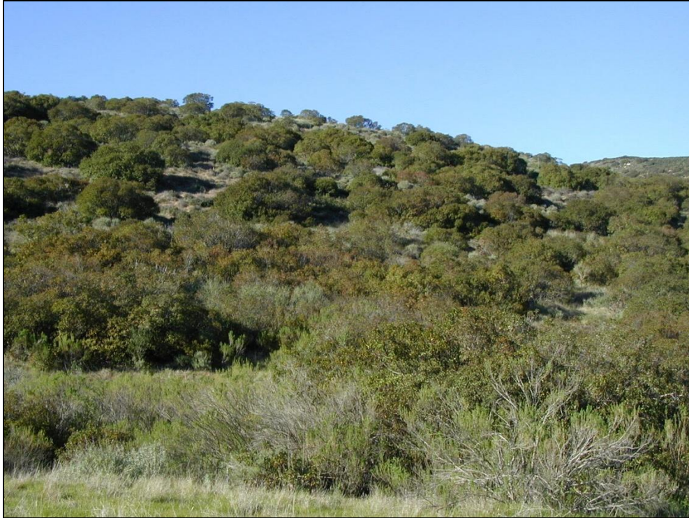
Figure 14. Laurel Sumac Scrub - California Buckwheat - Black Sage Scrub (Todd Keeler-Wolf).