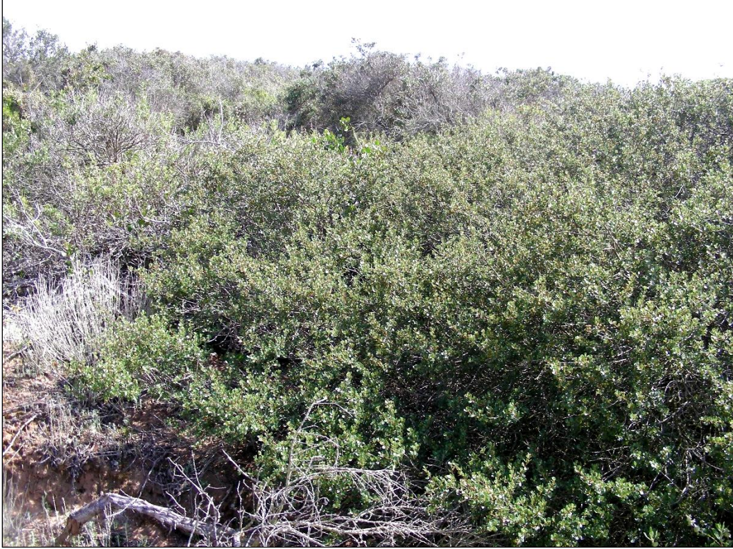
Figure 11. Wart-stemmed Ceanothus Chaparral Association. Point Loma Navy Base, May 2008 (T. Keeler-Wolf).