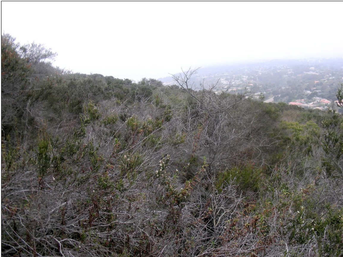
Figure 5. An old-growth stand of Chamise-Mission Manzanita-Wart-stemmed Ceanothus Association, Point Loma.