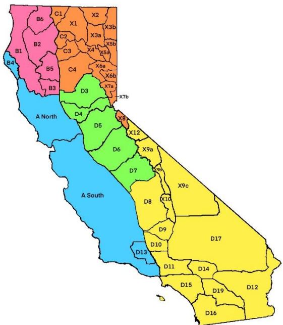
Figure 5: California's deer Disease Sampling Units (DSU).