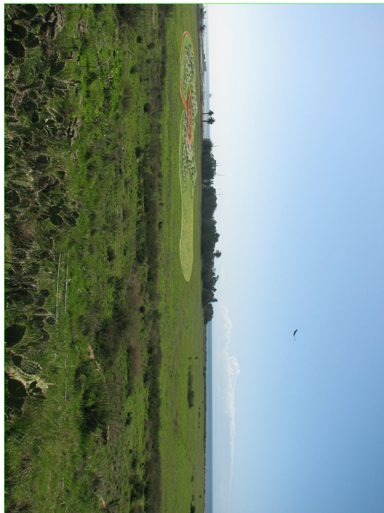
VIEW 2 FROM WARNER AVE., HIGH USE