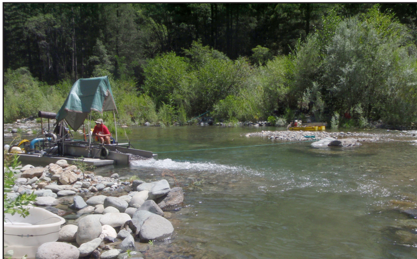
Photo i. An active dredge.