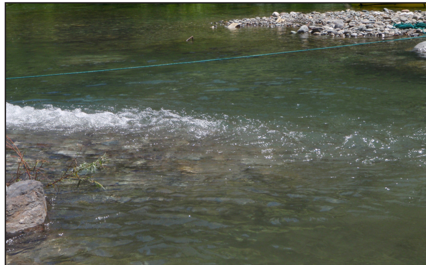
Photo j. Additional (close up) view of discharge from the dredge in Photo (i).