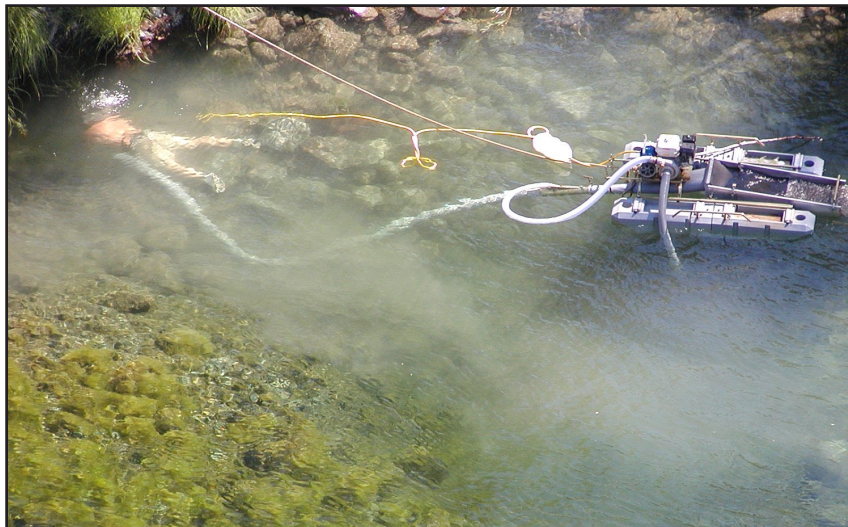
Photo e. Suction dredge in operation with diver underwater.