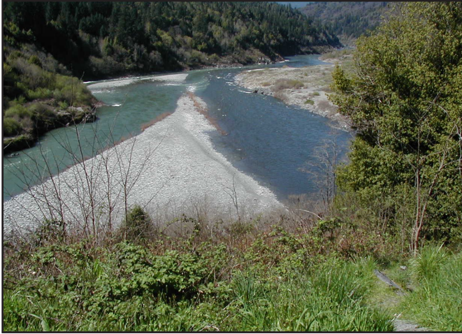
Photo a. Confluence of the Klamath River (right) and Trinity River (left) north of Hoopa, California.