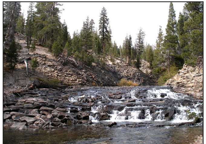
Photo f. Middlefork of the San Joaquin River near Devil's PostPile National Monument (Crossly, 2010)