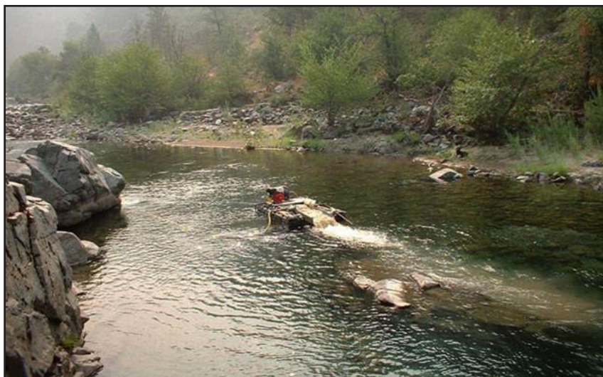
Photo g. Turbidity plume emitting from end of an active dredge, visible on right.