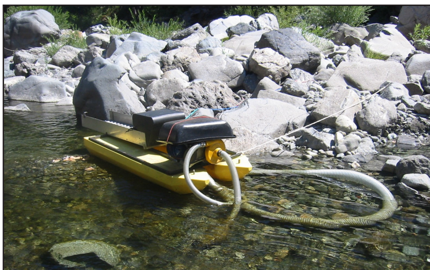
Photo c. Suction dredge anchored to stream bank and ready for use.