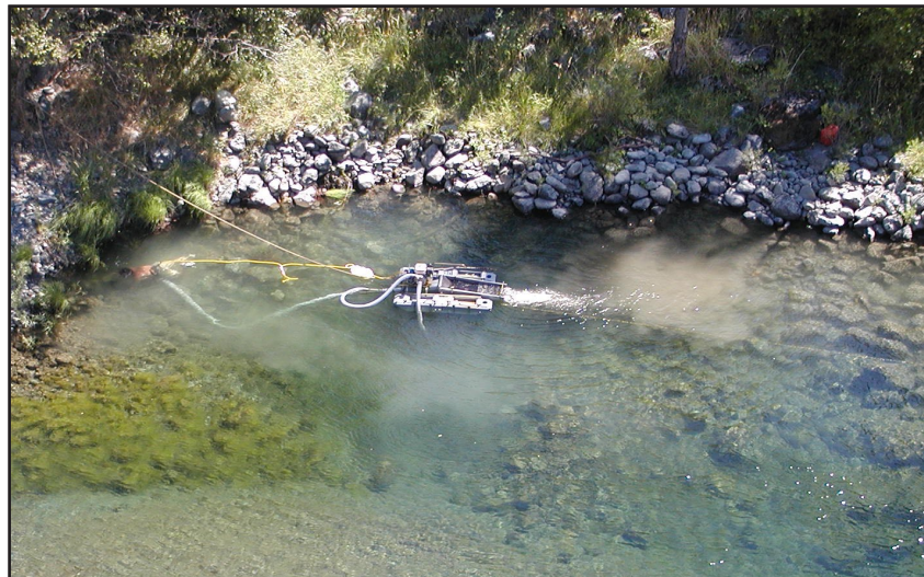
Photo f. Turbidity plume emitting from end of an active dredge, visible on right.