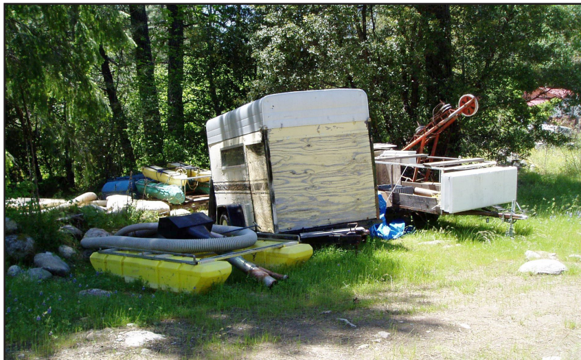
Photo a. Suction dredge wash camp. South Fork Yuba River.