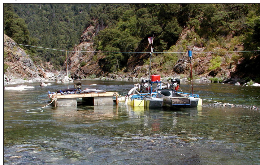
Photo d. Two suction dredge rigs tied together and secured on a rope spanning the river channel.