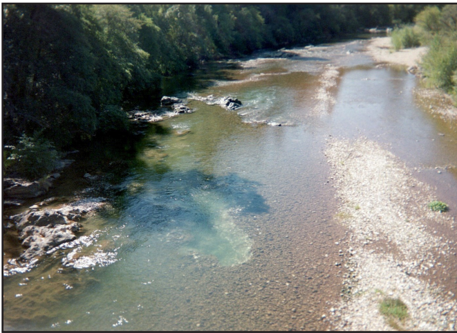
Photo c. Bear River near Auburn, California.