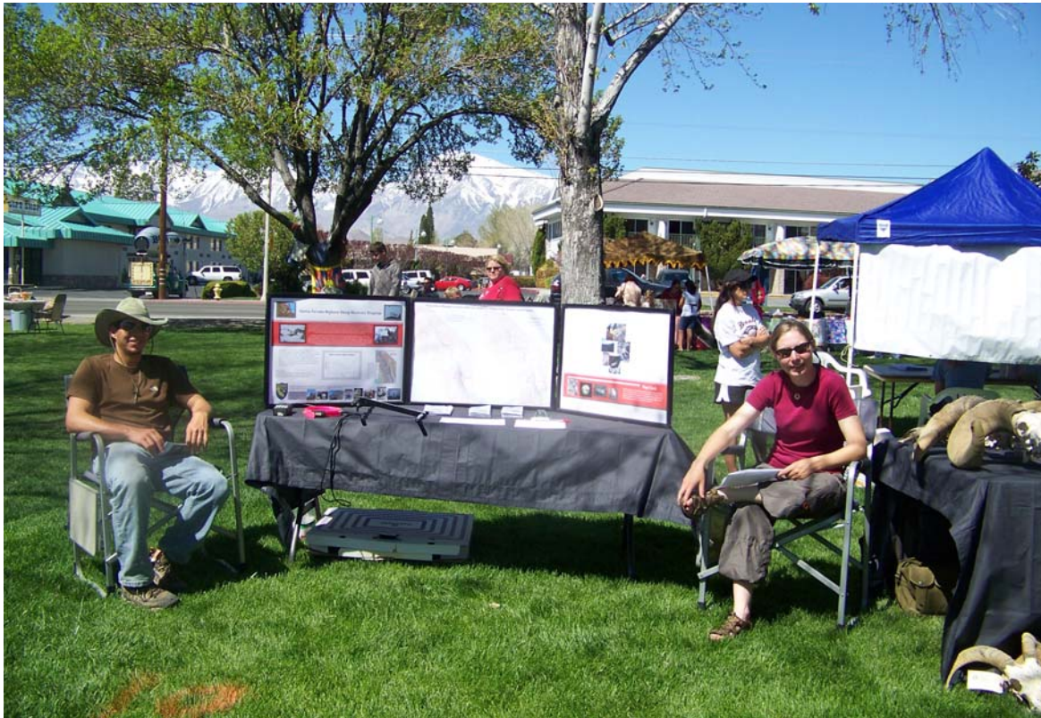
Display booth at Bishop City Park

This event gave the Recovery Program the opportunity to further the outreach and education mandate of the Sierra bighorn Recovery Plan. Key messages were defined and clarified in educational materials and talking points in accordance with the overarching outreach goal of increasing public awareness and support for recovery efforts.