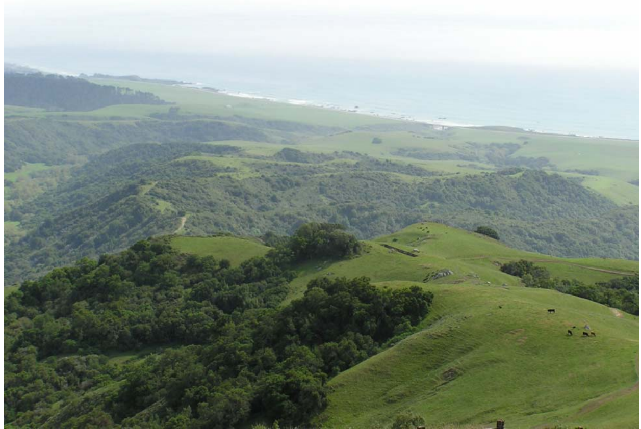
Hearst Ranch, San Luis Obispo County

As one colleague shared with the Board, "Conserving oak woodlands reflects a wise investment toward achieving clean air, safe drinking water and sustainable wildlife habitat in this fast-growing state". Since 1990, the Board has allocated $76.9 million from the HCF and the Oak Woodland Conservation Program, to protect over 167,709 acres of oak woodlands. Utilizing all other fund sources available to the Board, an additional $167.8 million has been allocated to protect 45,515 acres of oak woodlands. While a tremendous amount of work remains to be completed, the $244.7 million allocated by the Board since 1990 to protect about 213,224 acres of oak woodlands throughout California exemplifies the Board's commitment and dedication toward preserving oak woodlands.