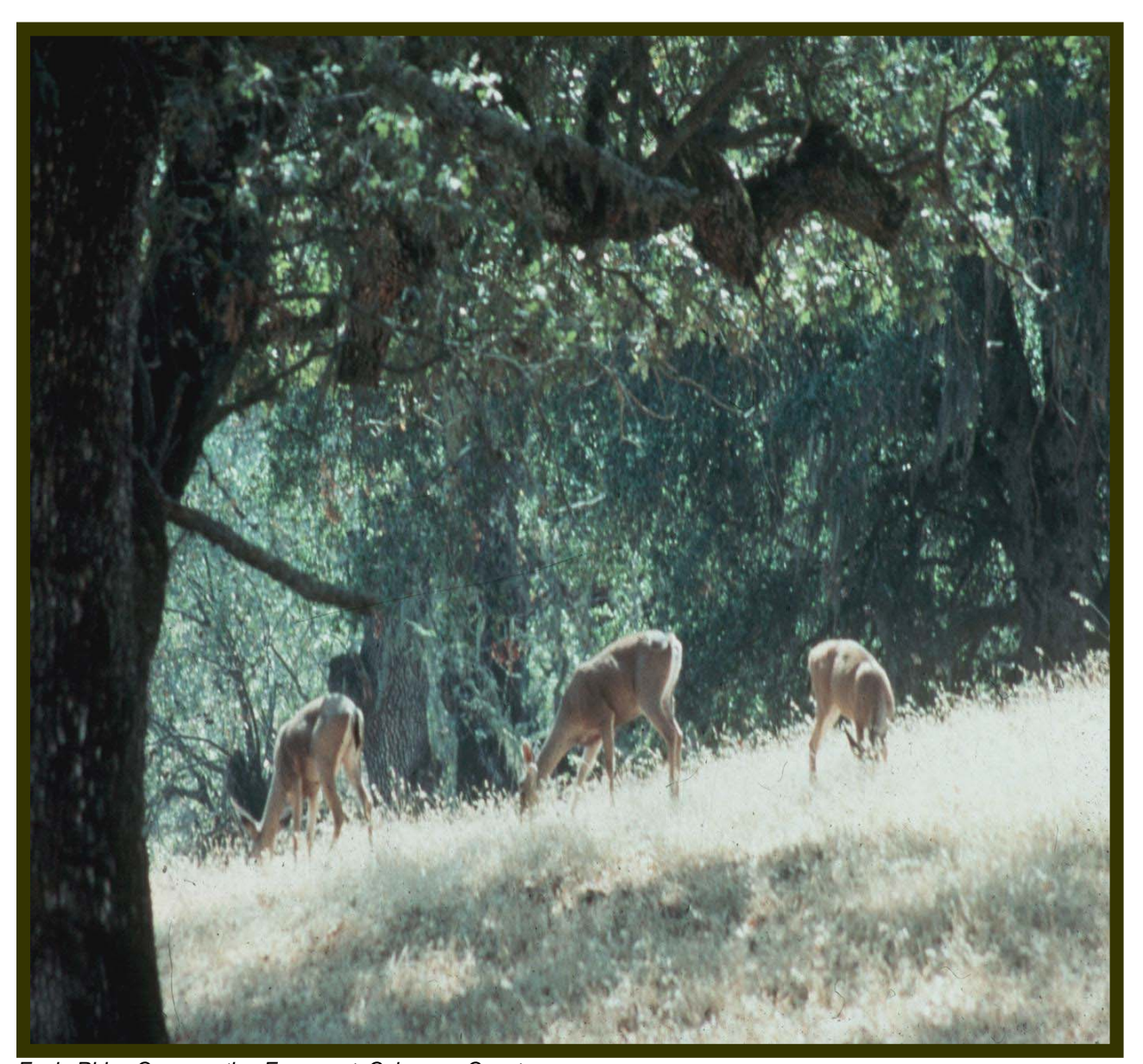
Eagle Ridge Conservation Easement, Calaveras County

Proposition 117 identified deer and mountain lion habitat as one of the eligible habitat types upon which funds should be expended. While oak woodlands were not specifically identified as a type of habitat upon which HCF funds should be expended, one can assume that oak trees and oak woodlands benefited from the allocations since deer and mountain lions generally exist within oak woodlands.