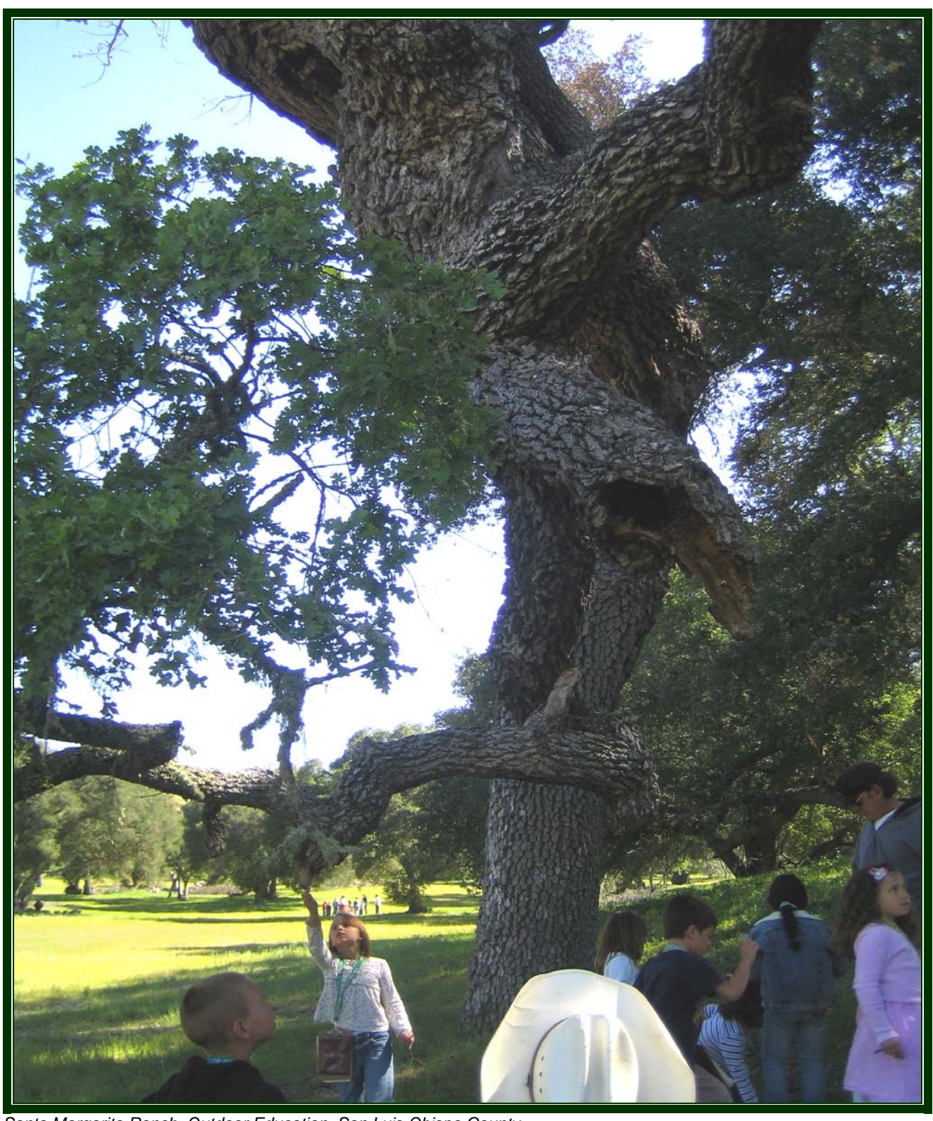
Santa Margarita Ranch, Outdoor Education, San Luis Obispo County