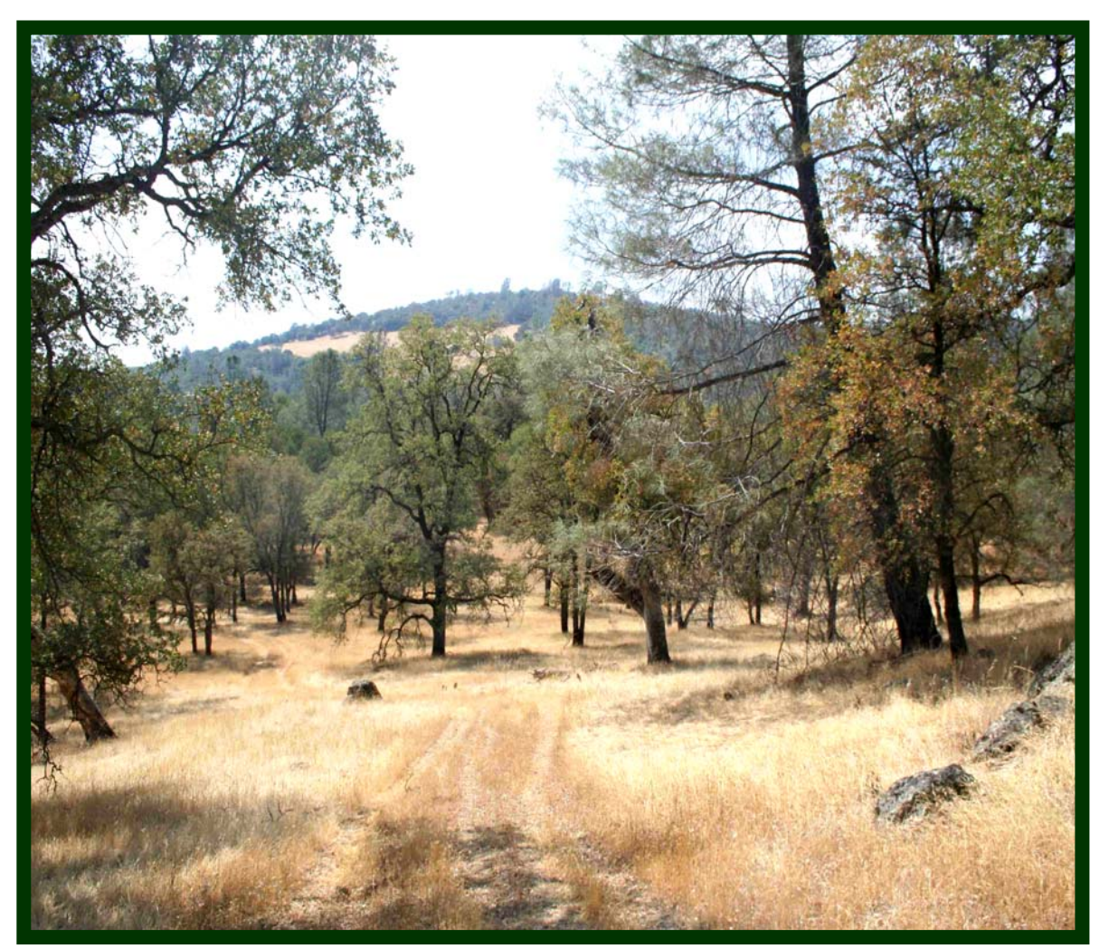
Eagle Ridge Conservation Area, Calaveras County

Since 1990, approximately 35,901 acres of oak woodlands have been protected.