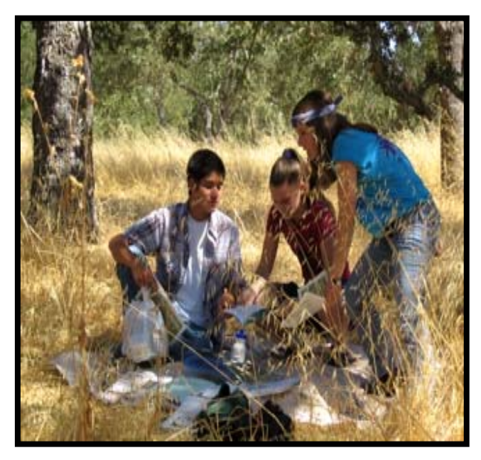
K-8 grade students learn about oaks at the Santa Margarita School in San Luis Obispo County.