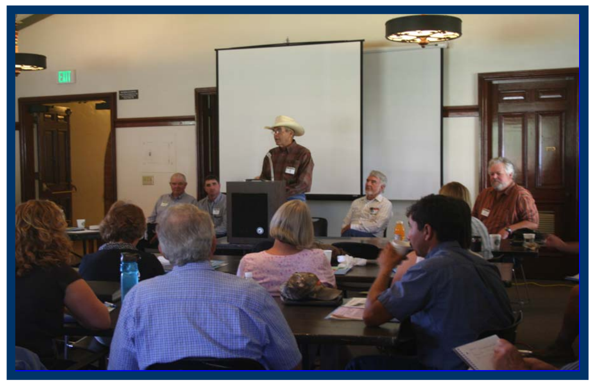
Education and Outreach to local ranchers, San Luis Obispo County

While each of the projects are designed and tailored to reach a unique audience, i.e. ranchers, planners, homeowners or grammar school students, they all have a unique feature in common. The projects are sustainable in nature and will continue to provide benefits beyond their initial applicants. The knowledge and expertise gained by each of the participants, that range in age from 72 years to 8 years of age will help shape future management and conservation of oak woodlands.