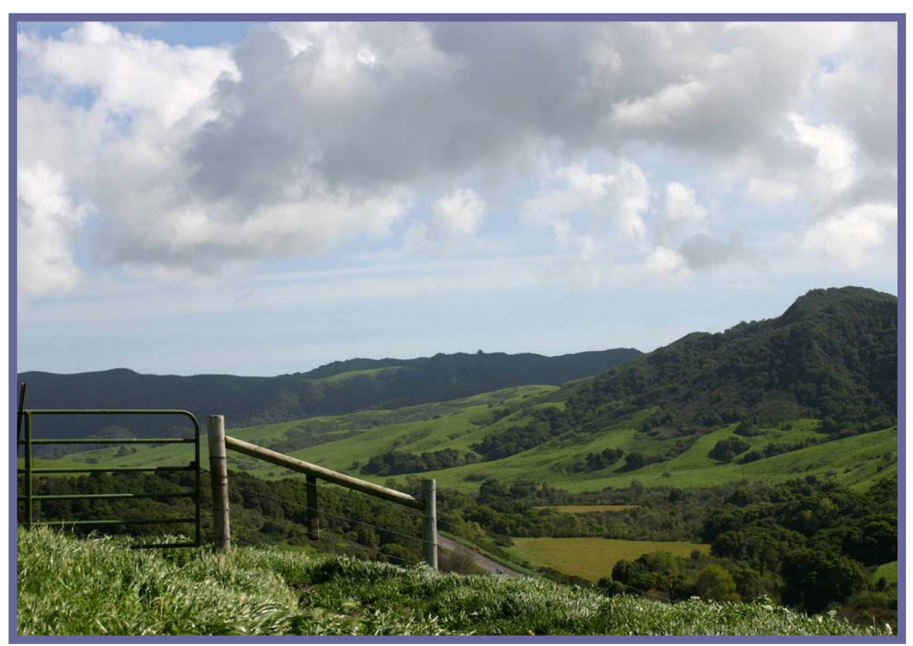
Scott River Easement, Siskiyou County