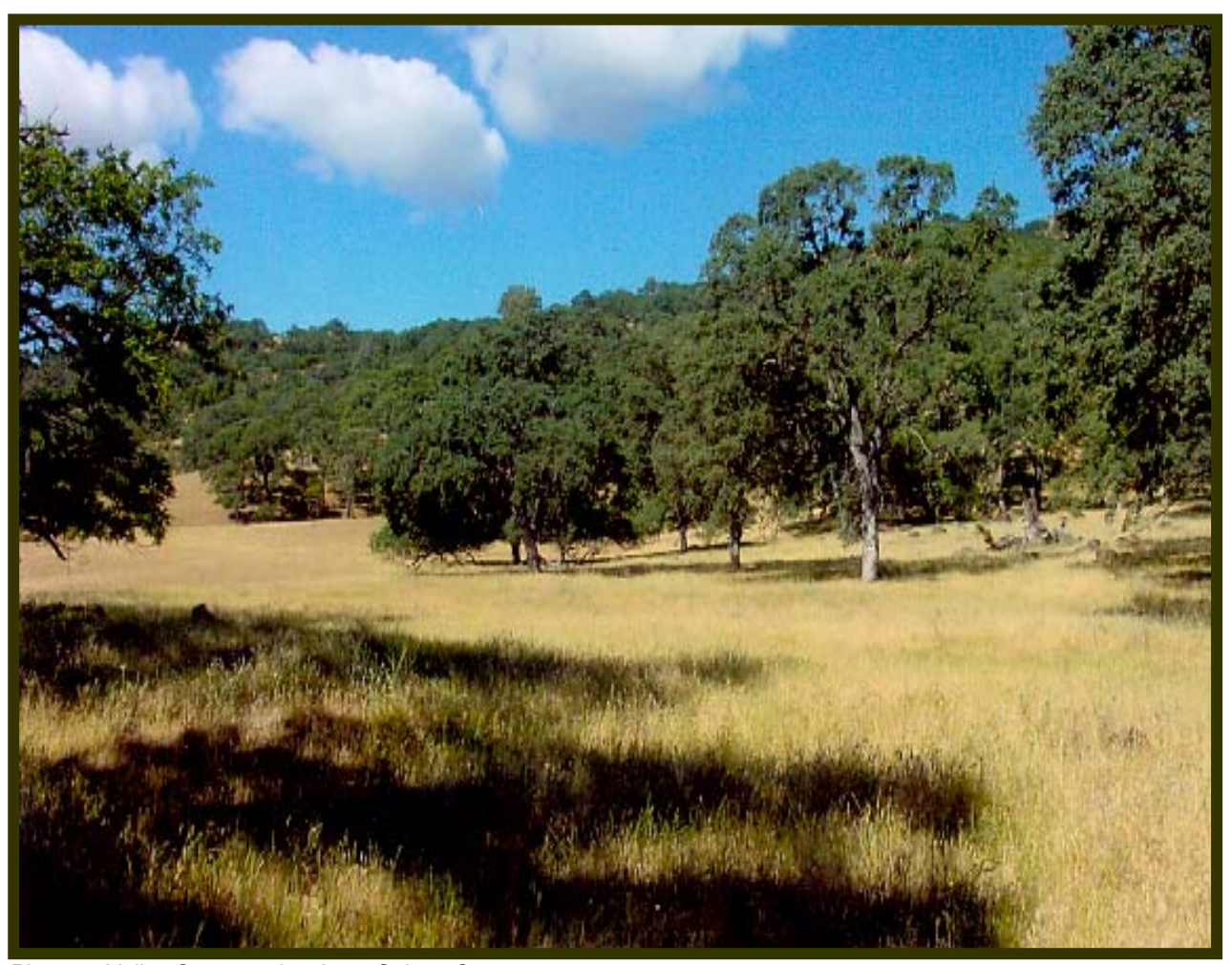
Pleasant Valley Conservation Area, Solano County

The Act requires that at least 80 percent of the money be used for grants for the purchase of conservation easements, for restoration activities or for enhancement projects. In addition, the funds may be used for grants that provide cost-share incentive payments and long-term agreements. While the Act specifies how the monies are allocated, the Act requires that priority be given to grants that result in the purchase of oak woodland conservation easements.