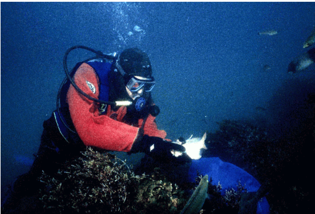
Releasing a tagged sheephead at Pendleton Artificial Reef.