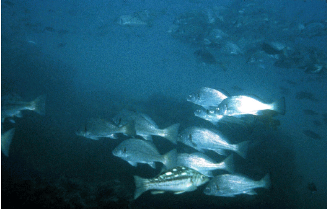
Schools of black croaker on Pendleton Artificial Reef.