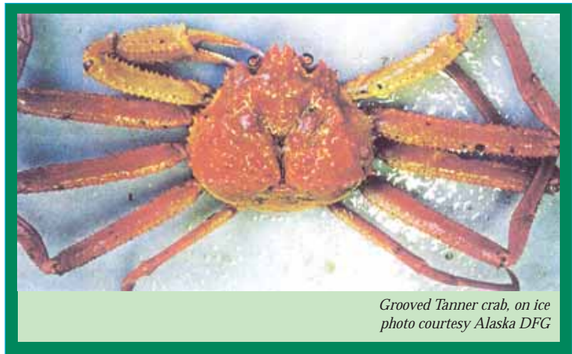
Grooved Tanner crab, on ice

tanneri fishery met the definition of an emerging fishery under the terms of California's Marine Life Management Act, the DFG presented tanneri fishery management recommendations to the Commission in February, 2005. The next step will be for the DFG to refine the tanneri regulatory package and bring it before the Commission again at the May 2005 meeting, thus beginning the process of adopting regulations for the new fishery. 🦀