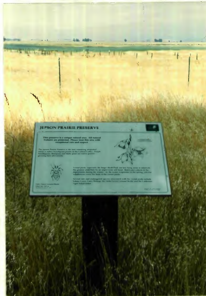
Figure 6: Interpretive signs face a vista of Jepson Prairie and Olcott Lake