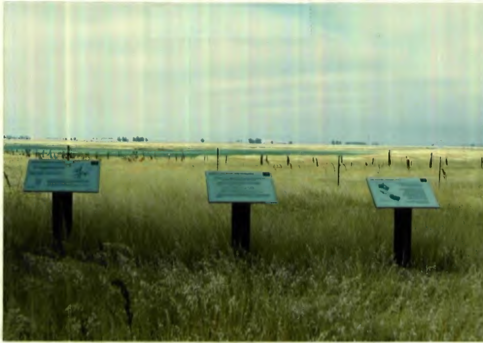
Figure 5: Interpretive signs within visitor area