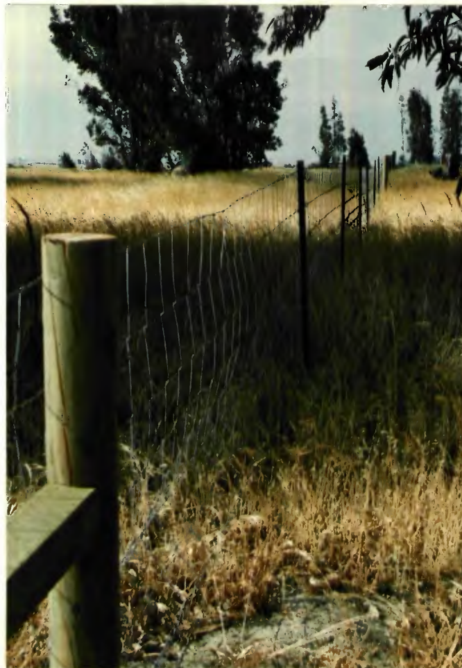
Figure 4: Another angle of the new fence