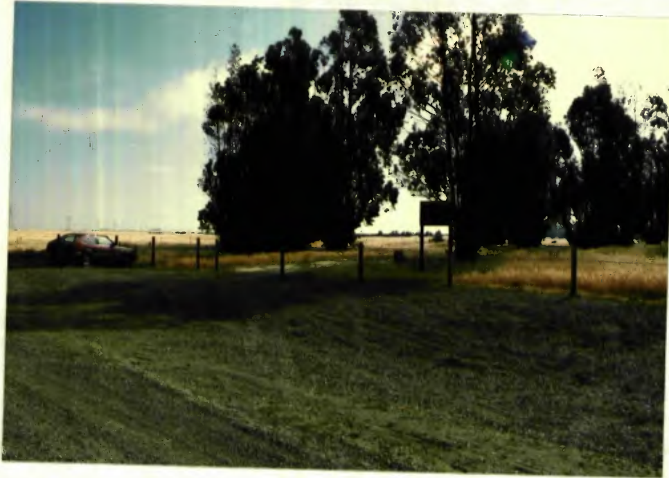
Figure 7: New parking area in front of the enclosed visitor's space