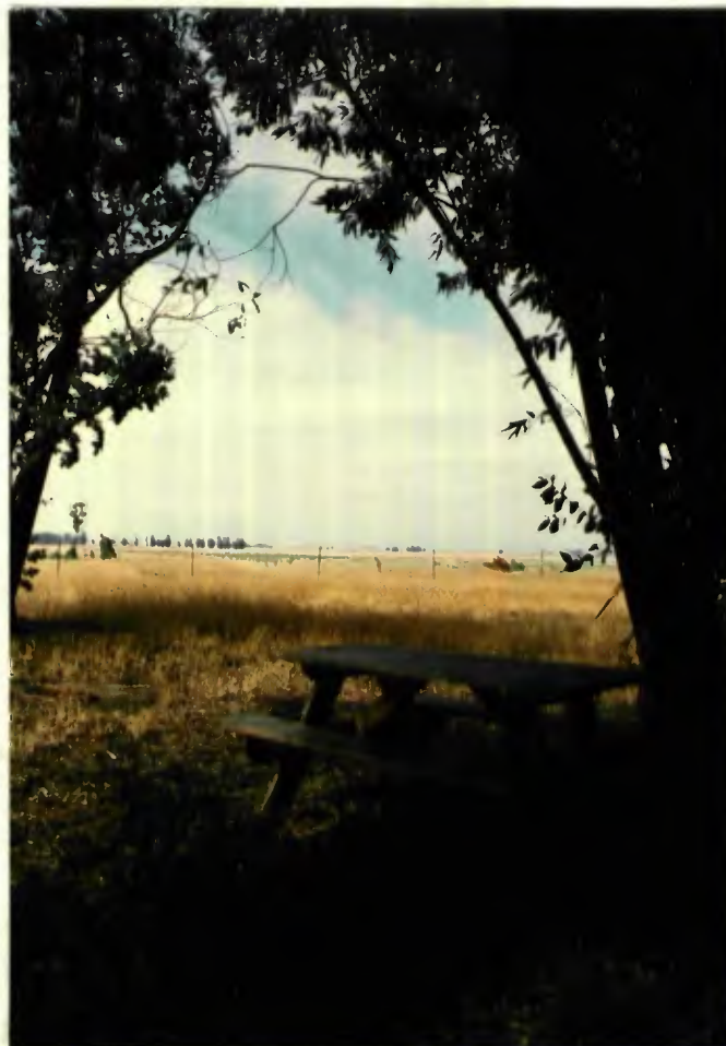
Figure 2: Picnic Area with view of Olcott Lake