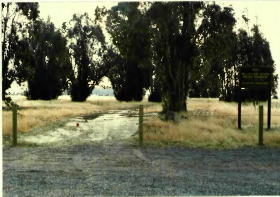
Figure 1: Enclosed Visitor Area at Preserve Entrance