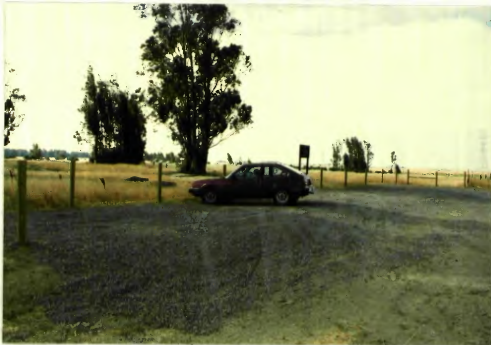
Figure 8: Another angle of the parking area