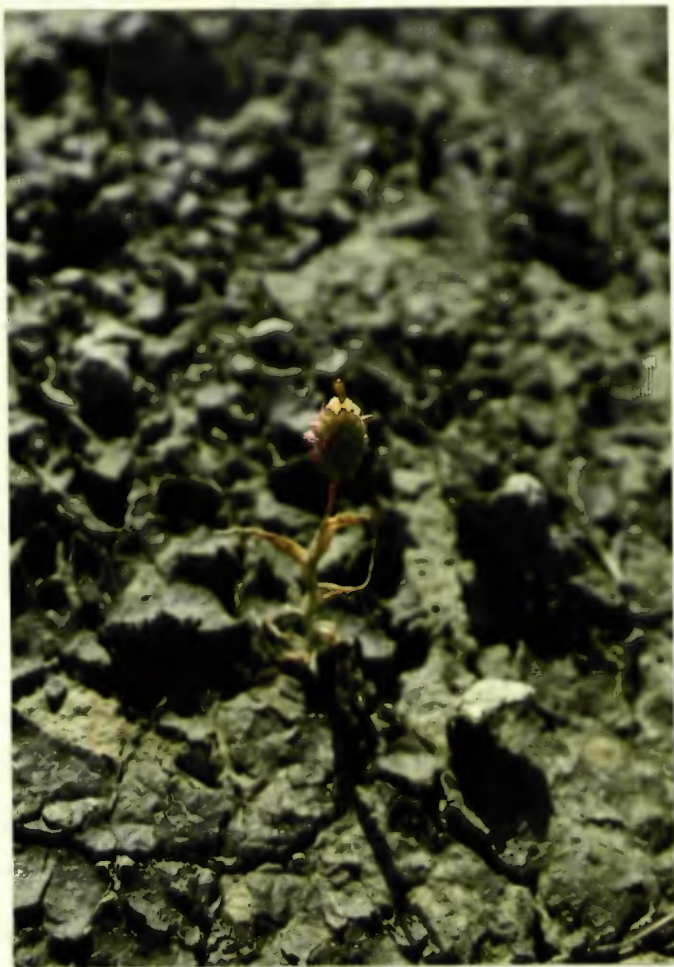
Neostappia colusana : an endangered vernal pool species found in Olcott Lake (photo taken 7/8/91)