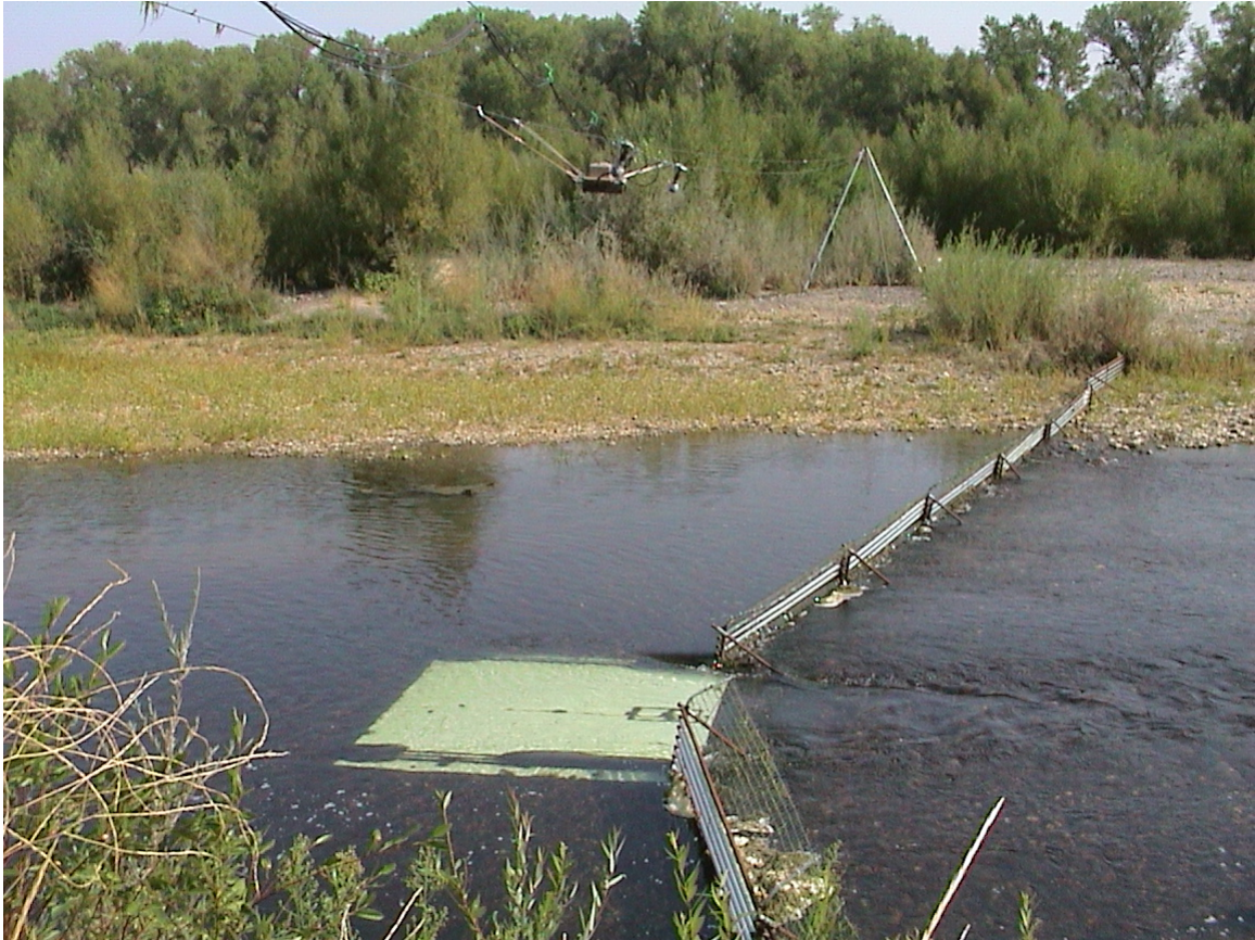
Figure 2. Video station camera box, lights, weir and passage opening with white plates visible. Camera is suspended from two overhead cables which are anchored to riparian trees and to a tall pipe tripod. Inside camera box is wiring junctions for electrical and video systems, and photo cell to turn lights on at dusk.

We selected a PC88WR black and white camera that provided the adequate images in various lighting conditions. The low cost ($115) camera was vastly superior over color cameras in low-light situations. The weatherproof camera was attached on the outside of a larger box that contained remote lighting and other wiring hookups (Figure 2). We also constructed an underwater housing from PVC pipe fittings and used a second similar camera to operate underwater at the lower edge of the weir opening, (visible in cover photo at lower left of white plates), to aid in species identification. The underwater camera was also used to check the salmon passing close to the camera for adipose fin clips (hatchery origin).