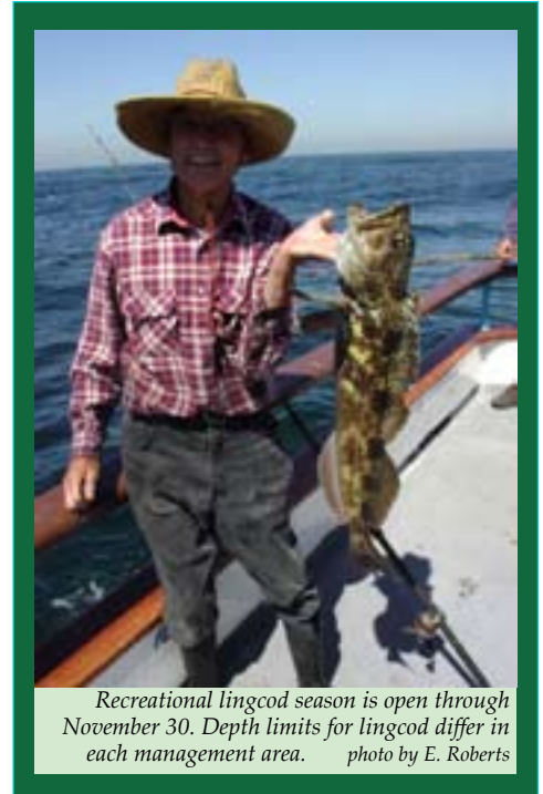
Recreational lingcod season is open through November 30. Depth limits for lingcod differ in each management area.

"Groundfish Regulation Changes" continued on page 8