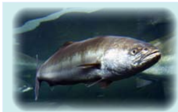
Hatchery-raised white seabass