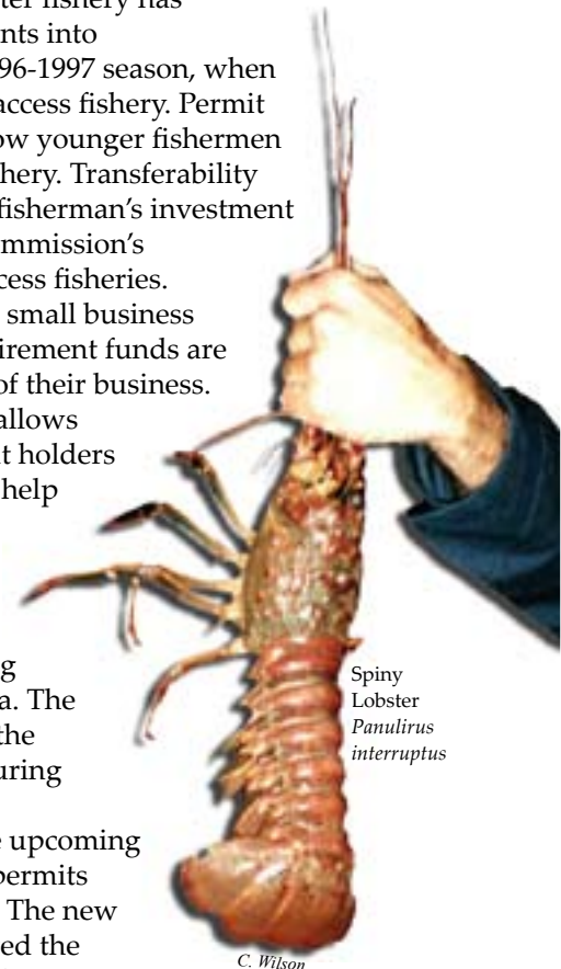
Spiny Lobster Panulirus interruptus