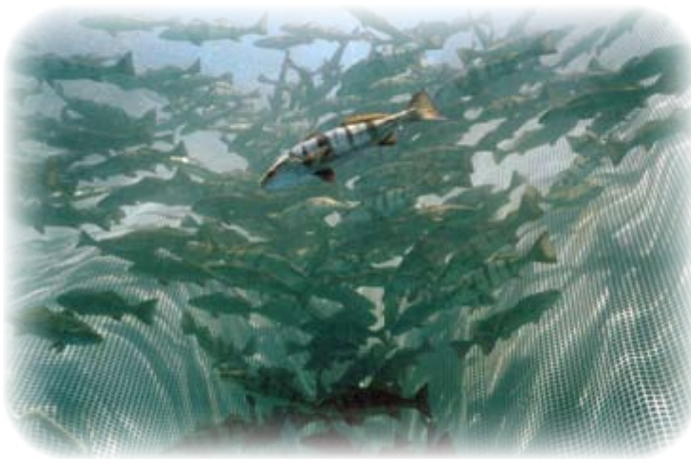
White seabass mill about in a holding pen. It takes four to five years for white seabass to reach legal size (28 inches total length).