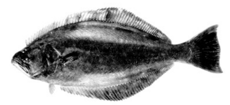
California Halibut, Paralichthys californicus

Although California halibut range from the Quillayute River, Washington to Almejas Bay, Baja California, the