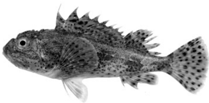
California Scorpionfish, Scorpaena guttata

No population estimates exist for California scorpionfish. However, data from trawl studies conducted by the Los Angeles County Sanitation Districts, Southern California Coastal Water Research Project and the Orange County Sanitation District from 1974-1993 show that there are substantial short-term fluctuations in California scorpionfish abundance within the Southern California Bight.